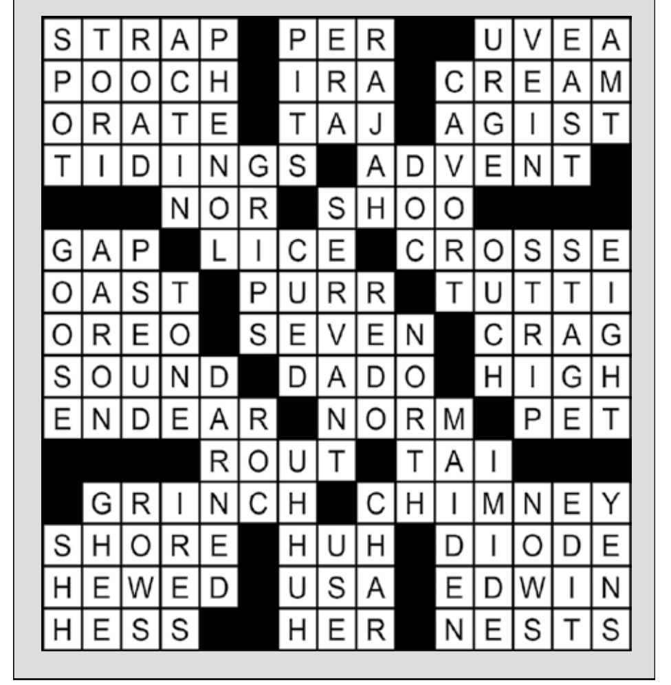
"Now get back out there and fight for your