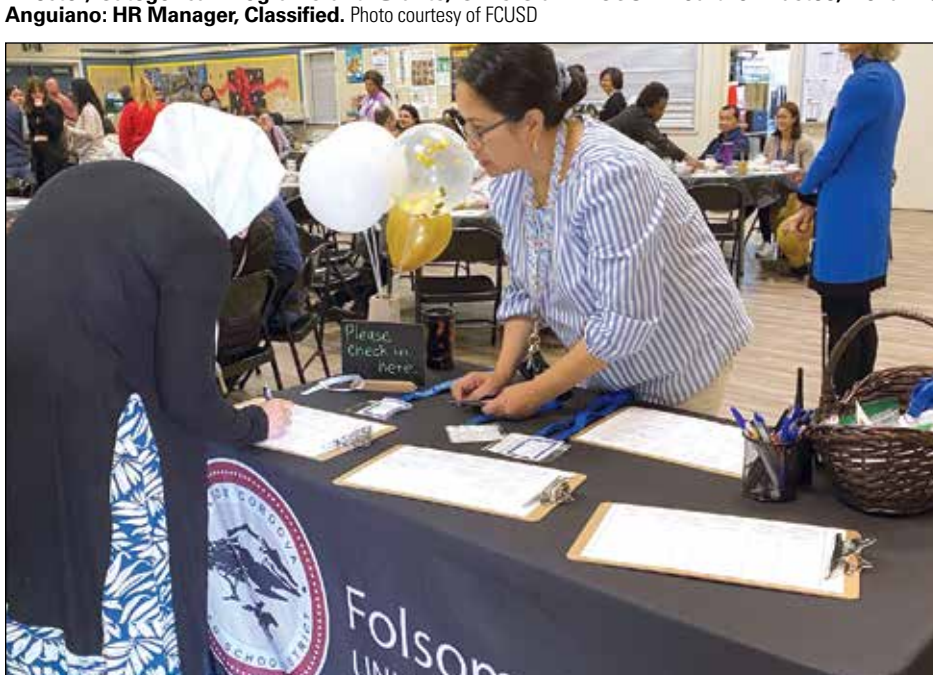
FCUSD staff help check in parents attending this year's Parent Summit.