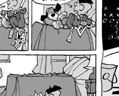
honor, your school and my job!