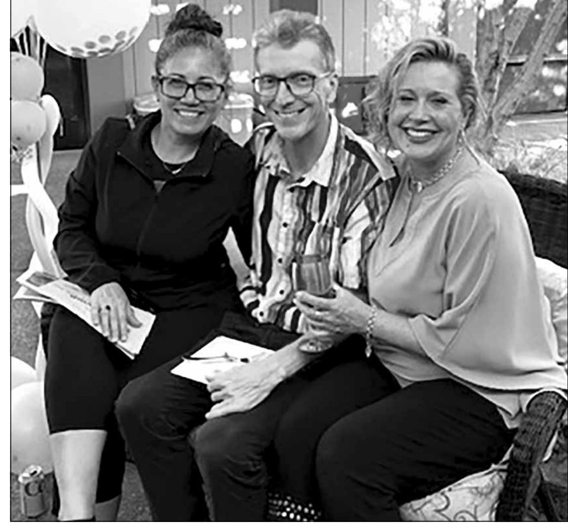
The team of caring professionals at Absolute Compassion Hospice provide personalized expert care services 24 hours a day.

The first resident at their new jointly owned facility, The Meadows at Country Place, had no children or other close family to help with the ups and downs of dealing with his chronic and incurable terminal illness. As an assisted living (non-medical) facility, they naturally had no way of making medical decisions or providing medical comfort care, so every time the resident had extreme pain or other