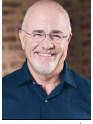
Be Gentle, He's Moving in the Right Direction