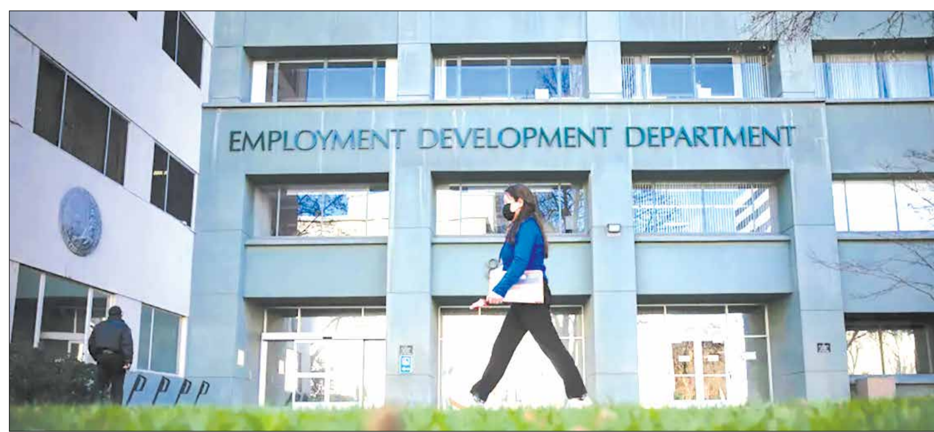
The offices of the Employment Development Department in Sacramento where it all went wrong.

EDD changes unemployment contractor after scams