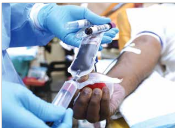
The community's need for blood and blood products. There is currently a critical need for blood, and all blood types are needed.

The blood drive will take place on Friday, January 19, from 12 - 4 p.m. at the Citrus Heights City Hall,