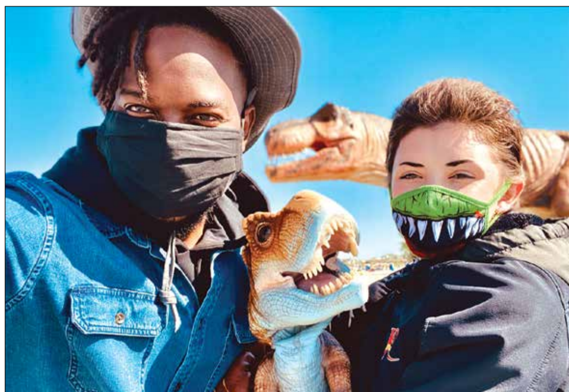
Dino Dustin and Bronto Brittany play 'keep away' with Tyson and the T-Rex's mom.