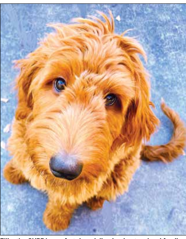
Elie, the CHPD's comfort dog, delivering joy to a local family.