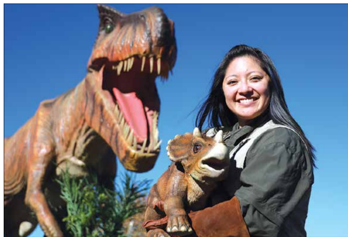
Trixie the Triceratops is kept momentarily safe in the hands of a Jurassic Quest trainer.

that move and roar, allowing guests to experience them as they were when they roamed Earth millions of years ago. Jurassic Quest works in collaboration with leading paleontologists to ensure each dinosaur is painstakingly replicated in every detail, from coloration to teeth size, to textured skin, fur or feathers, drawing on the latest research about how we understand dinosaurs looked and moved. Families also have the unique opportunity to meet the babies, hatched only at Jurassic Quest: Cammie the Camarasaurus, Tyson the T-Rex and Trixie the Triceratops.