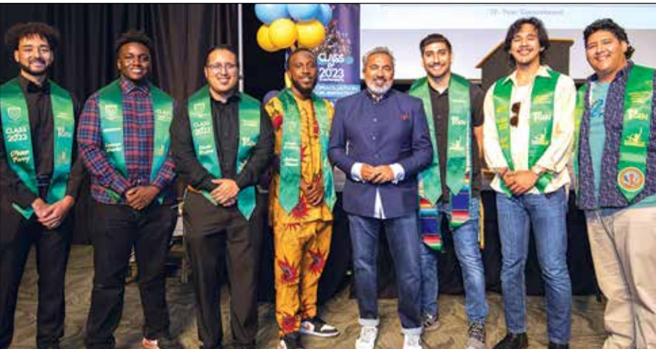
Rep. Ami Bera with graduates at the Improve Your Tomorrow graduation ceremony, June 2023.