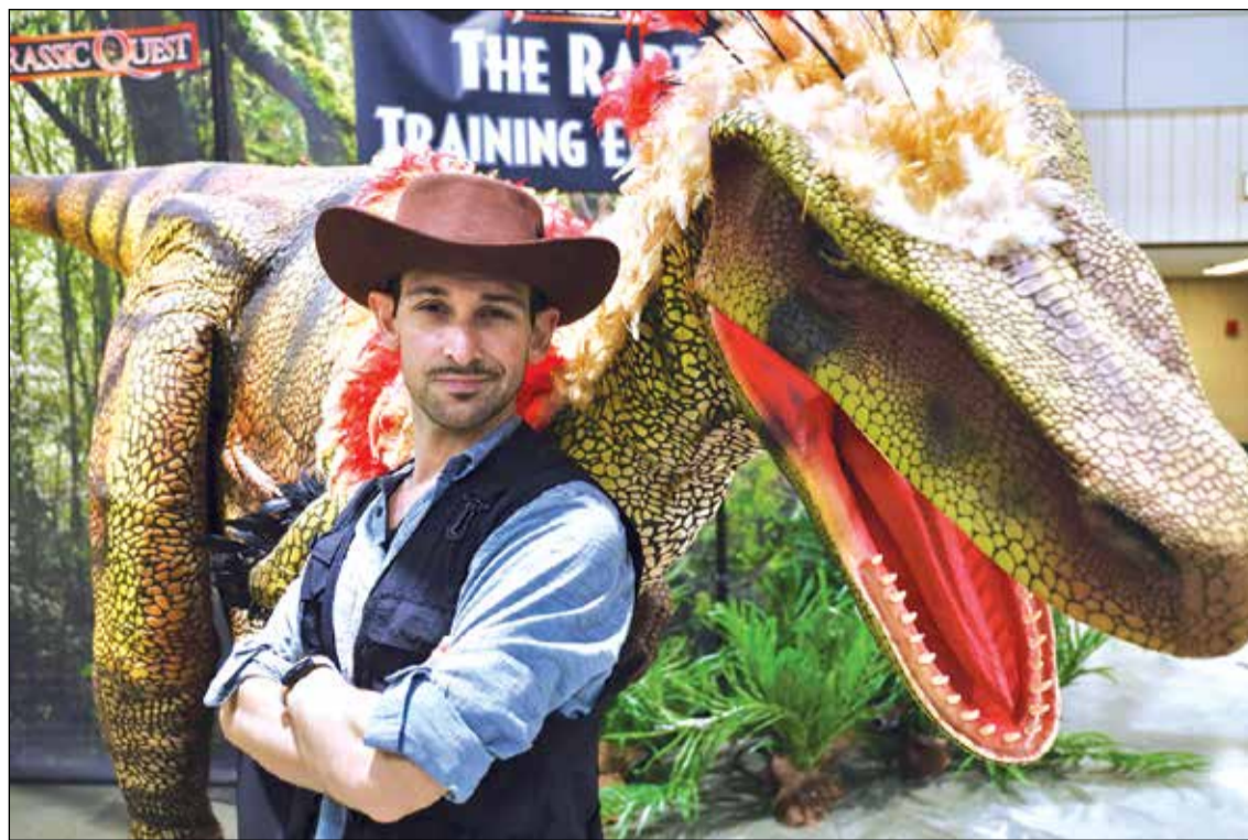
Bronco Brian partners with velociraptor JoJo for a fun day of adventure at Jurassic Quest.

The Jurassic Quest herd of animatronic dinos – from the largest predators to playful baby dinos – are displayed in realistic scenes with some