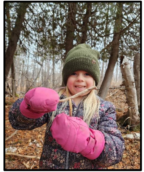
Making the letter “T” with sticks!