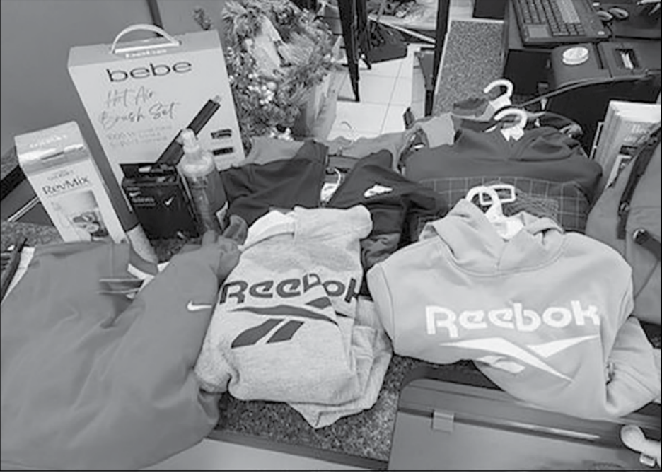
CHPD image of merchandise seized during Retail Theft BLITZ Operation.