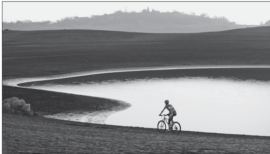
Folsom Lake State Recreation Area, one of the potential sites for a Parks and Tranquility Project art installation.