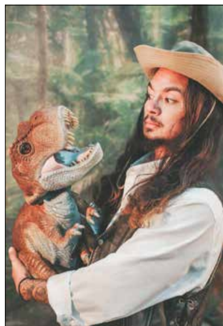
Tyranno Tony makes sure Tyson the T-Rex gets whatever keeps the baby happy.

Advance purchase online recommended to ensure desired date and availability at www.jurassicquest.com , or tickets are available on-site, and include a 100% ticket guarantee that in the event of a show cancellation or postponement for any reason, ticket purchases will be automatically refunded for the full purchase amount. ★