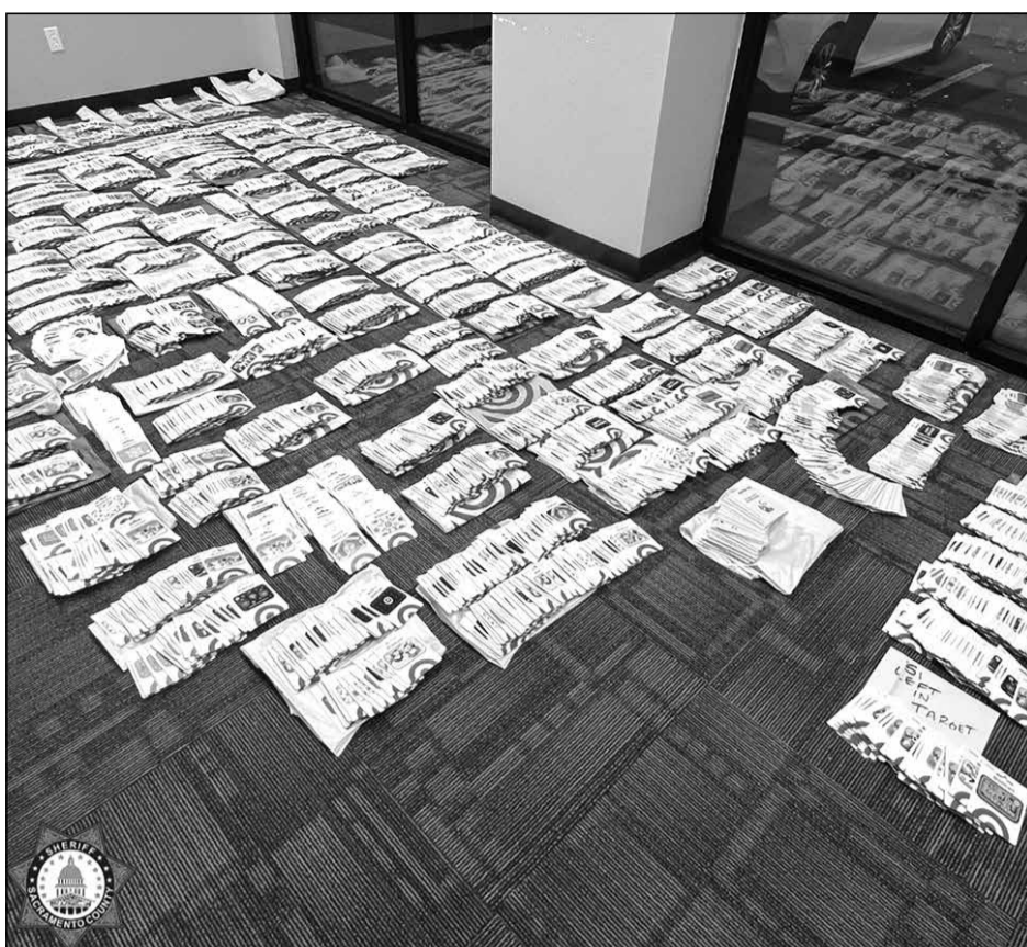
Over 5,000 gift cards were found in Ningning Sun's possession.