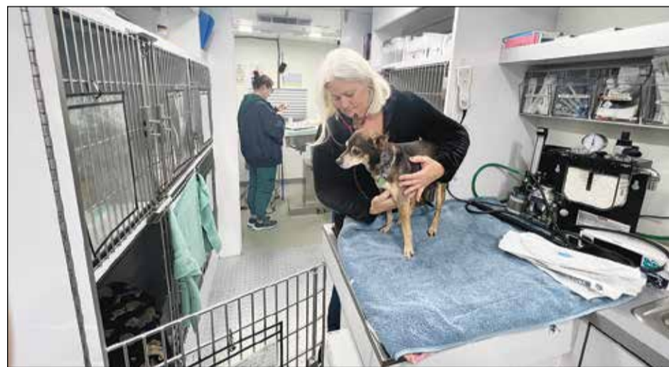
Dr. Metcalf assesses a new patient.

The public can learn more about PAWS and view a calendar of upcoming service areas at the Sacramento County Animal Care Services website. ★