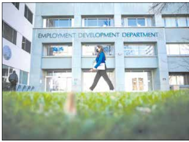
The offices of the Employment Development Department in Sacramento where it all went wrong.

The contract will primarily be paid for through a debit card revenue-sharing agreement, similar to the EDD's previous deal with Bank of America. The agency will also pay $32 million over five years for Money Network to offer a long-discussed direct deposit option to workers' bank accounts, which the