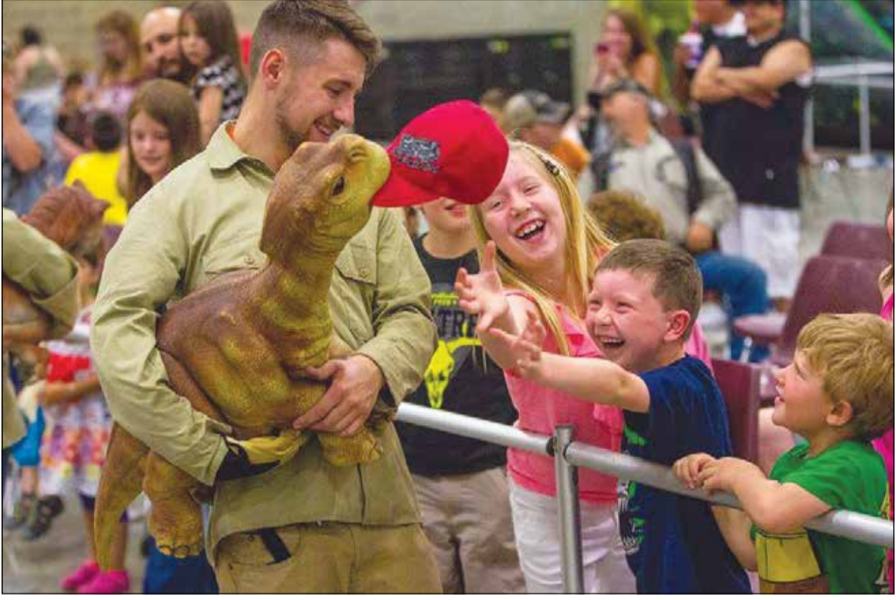
Cammie the Camarasaurus plays a trick on an unsuspecting child by stealing the boy's hat.