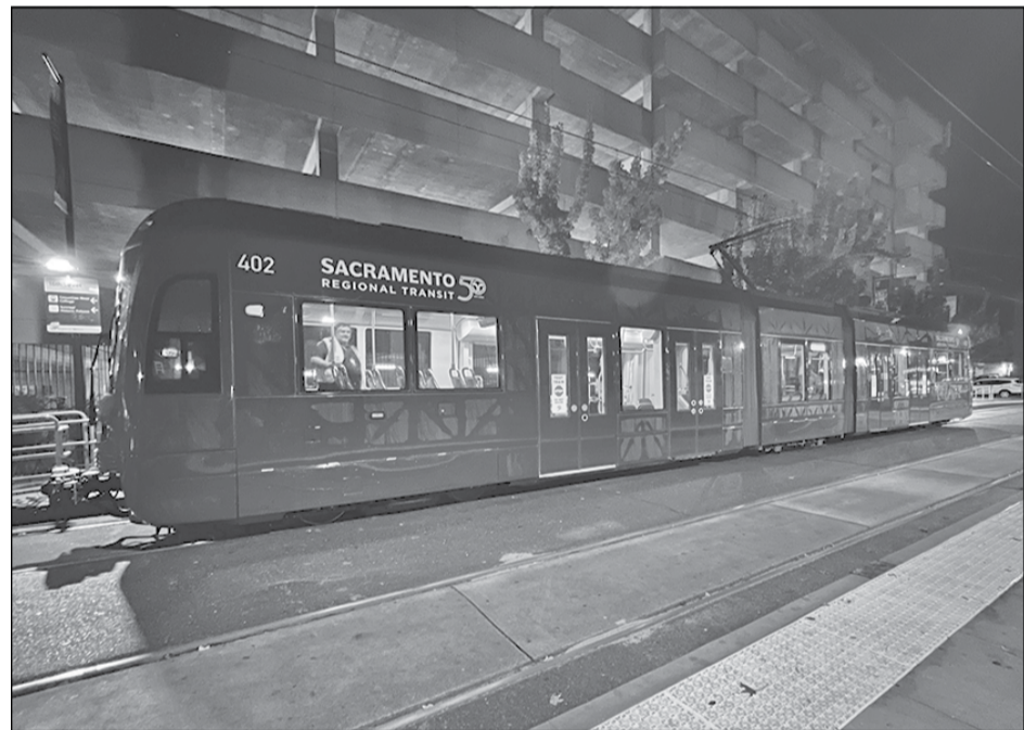
A low-floor test train at 16th Street on December 7, 2023.