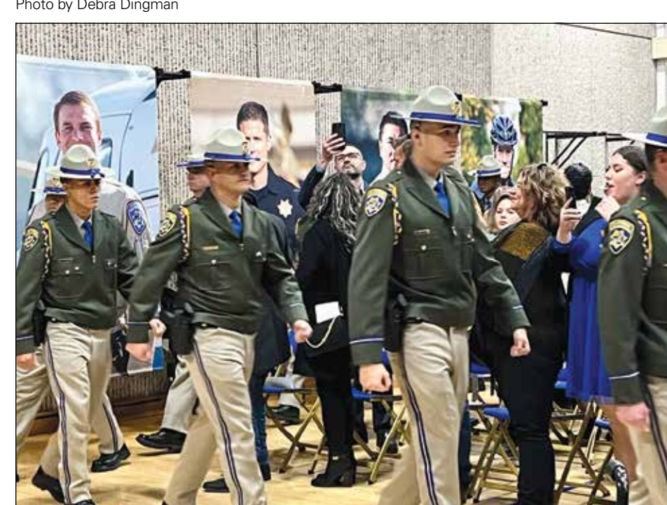
Filing into their graduation ceremony, new CHP Officers were captured in photos by hundreds of proud families.