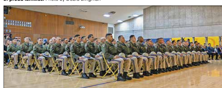
The newest graduating class of the California Highway Patrol at last week's Sacramento ceremony.