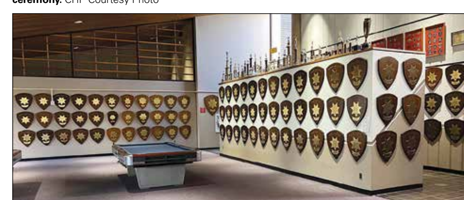
Each CHP graduating class is immortalized on the walls of the Academy making an impressive display throughout the entire facility.