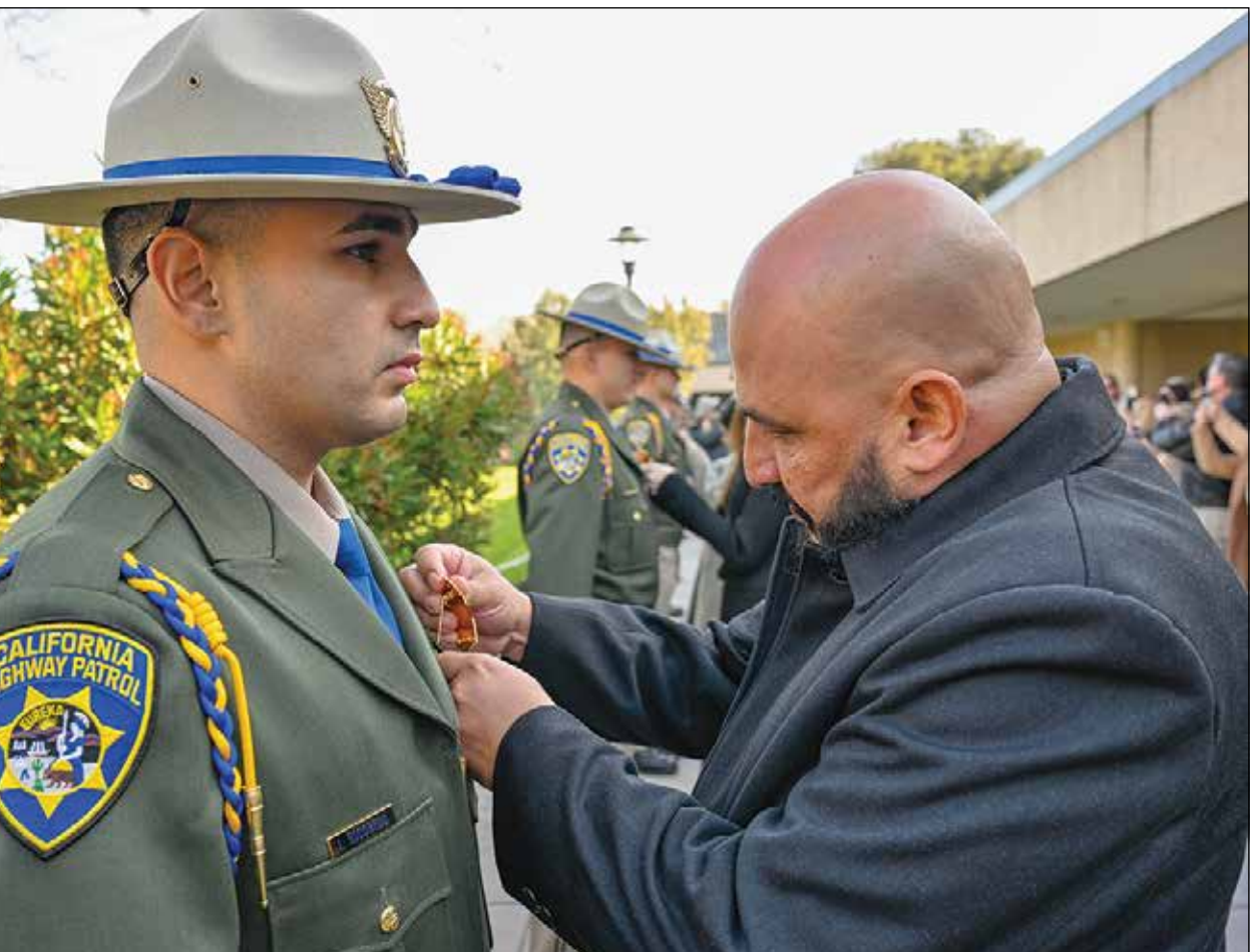
A graduate is being officially pinned by a family member.