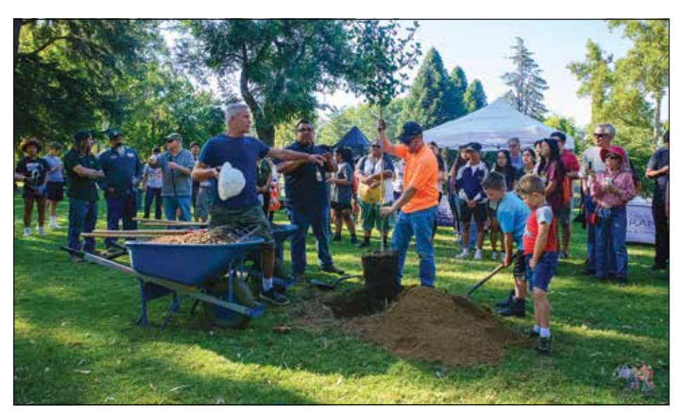
A tree is lowered into a hole at William Land Park with young volunteers at the ready.