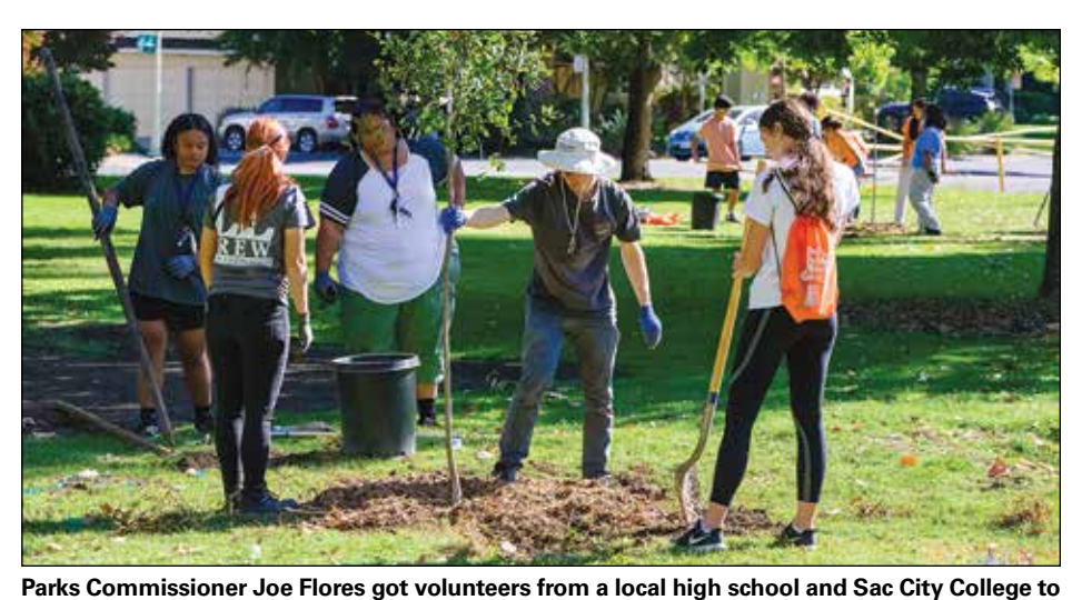
help plant trees at William Land Park.

Sacramento County remains committed to ensuring the safety of its youngest residents through proactive community engagement and education on proper car seat usage.