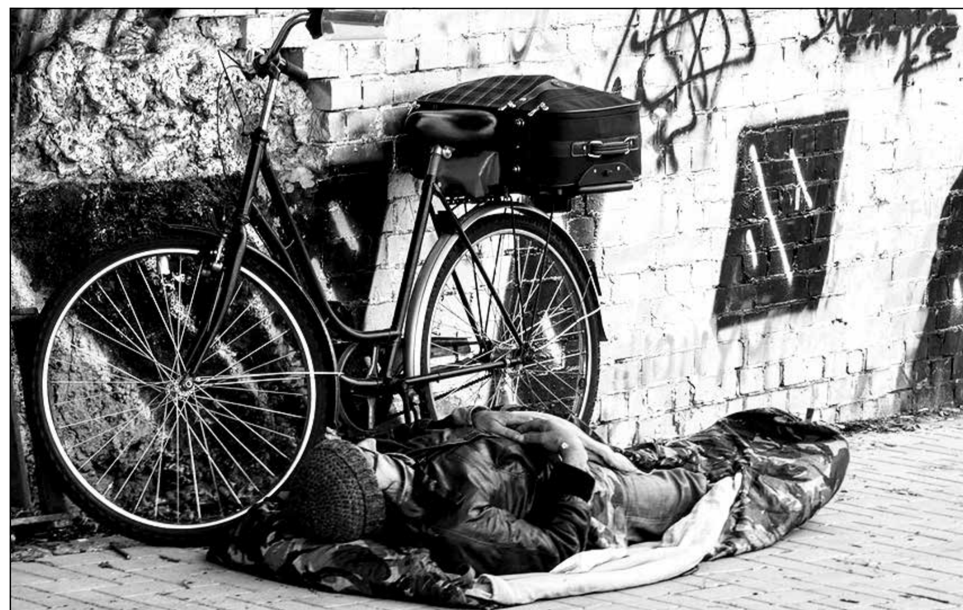
A recent abatement effort cleared many encampments where unhoused people were sleeping, but some individuals continue residing in the park.

Supreme Court will hear case about homeless encampments, with huge implications for California