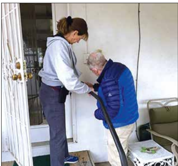
Rebuilding Together Sacramento volunteer and Safe at Home recipient test newly made home modifications.