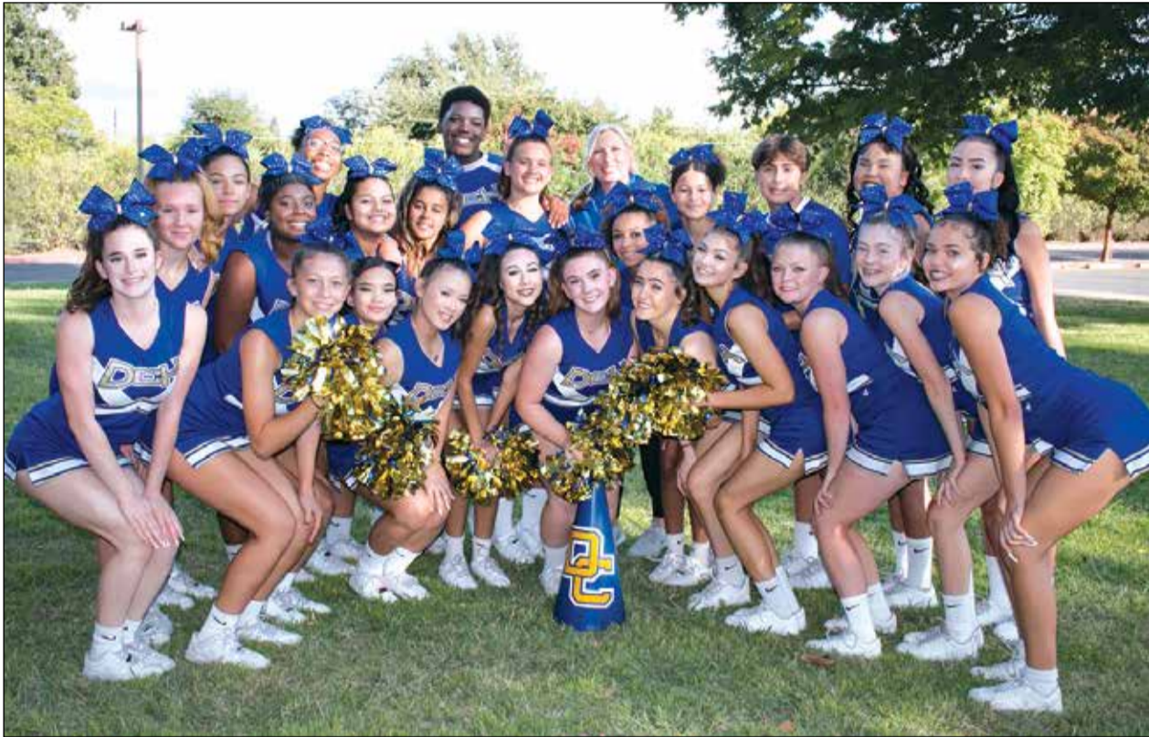
Del Campo cheerleaders recently hosted Regional cheer competitions at their Dewey Dr campus.