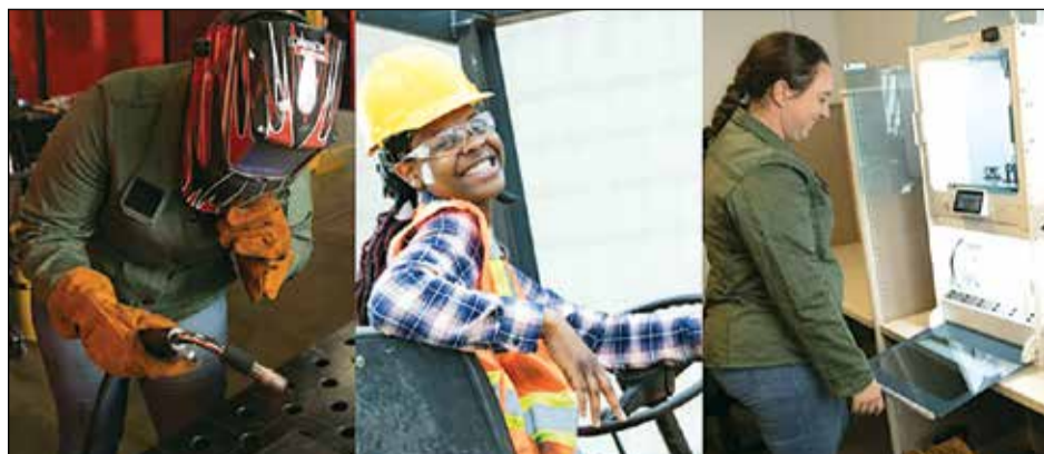
Opportunities are endless for single mothers nowadays.