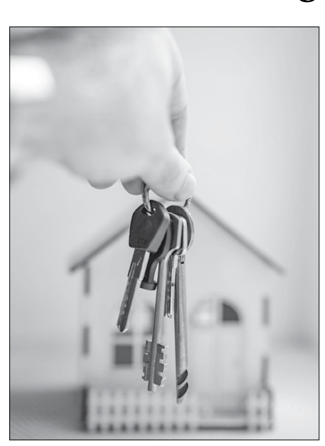
The only way to restore affordability is to reduce fees and incentivize builders to build more homes to meet the ongoing need.

"We'd also like to thank Sacramento County officials for working with us to lower their water connection fees for apartments and other multifamily housing options. One of the