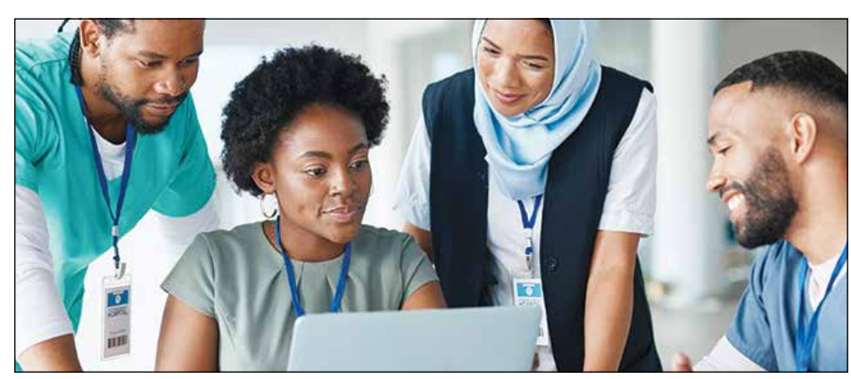
Diversity is a widely discussed topic - and it remains a crucial factor as people look for an employer or a business partner.