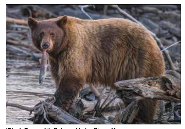
'Black Bear with Salmon' is by Steve Harms

The Photo of the Year was selected from the top 17 winning images for 2023. The other contenders are below. All images are viewable online.