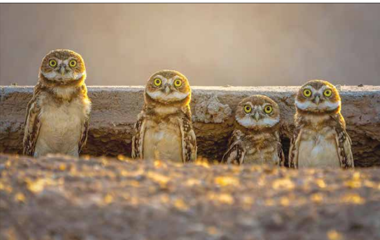
'Juvenile Burrowing Owls' is by Paulette Donnellon.

California Watchable Wildlife News Release