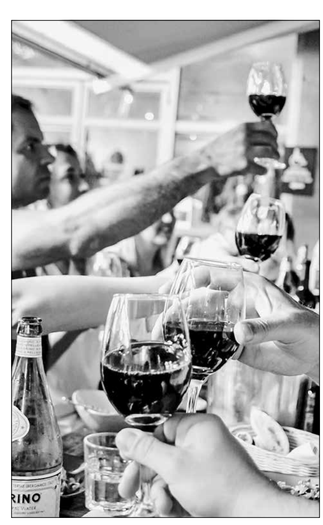
Applicants must have an ABC Online Services account with the License Administrator role, MPG Courtesy Photo

required documents or approvals. To qualify for the online authorization, the event must be more than