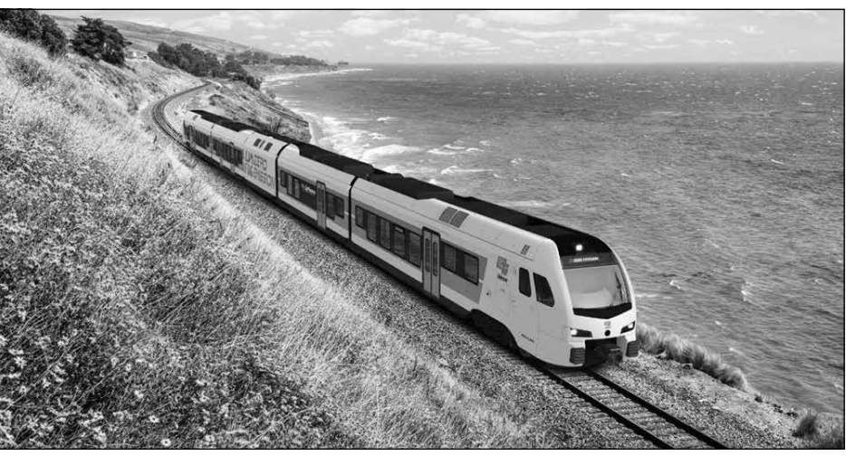
A rail fleet takes a coastal route.