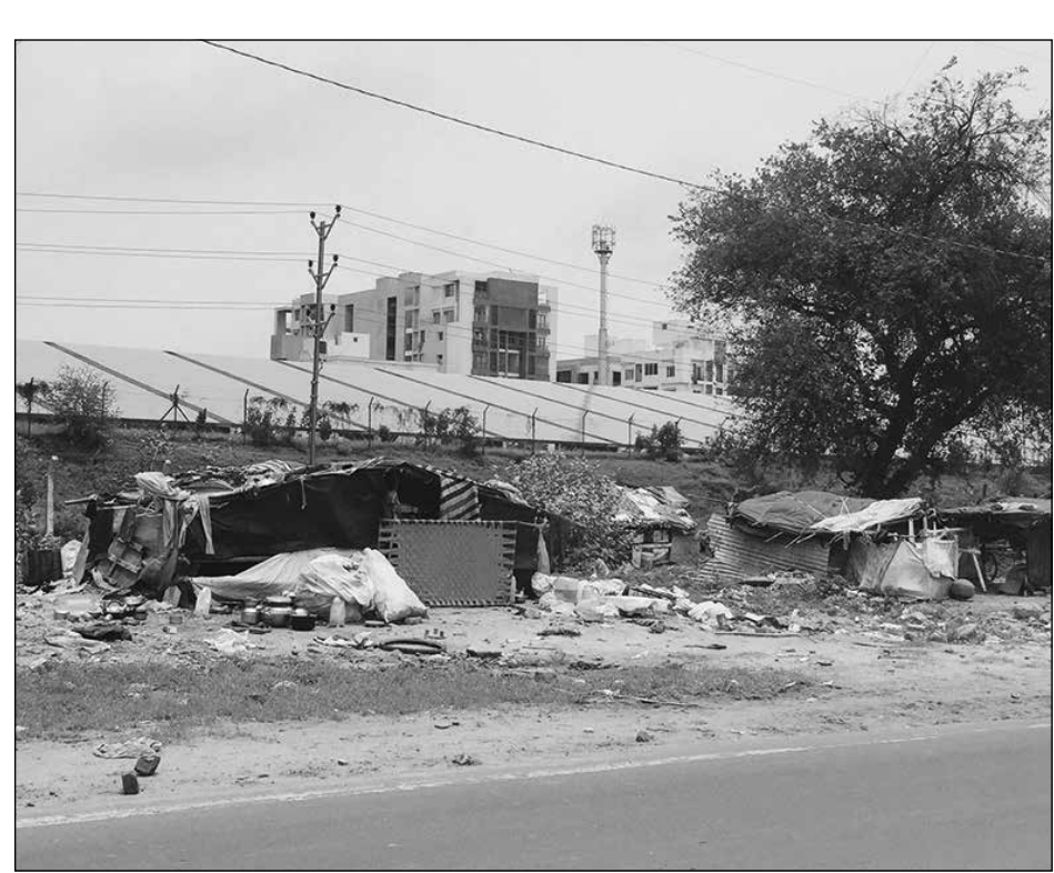
The overwhelming support was consistent across every demographic and geography including the Bay Area and Los Angeles.

For more information, go to www. CASafeCommunities.com.