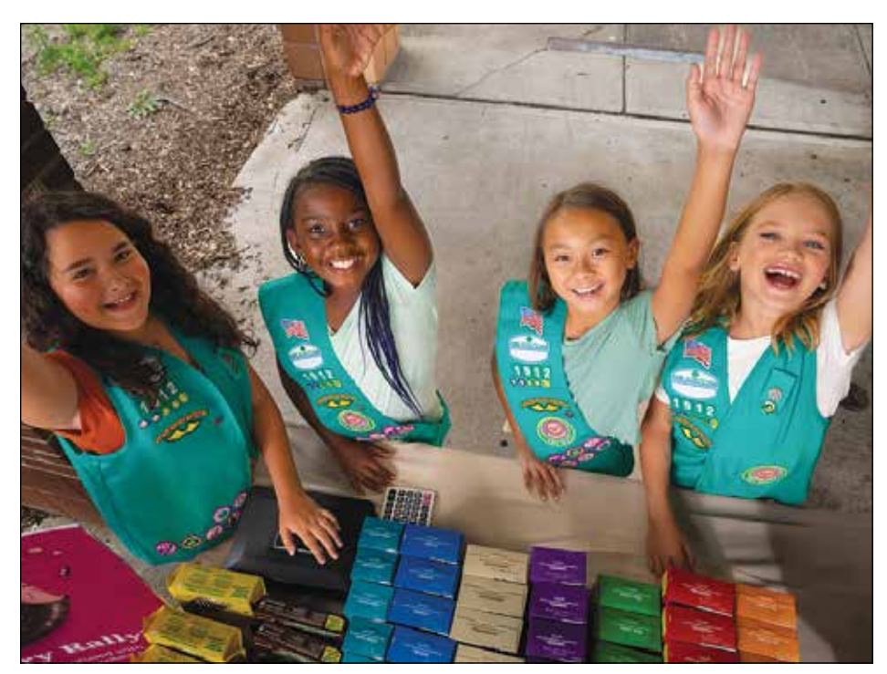
Residents will soon have an opportunity to help Girl Scouts while also enjoying their favorite cookie favorites.