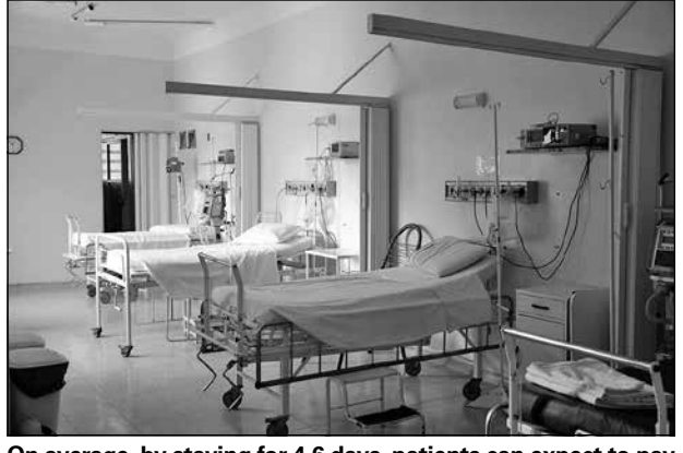
On average, by staying for 4.6 days, patients can expect to pay an astronomical $18,441, equating to just over $4,000 daily.

Oregon is the second most expensive state for a hospital stay. It's a top visitor location known for its diverse landscape, scenic forests, and beautiful lakes. However, when it comes to its healthcare, Oregon is one of the most expensive states in the US, averaging around $18,336 to afford a typical 4.6-day hospital stay. There are plenty of hospitals in and around the state, including OHSU Hospital, which has been described as