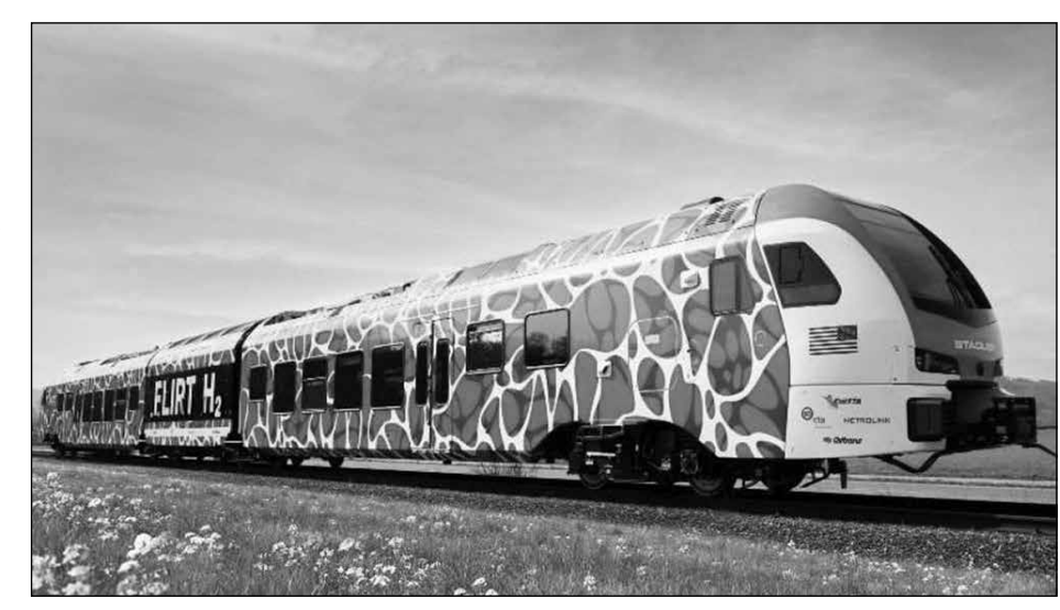
One of the new rail fleets travels through the countryside.

Latest Order Pushes Number of Zero-Emission Intercity Trainsets to 10