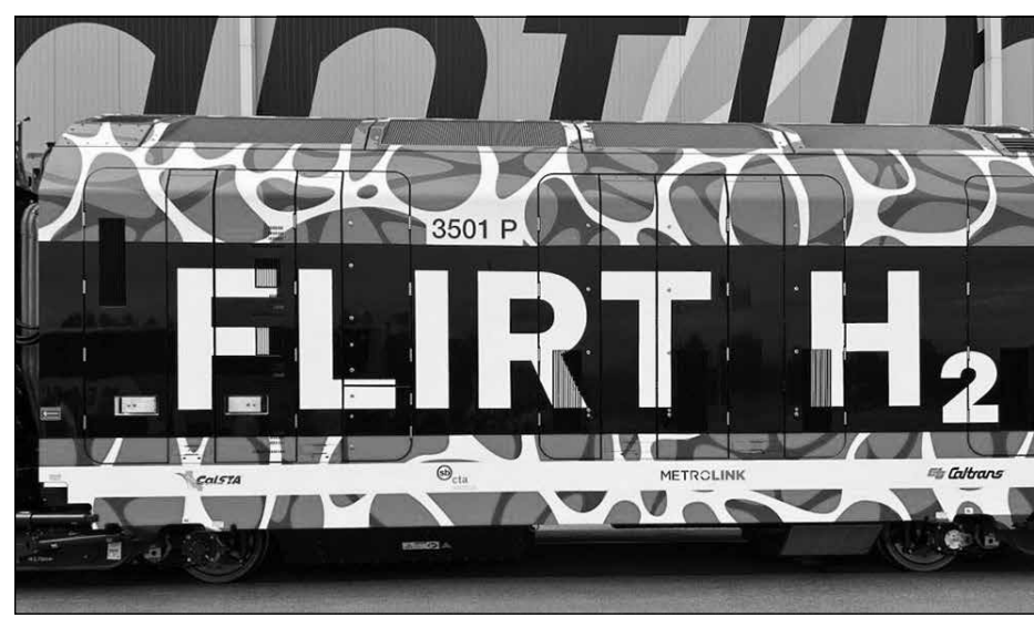
Here is a side of a rail fleet.

California continues to build momentum in its nation-leading effort to harness clean renewable hydrogen power, critical to cutting planet-warming pollution and expanding the clean energy economy statewide. Caltrans' purchase of the first four trainsets in October came one day before the U.S. Department of Energy announced California will receive up to $1.2 billion as one of the country's hydrogen hubs to accelerate the development