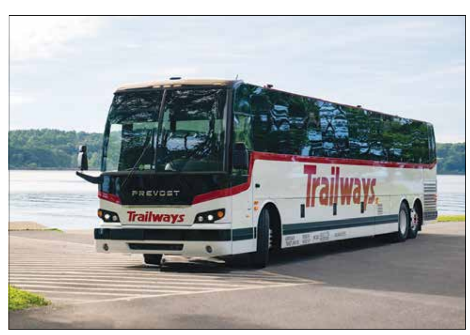
Trailways buses will soon be available in your area.

To Provide Customers More Travel Options