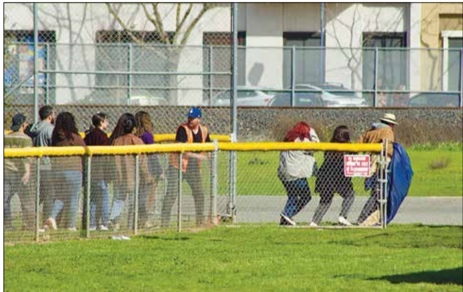
Extras rehearse running out of the Harvey Park baseball field into a semitruck.