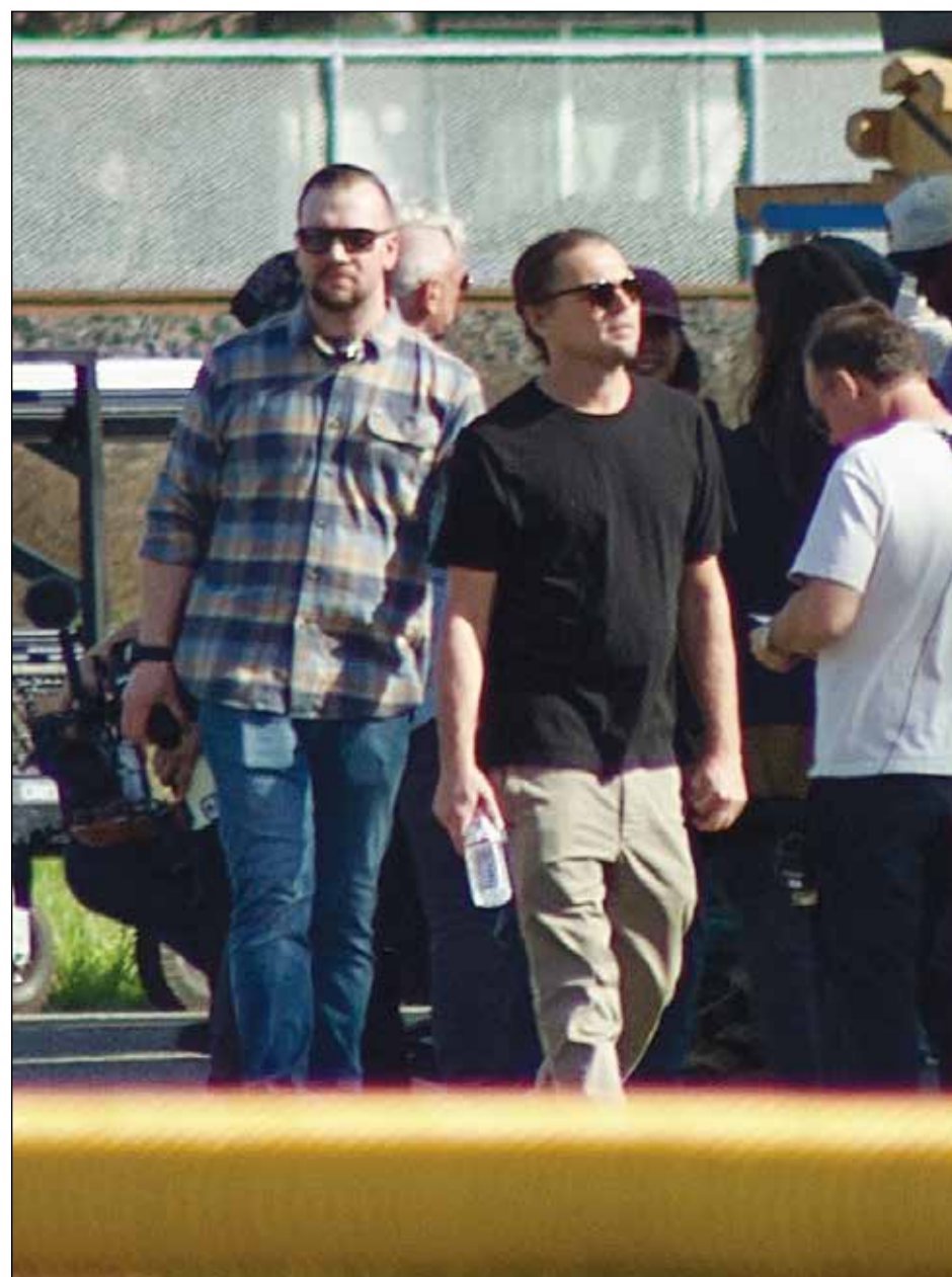
Leonardo DiCaprio is seen on Feb. 26 during rehearsals for a scene being filmed at Harvey Park. The secretive production is being directed by Paul Thomas Anderson.

Groups of curious onlookers gathered on the far side of the streets around Harvey Park, hoping to catch a glimpse of one of the celebrities or get some insight into the filmmaking process. Every person approached by the Elk Grove Citizen had learned of the shoot through social media posts. Continued on Page 2