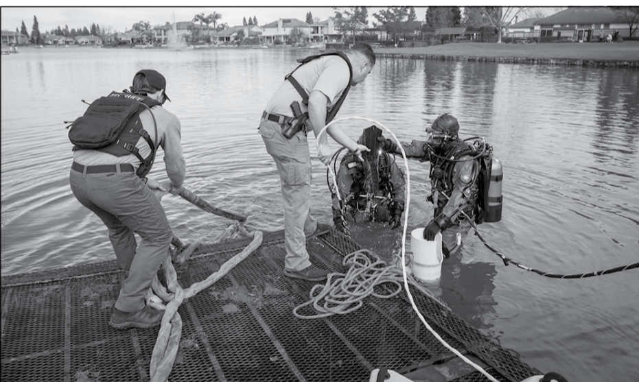
The Sacramento County Sheriff's Office dive team work at Stonelake on Feb. 15 after the discovery of a submerged car.

"We have zero tolerance for impaired driving and hold accountable those who jeopardize our community's safety," the police concluded. ★