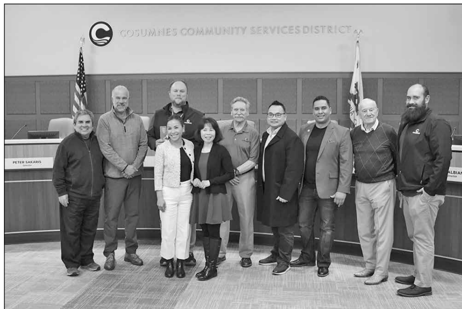
Members of the NorCal Vietnamese Chamber of Commerce and Vietnamese American Community of Sacramento pose for a photo with the Cosumnes Community Services board of directors.