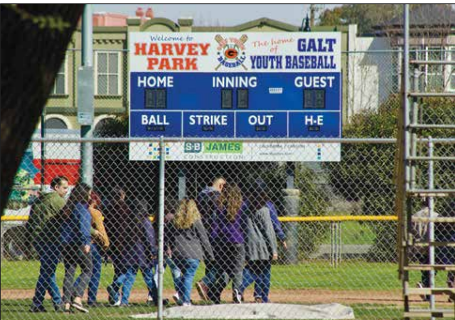
Extras walk across the Harvey Park baseball diamond during filming on Feb. 26.