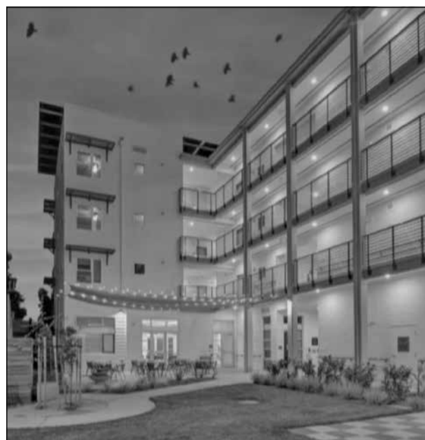
An image of Lavender Heights, a development by Mutual Housing California, that the company showed in its presenting its previous work to City Council.