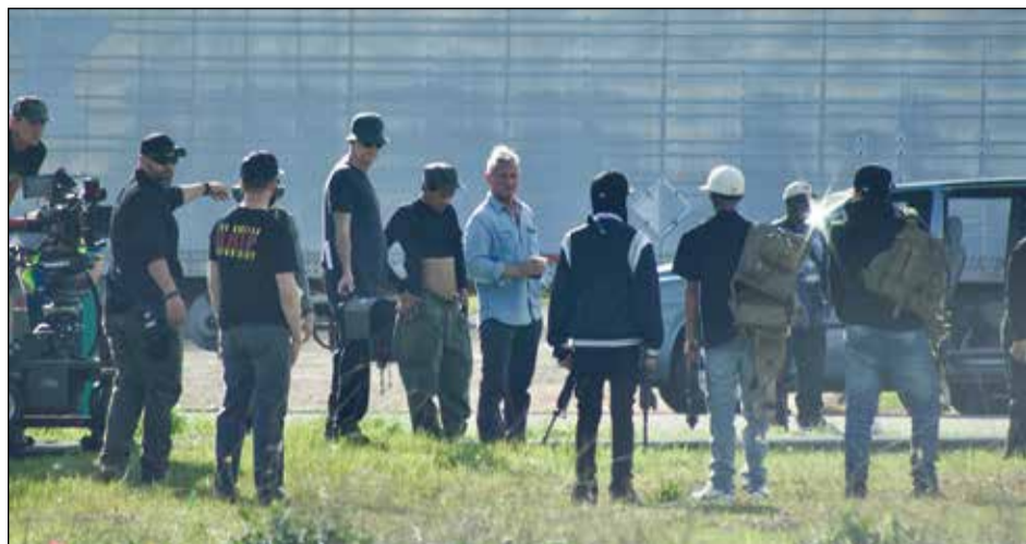
Actors Teyana Taylor and Sean Penn (both at center) wait between takes of a scene where Taylor leads Penn into a chain-link cage at gunpoint.