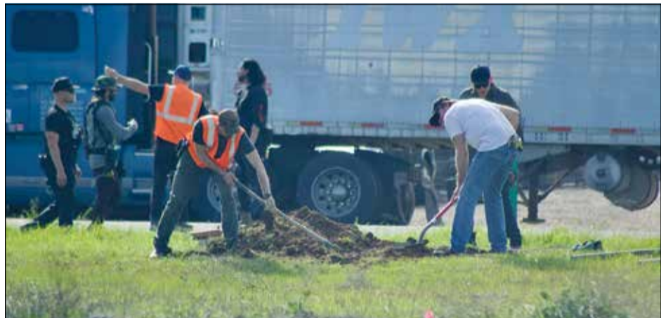
Film crews dig space near the Union Pacific railroad tracks to lay a camera dolly track.