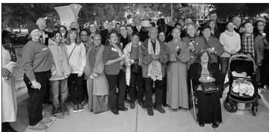
November 13, 2023 - 17 faith and religious congregations met at Elk Grove City Hall in a prayer vigil for peace sponsored by the Interfaith Council of Elk Grove.