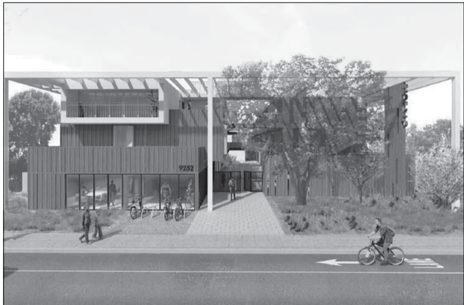
An illustration shows the rejected proposal for the Oak Rose Apartments in Old Town Elk Grove. Under a tentative settlement, the development will be moved to a different part of the city.

Litigation against the city filed by the State of California related to the Oak Rose Apartments Project remains pending and is not part of this settlement. City officials are hopeful, however, that this settlement with the private developer will also prompt a swift and reasonable resolution with the state. ★