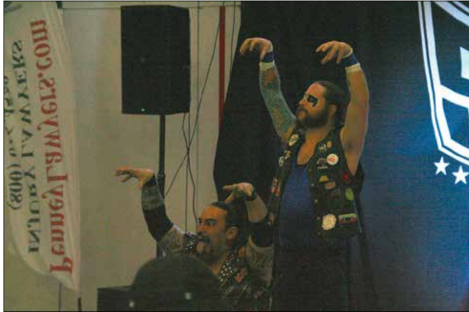
The "Rock 'N Rodeo Express" wrestling tag team make their entrance at the Supreme Pro Wrestling event on Feb. 18 in Elk Grove.