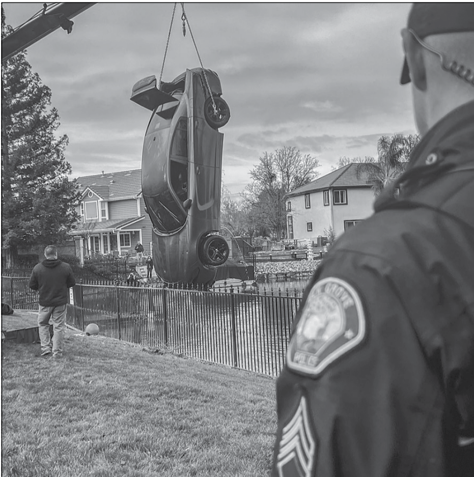
Law enforcement and a local towing company fish a car out of the water in the Stonelake neighborhood.