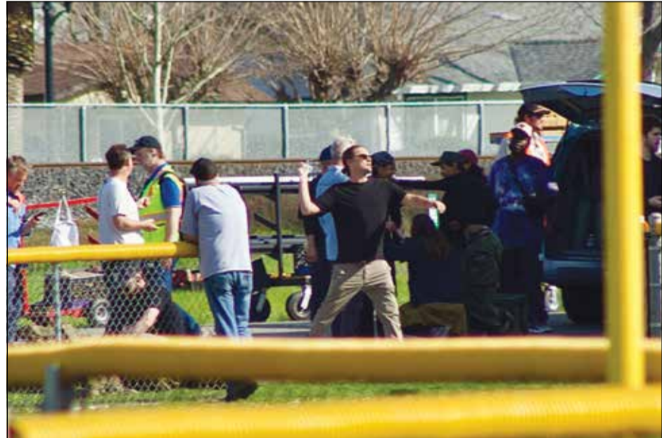
Leonardo DiCaprio practices throwing a water bottle in preparation for a scene.