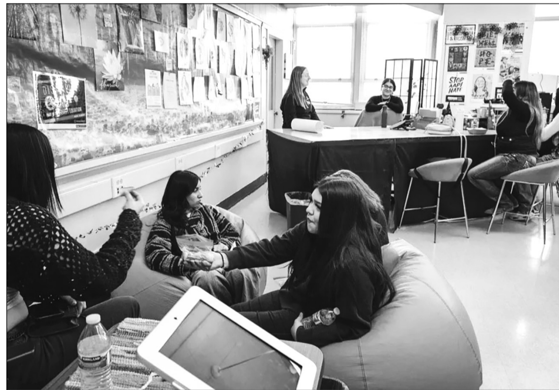
College Park High School students can visit the Wellness Center during school hours and after school to take a break and reset before returning to their activities in Pleasant Hill on March 15, 2024.