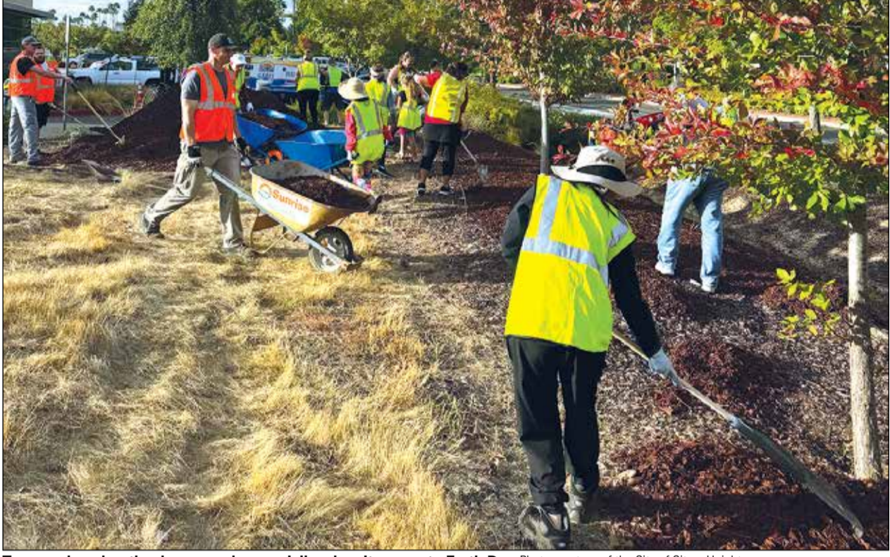
Teamwork makes the dream work, especially when it comes to Earth Day.