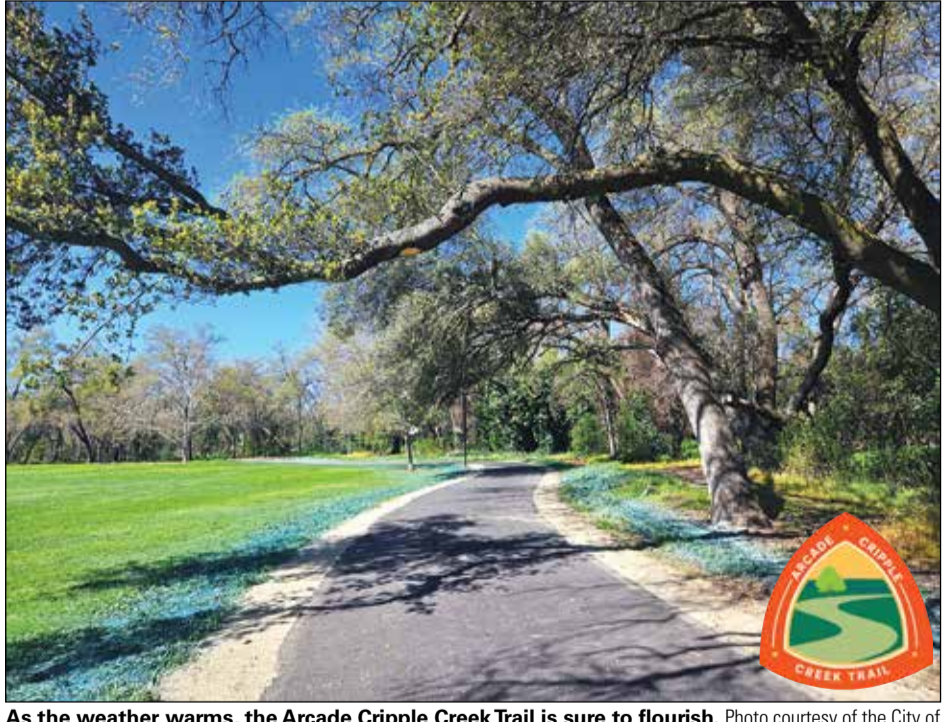
As the weather warms, the Arcade Cripple Creek Trail is sure to flourish.

Join city representatives and trail partners for a ribbon-cutting ceremony and community walk to kick off the grand opening at 9:30 a.m. May 5. There will be a short ceremony and ribbon-cutting presentation, and then all guests will be invited to walk 1.6 miles of the trail to the celebration at C-Bar-C Park. The walk is expected to take approximately 30 minutes. Guests can walk, bike or run the distance. A shuttle will be