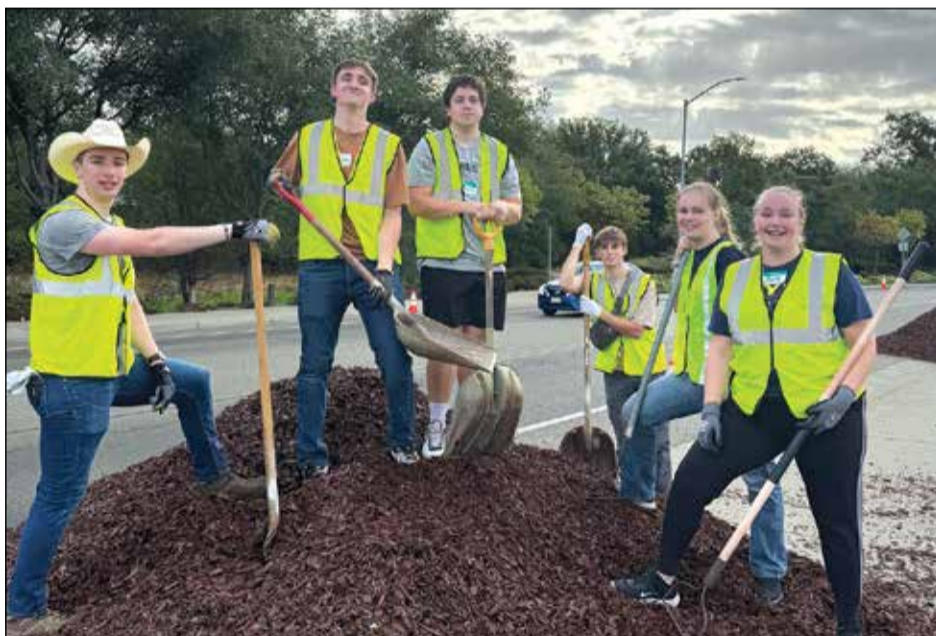
Young volunteers make a difference in October 2023.