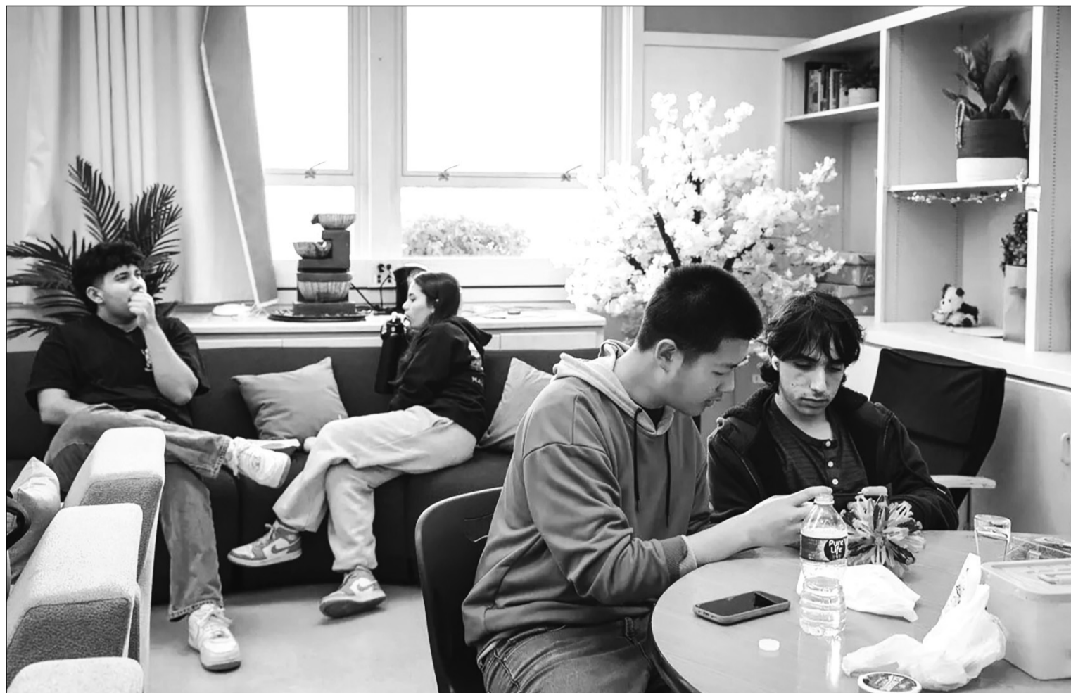
The Wellness Center at College Park High School is a place where students can find a quiet and relaxing environment without leaving school. Pleasant Hill, March 15, 2024.

big changes in California education: passage of Proposition 30, a sales tax which raised about $6 billion annually for schools; introduction of the Common Core reading and math curriculum; and the Smarter Balanced standardized testing system.