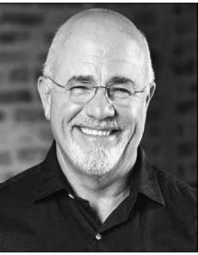
You're Playing with Fire

Sometimes we search for faith like we are playing scratch cards. We scratch at the deep questions of faith,