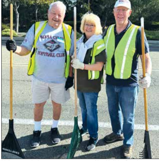
Volunteers help out at an event at City Hall in October 2023.

“Our community has a strong desire to give back to their city. By chipping-in and volunteering, residents not only help beautify the city but also connect with