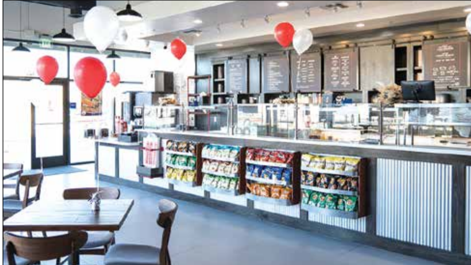
Here is how the West Coast Sourdough interior is expected to look.