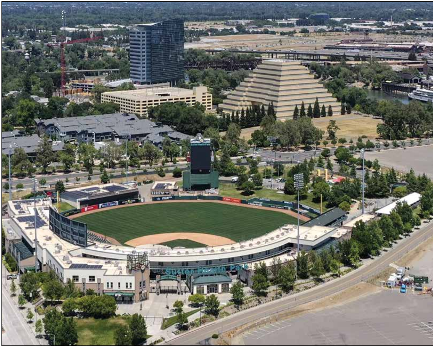
Here is the Sutter Health Park entrance, which will welcome thousands of Oakland A's fans now that the Major League Baseball team will call West Sacramento home temporarily.