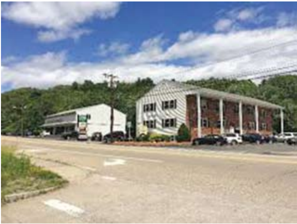
Businesses at Drury Square in Auburn.

This is a project that has been years in the making and will bring many improvements to the Drury Square area of Auburn. These improvements include better traffic flow, pocket parks, bicycle accommodations, new sidewalks, new street lighting and landscaping, walking paths, a gazebo and a new tree that will be used for the town's annual holiday tree-