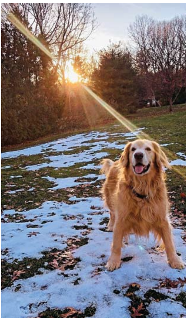
Bright skies ahead for Lincoln.