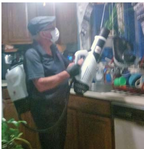
Protecting the inside of a home against germs.