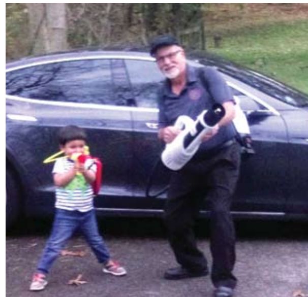
Who ya gonna call?... GermBusters!

If personnel or family with COVID cases have been present, GermBusters will follow all state guidelines in sanitizing that location. Service contracts are also offered to take the burden away from businesses who are concerned with ongoing sanitary procedures. "When we service our customer locations, they can rest assured that they've done everything to protect their personnel and customers. People are dying in hospitals alone because their