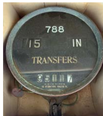
The Samuel Slater Experience received a permanent loan from the Webster Dudley Historical Society recently - a trolley register from the original Webster & Dudley Street Railway.