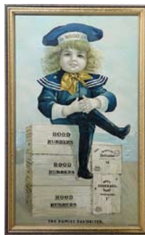
Some advertising collectibles are bargains. This picture was the top of an 1898 calendar probably given to customers who bought the Hood company rubber boots. The framed picture cost only $74 plus a 10% buyer's premium.