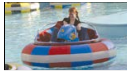
Bumper boats, zip line and go-karts are just a few of the great attractions.

They can accommodate school, team, scout and camp groups. For company outings there are lots of options and they now offer birthday parties under a new format.