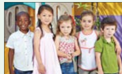
Horizon Learning Centers Page 7