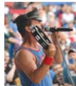
Queen Nation, 2019

June 8: Tricky Dick and the Coverups – Dance & Party Music June 15: Nightrain: The Guns N' Roses Experience – Guns N' Roses Tribute June 22: Trippin' Billies – Dave Matthews Band Tribute June 29: Cracker – National Recording Artist July 6: Hollywood Nights – Bob Seger Tribute July 13: KICK – INXS Tribute July 20: Lita Ford – National Recording Artist July 27: No Duh – No Doubt Tribute August 3: Ultimate Aldean – Jason Aldean Tribute August 10: Uptown Funk – Bruno Mars Tribute August 17: The Ten Band – Pearl Jam Tribute August 24: Queen Nation – Queen Tribute August 31: E5C4P3 – Journey Tribute