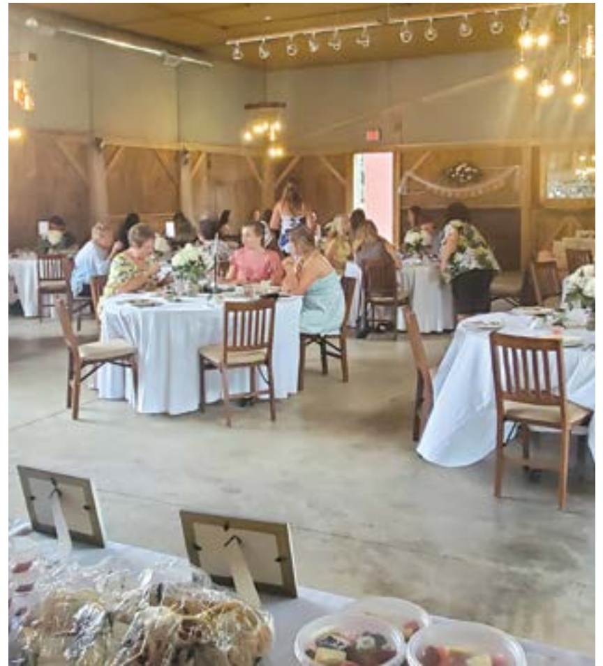
The newly renovated event barn at the Lake County History Center is the perfect place to celebrate your special occasion.

Kapostasy is especially excited to bring the United States Air Force Band of Flight, Flight One ensemble to the museum on Sunday, June 27 at 6 pm. "It will be their first time here so we're really looking forward to it. It's a great musical event for families and it's free." She emphasizes that you must RSVP to keep within the capacity limits as they are still honoring CDC rules for safe distancing.