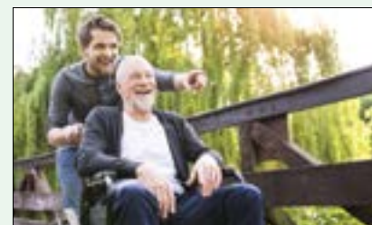
Western Reserve Area Agency on Aging Page 6