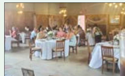
Lake History Center Page 4