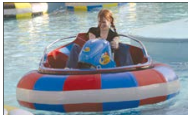
Bumper boats, zip line, go-karts, rock walls, and mini golf are just a few of the great attractions you can enjoy.

Come say hello, join in the fun and check out all the details and pricing at www.AdventureZoneFun.com .