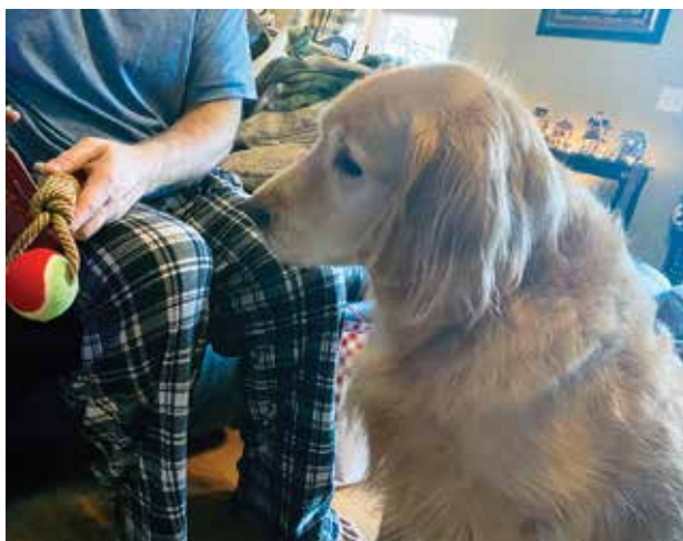
A gift for Lincoln