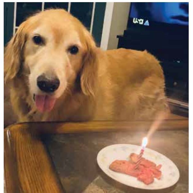
Celebrating Lincoln's 10th birthday - Dec. 26, 2020

On Lincoln's passing, one of our veterinarian's said it perfectly. "He was good until he wasn't." Lincoln found joy in every single activity until he couldn't any longer. He wanted to play ball in the snow on the very last day of his life, and suffered for only a few hours. I look at a picture of the two of us on his last day. I'm holding up his