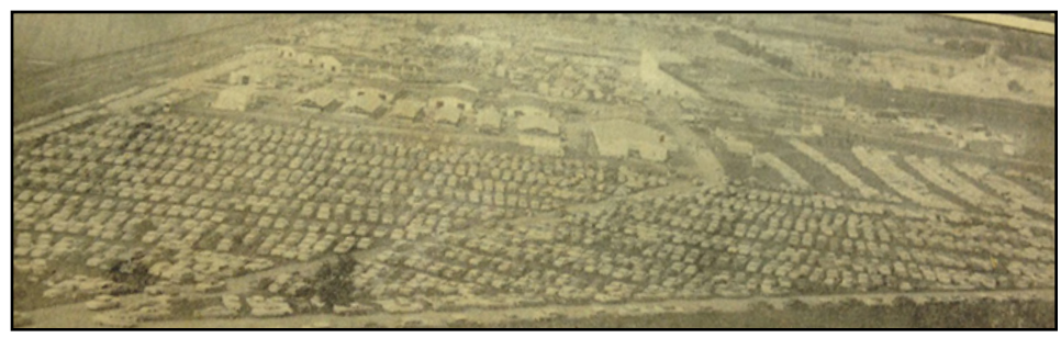
1959 Aerial View of the Sioux Empire Fair

The Sioux Empire Fair is ready to "Dazzle and Delight" patrons during it's Diamond Jubilee. This year we are proud to showcase all free concerts and rodeo with paid fair admission, a new Pipestone Discovery Barn, and traditional fair contests. We hope you come join the fun August 1 - 10 and leave with cherished memories.