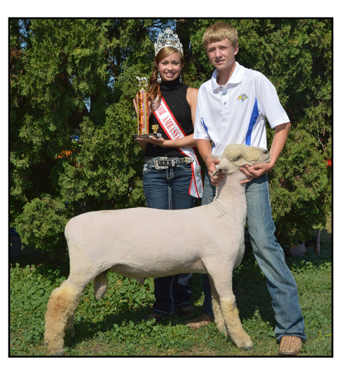
4-H Sheep Show