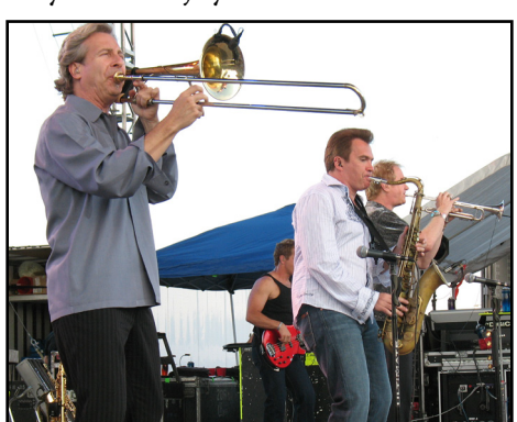
Chicago in the Grandstand, 2008

for the first time, rocking out to your favorite artist, riding the ferris wheel with your first boyfriend, performing on the Front Porch, or eating cheese curds you've waited all year to enjoy.