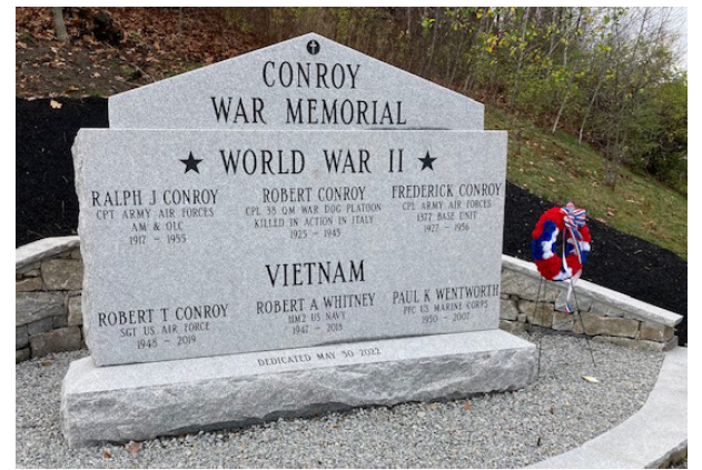
The names of Conroy family members who served in World War II and Vietnam are etched in this handsome monument in Auburn. The Conroy War Memorial was dedicated last month.