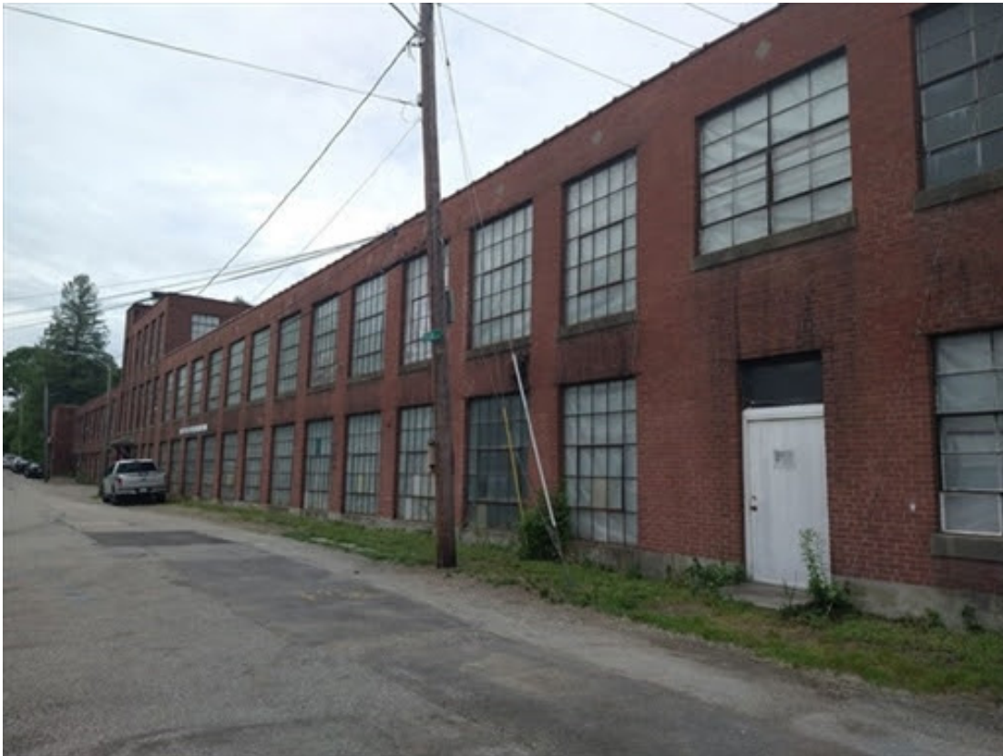
The former Anglo Fabrics buildings in Webster are soon to become the focus on a major redevelopment project.