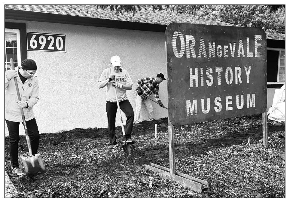
OV History Project volunteers are working hard to get ready for the grand opening July 15th!