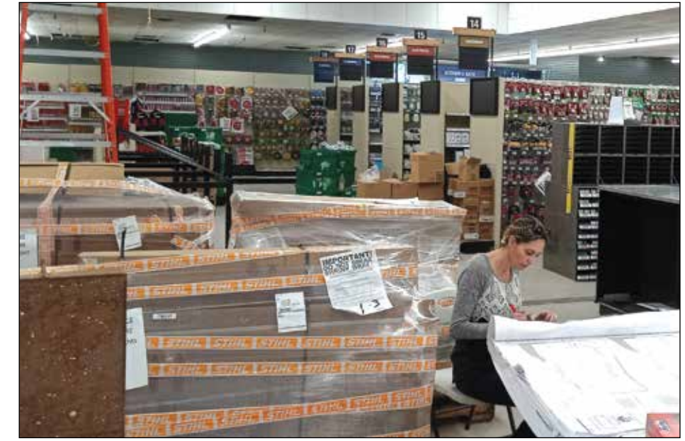
The interior aisles of the new Citrus Heights Miller's Ace Hardware.