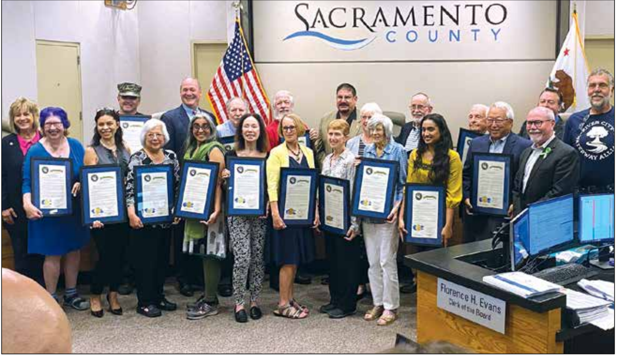
The 5 Over 50 Award recognizes volunteers in the County who are over the age of 50.