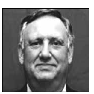
By Dan Walters, CALMatters.org

When Gov. Gavin Newsom proposed a 2023-24 budget in January, he acknowledged that the revenue estimates made six months earlier were way too optimistic and that the state had evolved from a nearly $100 billion surplus to a $22.5 billion deficit.