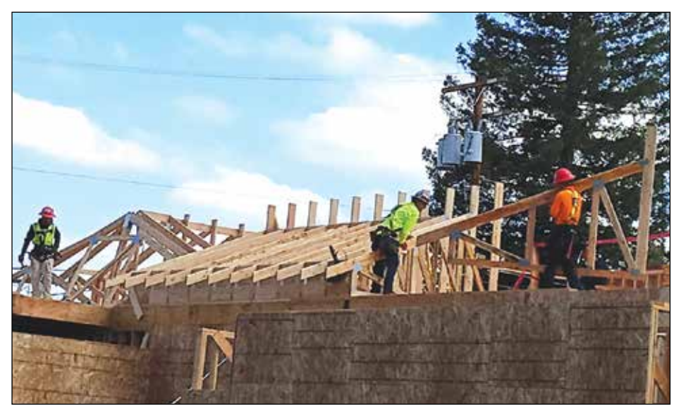
Bobo Construction workers set the trusses for the FORPD Measure J bond-funded construction project.