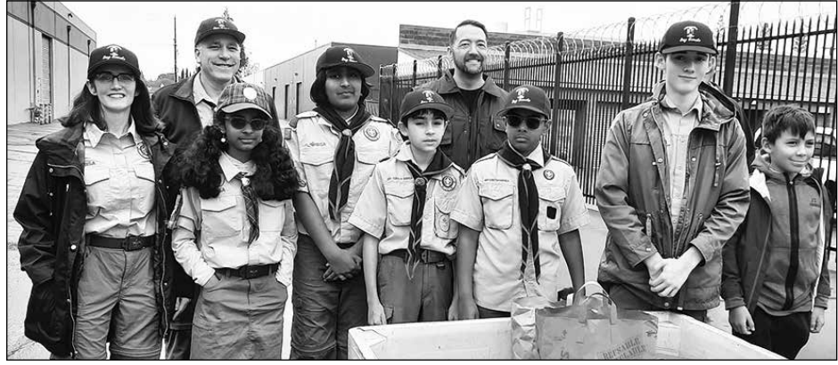
The Golden Empire Council of the Scouts of America collected food for local foodbanks during their "Scouting for Food" drive on March 11, 2023.