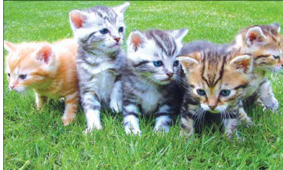
The Bradshaw Shelter's Foster Care Program helps save lives and space during this hectic season.