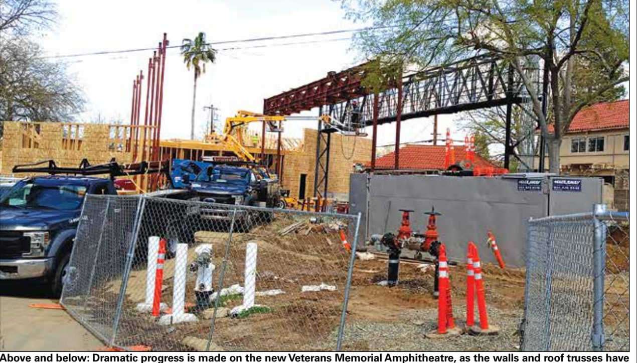
Above and below: Dramatic progress is made on the new Veterans Memorial Amphitheatre, as the walls and roof trusses have gone up, allowing Village visitors to see the building take shape before their eyes.