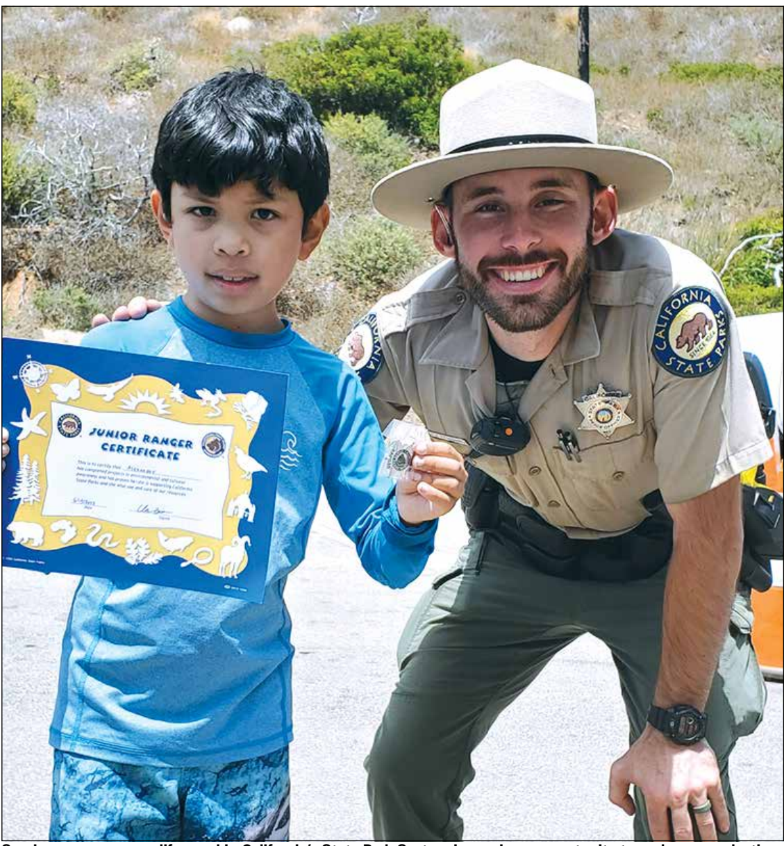
Serving as a ranger or lifeguard in California's State Park System is a unique opportunity to make an everlasting impact on the state's natural landscapes and the millions of people who visit them.

The entire selection process for becoming a ranger or lifeguard takes approximately 15 months. The first step in the selection/examination process is to mail, email or hand deliver an application during the open application period. The application is used to determine if the candidate meets the minimum qualifications for admission into the examination, which consists of the Peace Officer Standards and Training (POST) Entry Level Law Enforcement Test Battery written exam. This exam is used to admit the candidate into the next phases of the selection