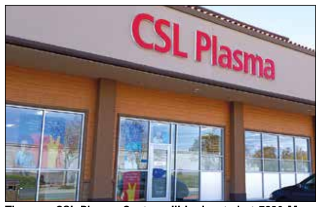
The new CSL Plasma Center will be located at 7830 Macy Plaza across the street from Target in Citrus Heights.