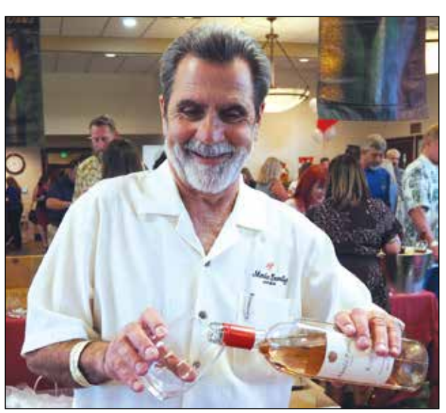
Get a taste of all the best Fair Oaks has to offer next month at North Ridge Country Club.

Guests can also participate in a golf putting contest with a chance to win a $5,000 grand prize, a silent auction, mystery wine wall, key contest,