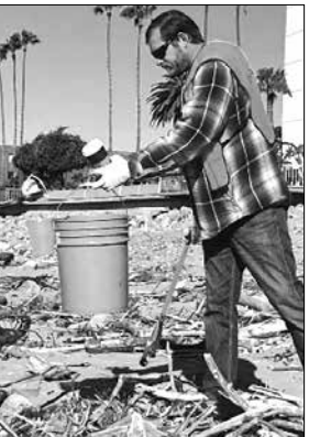
Volunteers pick up trash along the beach at a Clean California Community Days event in the City of Ventura on March 25.

More than 10,500 wvolunteers participated in