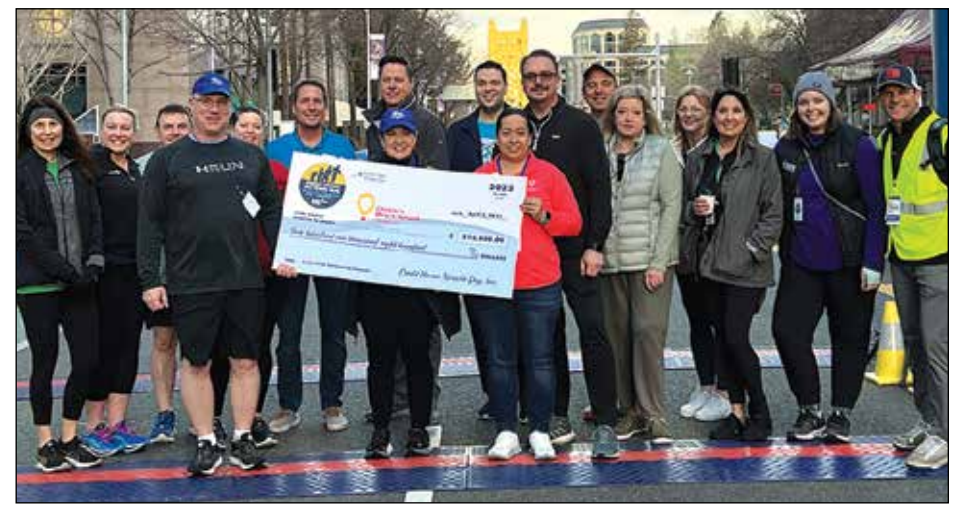
The Annual Credit Union SACTOWN Run held on Sunday, April 2, 2023, raised over $210,800 for Children's Miracle Network Hospitals (CMN) and included 69 credit unions and 1,800 runners.