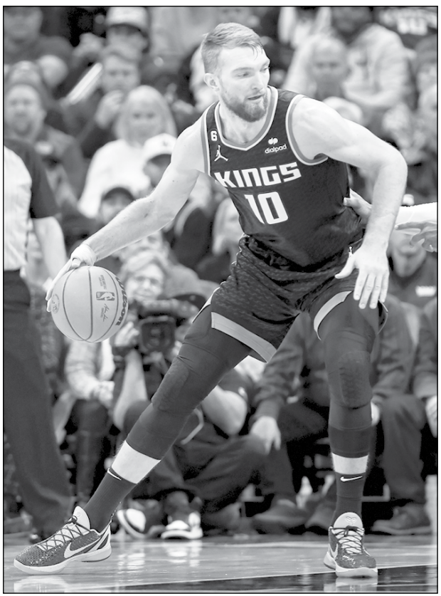
On Friday, April 7, 2023, Sacramento Kings player Domantas Sabonis was recognized with this year's Community Crossover Award presented by Kaiser Permanente.