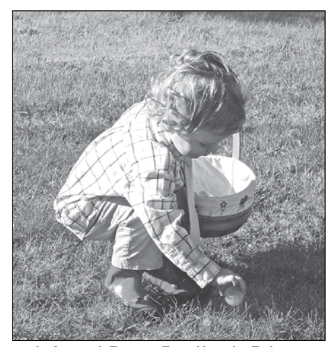
15th Annual Easter Egg Hunt! Enjoy arts and crafts, silly songs, story time, goodies to eat and lots of Easter Eggs to hunt!