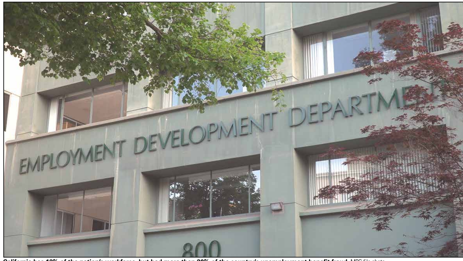
California has 12% of the nation's workforce, but had more than 20% of the country's unemployment benefit fraud.

While the EDD has claimed it did the best it could, it should be noted that the EDD – even though it could have purchased basic fraud protection software that would even work with its antiquated IT systems for about $5 million- had no way to prove if an applicant was who they said they were until the end of 2020,