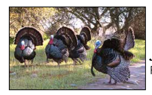
Grant Good News for Nature Center PAGE 2