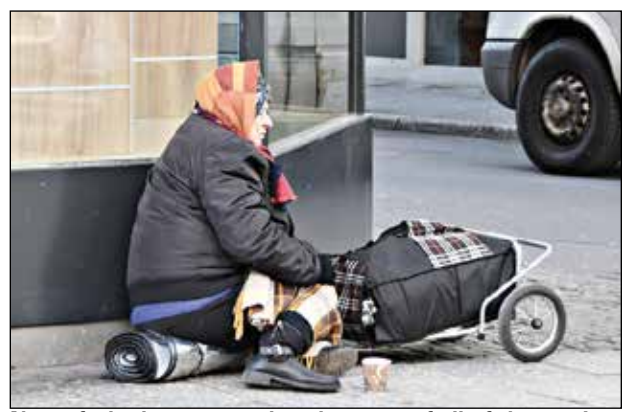
Never feel reluctant to take advantage of all of the services that can support you so you can stand on your own two feet.

guided-search/ for information on over 1,600 services through the Sacramento Community Resource Directory. When you call, a caring specialist at Sacramento 211 will do a holistic evaluation of your situation and provide internal referrals to the agencies and organizations that are able to fulfill your immediate needs, whether to prevent homelessness or aid you while you are experiencing it. Your case management could involve: eviction prevention, housing subsidies, shelter, medical care, legal, elderly, veteran, financial assistance, transportation, food,