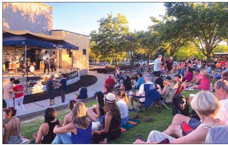
The Orangevale Farmers Market begins its season on May 4 and runs through October 26 every Thursday at the community center off Hazel Avenue.