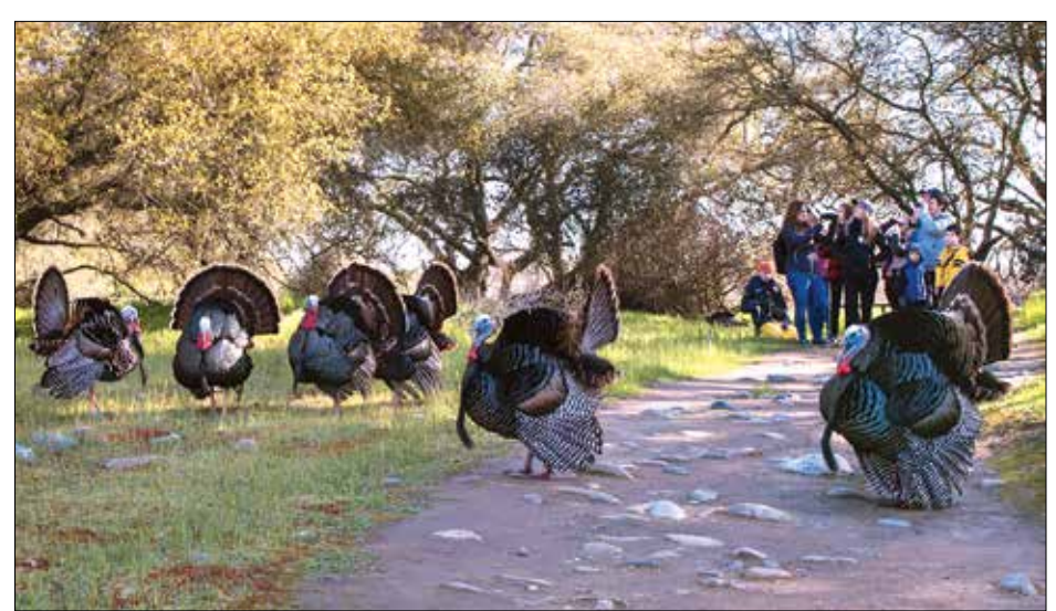
Wild turkey parade for last week's Bird and Breakfast safari at the Effie Yeaw Nature Center.