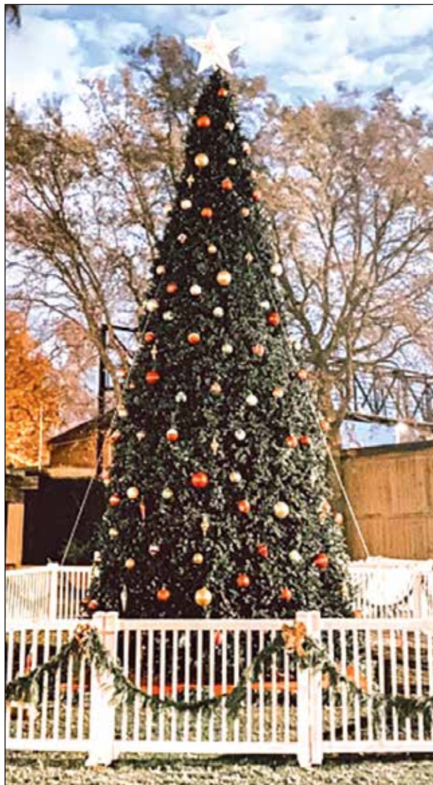
The annual Fair Oaks Christmas Tree Lighting is usually held in Plaza Park in the Village, but due to construction, the celebration will take place at Fair Oaks Park this year.

The Breakfast with Santa event will be held at the Orangevale Fair Oaks Grange on December 12,