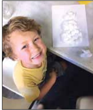
Register by December 16 to get a spot for your child in FORPD's Winter Break Camp where they will participate in winter-themed crafts, games, and activities.

and virtual crafting events for kids will be hosted on December 14 and December 28. For $5, you can get photos of your kid with Santa at Fair Oaks Park on December 15.