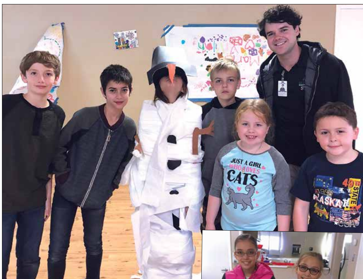
Above: Kids will enjoy a variety of fun activities at the Winter Break Camp, offered at McMillan Center by the FORPD. Right: Kids aged 6-11 can sign up for the Sweets & Treats Class at McMillan Center on December 9, where they will create delicious holiday treats.