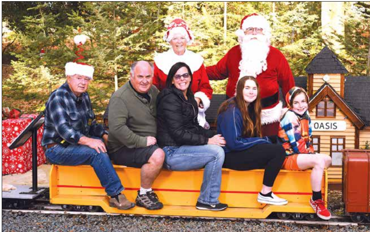
Personal keepsake photographs taken with Santa Claus are free, where they can later be viewed and downloaded.