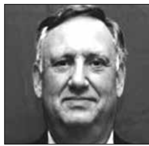
By Dan Walters CALMatters

The long-simmering conflict between state officials and local governments over housing construction – or the lack thereof – escalated this month and may be headed for a showdown at the polls next year.