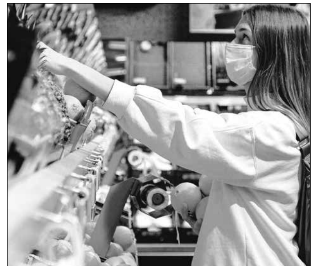
More people live in poverty in California than in any other state because of our high and rising costs of living.

California's cost-adjusted poverty rate (2018-2020 average) was 15.4 percent, while 16.5 percent of all Americans living in poverty live in California. Rates among the other states ranged from 5.9 percent in Minnesota to 14.5 percent in Mississippi (16.5 percent in DC), with the US average at 11.2 percent