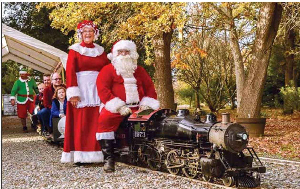
The public is welcome to ride with Santa and Mrs. Claus on the annual Santa train at Hagan Community Park in Rancho Cordova.

gives youngsters a close-up view of scale model operating engines and passenger cars as they patiently wait to board each passenger train.