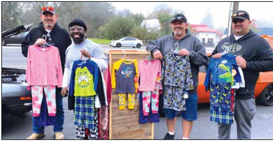
The 3rd annual Pajama Drive and Car Show is proud to report it collected more than 550 pairs of new pajamas. The pajamas will be distributed by our partner in this event, About Kidz, to insure delivery of these new pajamas.