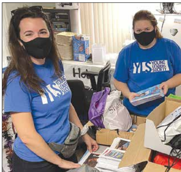
United Way California Capital Region volunteers collect items for a nonprofit partner in fall 2021. The group is asking residents to support its United We Shine campaign by supporting its local nonprofit partners.

“We are proud of the work we do at United Way to bring nonprofits together to work toward equitable systems and reduce poverty so all families in our