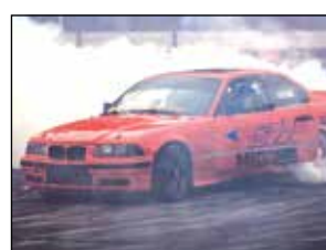
CHP Valley Division continues to experience an increase in illegal street racing, sideshows, and drifting activities, often with fatal results.