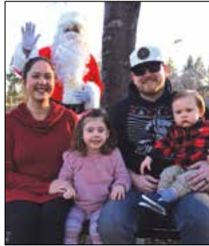
Register soon to take photos of your child with Santa at Fair Oaks Park on December 15. The cost is $5, and space is limited.