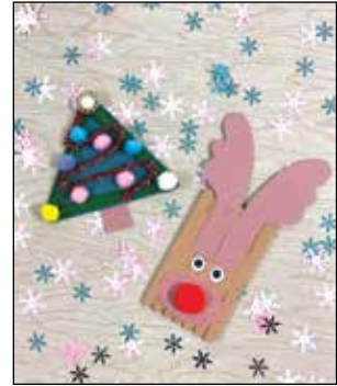
You can participate in virtual handcrafting without large gatherings.

Join the Paint and Sip Holiday Paint Party at Liquid Therapy Bar on December 19 for $35. Submit holiday photos by December 21 for a chance to win a FORPD swag bag. On December 22, you can join a morning Holiday Zumba Class at the Community Clubhouse and visit the Fair Oaks Coffee House & Deli that evening for a Holiday Cheer event featuring coffee, cookies, holiday music, and photos with Santa. ★