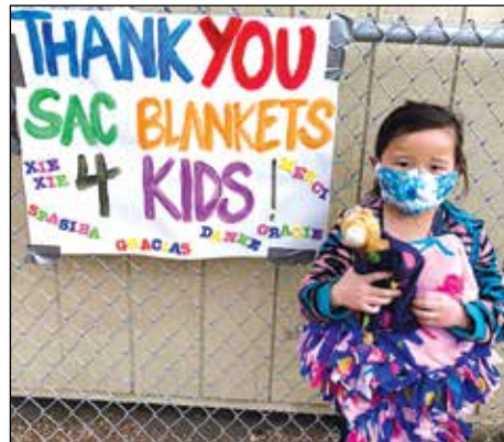
Kindergarten kids can stay warm this winter with a blanket and a Beanie Baby.

If you have a Beanie Baby or have a huge