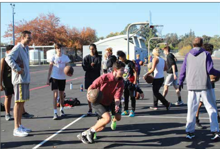
Kids from 4th to 12th grade are invited to Clutch City Academy's Hoop to Feed the Hungry basketball camp this Thanksgiving break.