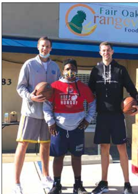
Clutch City Academy hosts this camp at Casa Roble High School during the school break to train the next generation of athletes.

Hoop to Feed the Hungry is an incredible opportunity for local youth during their Thanksgiving break from school