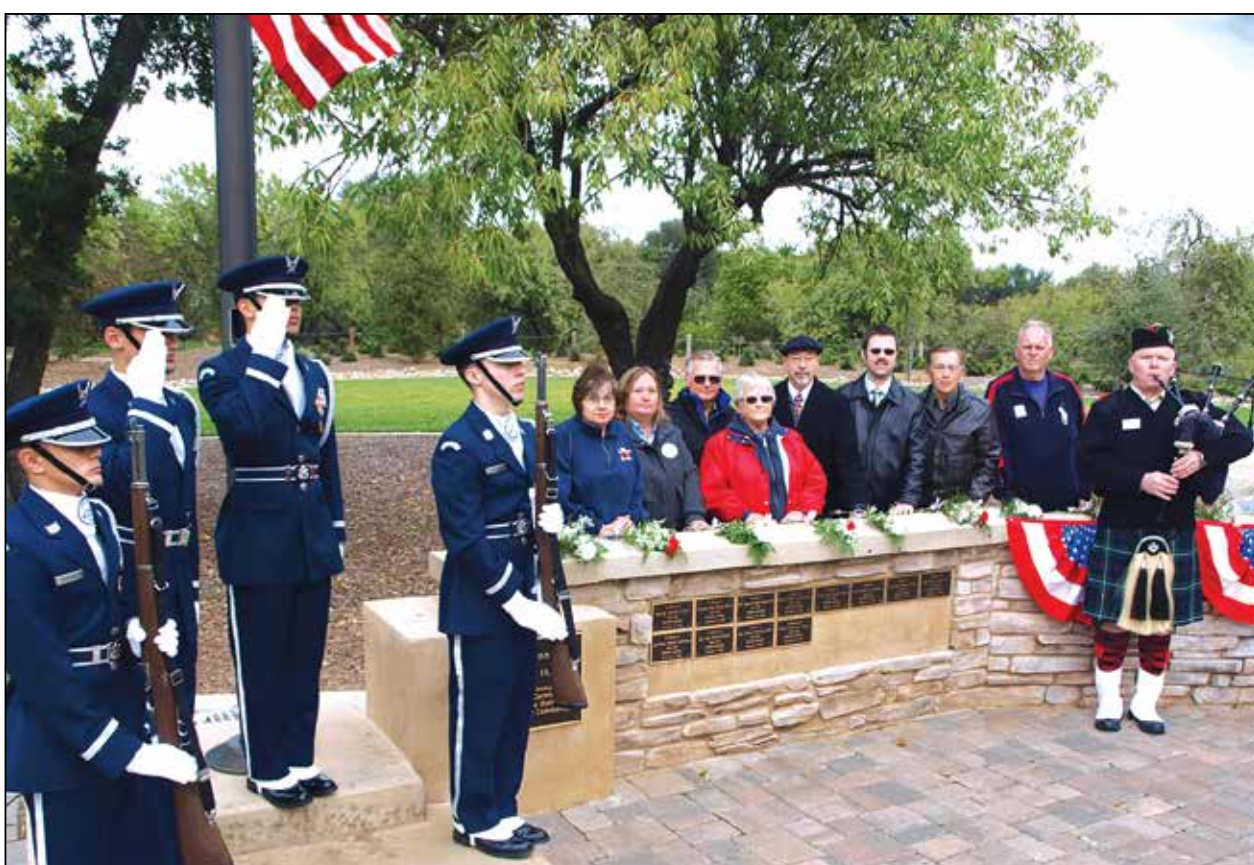
Patriots Park's Wall of Honor recalls heroes who died in service to community and nation during the history of Carmichael Park District. The reserve is located on the Carmichael and Fair Oaks border at 6827 Palm Avenue.