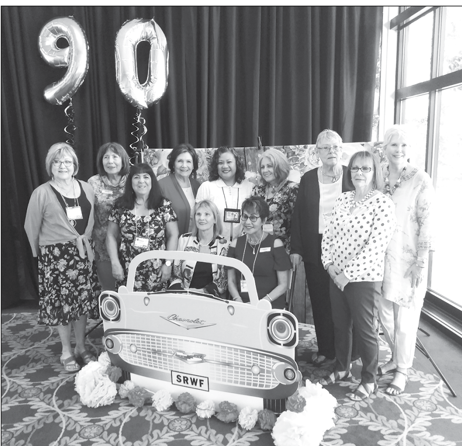
Members of SRWF join in the fun at their 90th anniversary celebration.