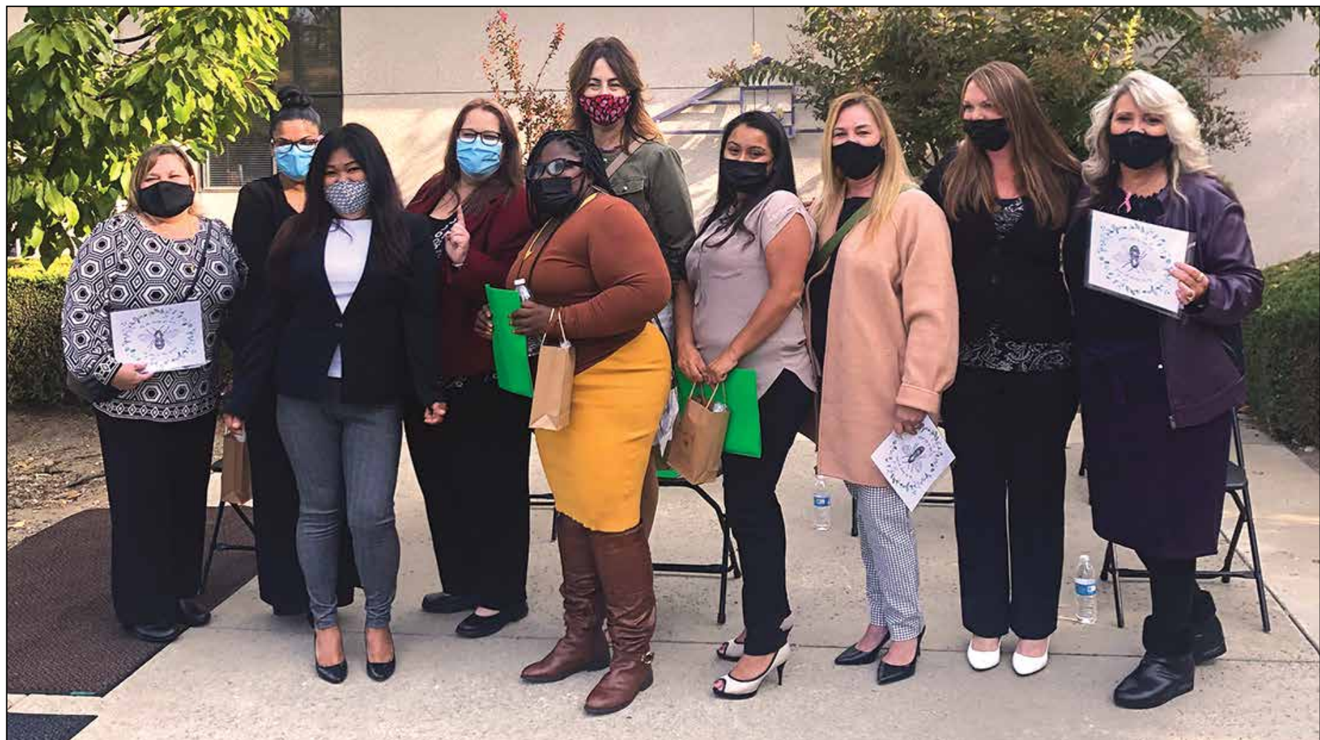
Graduates of Women's Empowerment's first Banking Academy, a paid training program to become bank tellers, celebrate their graduation in October.