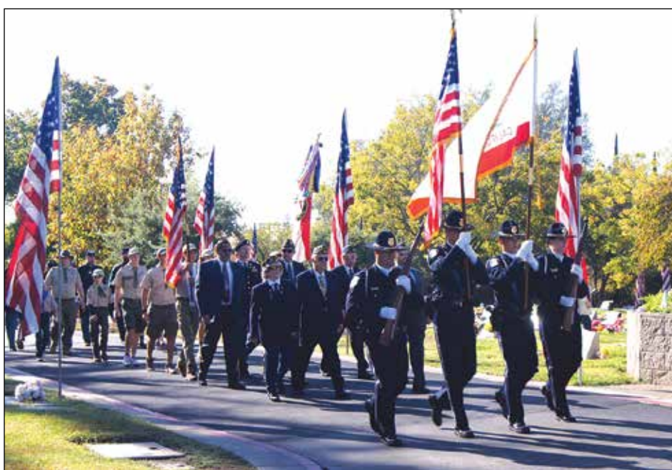
Sylvan Cemetery is planning a normal Veterans Day ceremony, including a march.