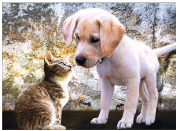
Being prepared is the best step families can take to ensure people, and their pets, are ready to face an emergency together.

(1) Ensure your pet can be identified by both a microchip and collar ID tag and that contact information is up-to-date; (2)