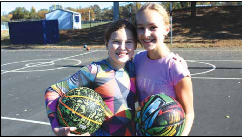
Hoop to Feed the Hungry is an annual sports event which encourages the Attitude of Gratitude.