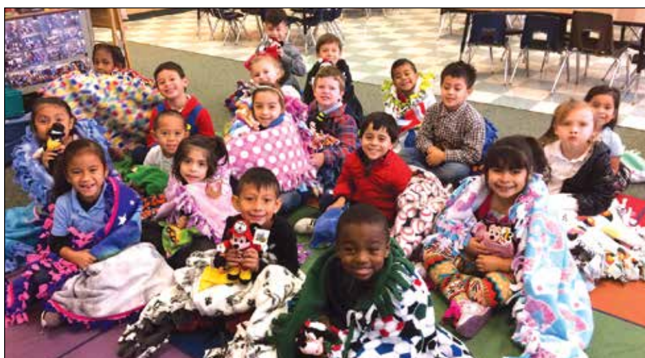
SBSK delivers a double-fleece blanket and a Beanie Baby in a fleece pouch to EVERY kindergartener in the last week of school before winter break.