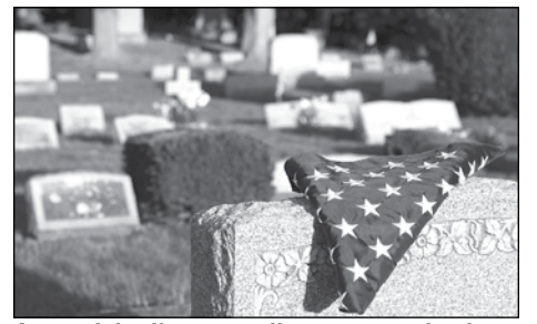
A special tribute to all veterans who have placed their lives on the line to keep our democracy viable.

Thank God my First Lieutenant returned to me with no injuries on the outside, but what about the inside? We never really talked about all that went on for quite a few years. I felt he would share when he was ready. Perhaps it was better that he was a little older...about 24...and he took on the job of looking after some of the