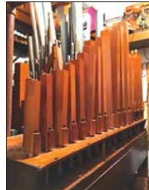
The committee seeks to enlarge the Community Clubhouse and remove the complex instrument with its array of pipes, bells, whistles and percussion.

Most residents have never heard this remarkable wind-driven instrument and its