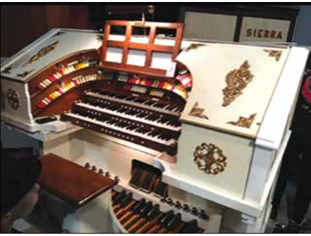
The American Theater Organ Society, Sierra Branch, owns and maintains the wind-driven instrument initially built for a theater to accompany silent films.