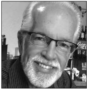
Commentary by Bruce Lee

Are you aware of the half-cent sales tax increase proposed for Sacramento County on the November ballot to raise $8.4 billion over the next forty years for transportation purposes? It would make the county-wide tax a whopping 9.25% - higher than 88 percent of all counties nationally!