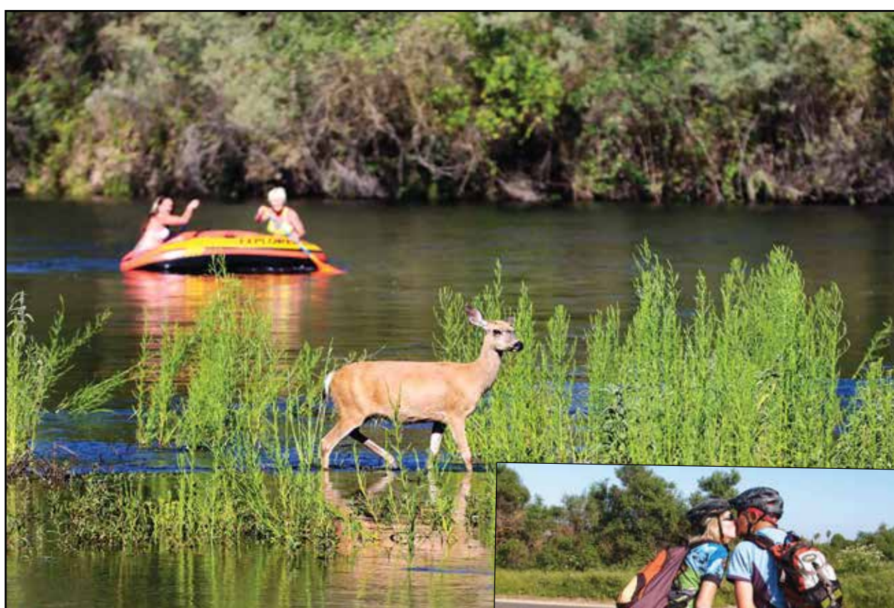
Above: The American River Parkway's scenic environment provides rich opportunities for Sacramento area wildlife and residents. Right: Sacramento County is seeking input from visitors to plan parkway enhancements.