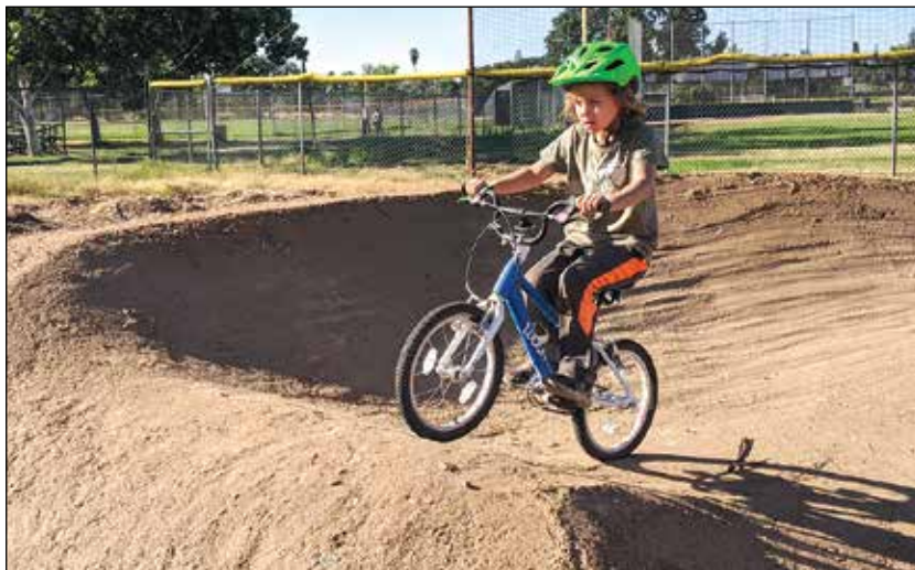
The Fair Oaks Bike Park at Phoenix Park is open 7 days a week from dawn to dusk. Don't forget your helmet!

The next project under Measure J Bond jurisdiction, Swallow Way Park, has construction starting in October 2020. It is budgeted at $833,736. Funding of Swallow Way Park is divided among various