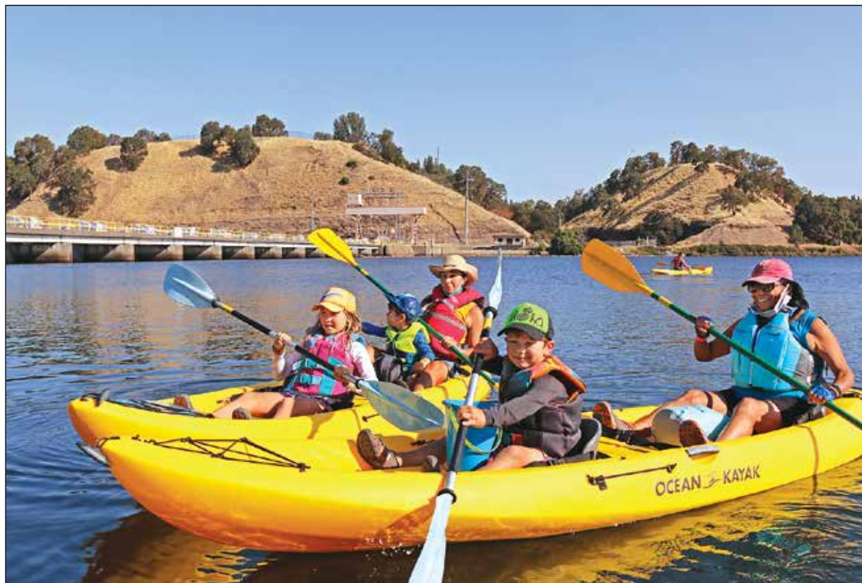
Water sport fans can now push off from the Aquatic Center on Lake Natoma.