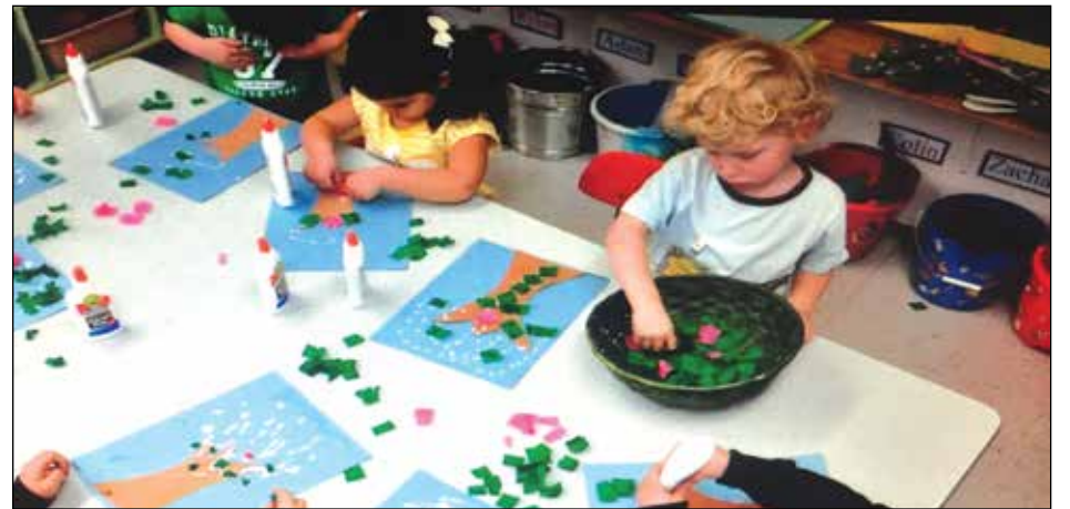
Preschool children get to work with other toddlers, getting hands-on experience in a variety of fun projects.