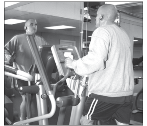
The California Fitness Alliance (CFA) announced that since reopening on June 12, its members have reported no cases of COVID-19 traced to California fitness centers.

SACRAMENTO, CA (MPG) - The California Fitness Alliance (CFA) announced that since reopening on June 12, its members have reported no cases of COVID-19 traced to California fitness centers including health clubs, gyms or studios. CFA surveyed 150 fitness operators, representing 785 locations in California, to demonstrate the implementation of its guidelines and superior safety standards have kept its communities safe while providing an essential service to its members and vital jobs to its employees.