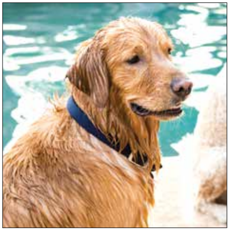
Always supervise pets when swimming either in a pool or in waterways.