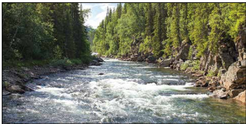
California's snowpack will be melting faster, potentially filling rivers and streams with dangerously cold and swift moving water.

By Paul Moreno, Pacific Gas and Electric