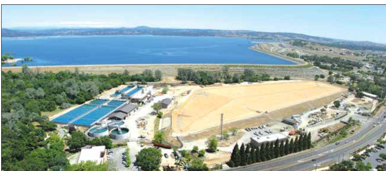
An aerial view of Hinkle Reservoir near Folsom Lake shows San Juan Water District's water treatment plant in Granite Bay, CA.