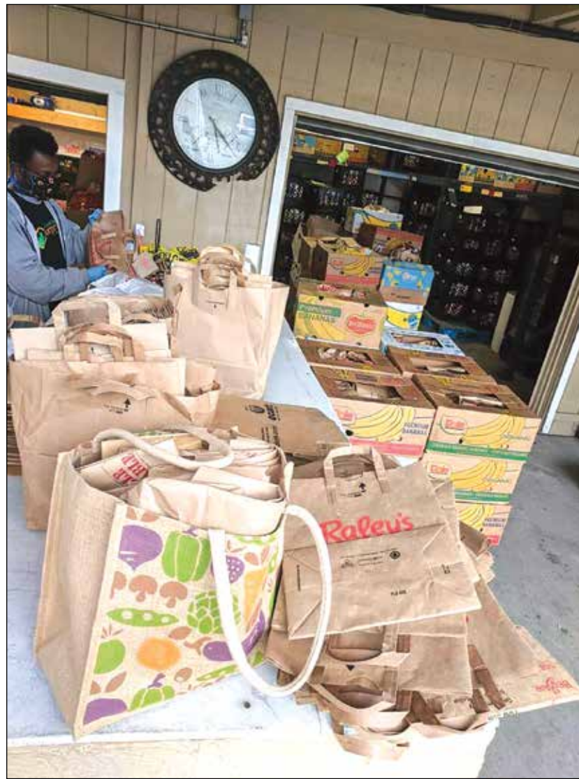
Orangevale/Fair Oaks Food Bank puts those brown paper bags to good use.

Keith adds, “We’ve made the decision to serve anyone in Sacramento County, once weekly for the duration of the outbreak. In addition to the increase in food we’re distributing, we’ve seen an