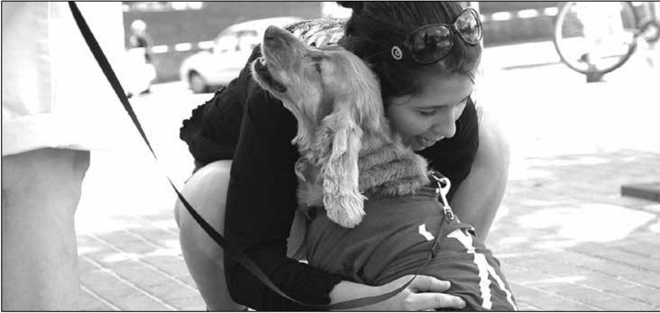
All BARC dogs wear blue vests that say “Pet Me,” an open invitation for travelers to say hello.