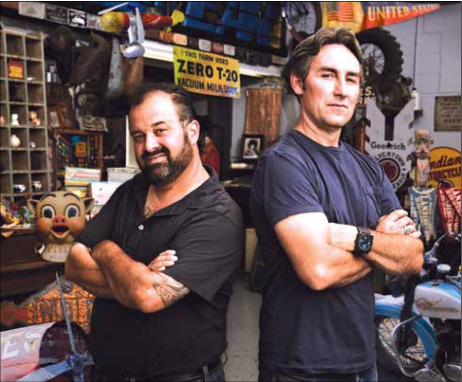
Mike Wolfe (right) and Frank Fritz will be returning to California to film AMERICAN PICKERS.