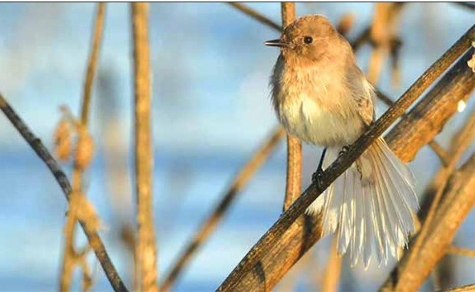
Winning Photo by Chamong Xiong of a Leucistic Black Phoebe at Merced Wildlife Refuge. Photo courtesy 2019 WCA

By Rick Reed, Annual Wildlife Care Association