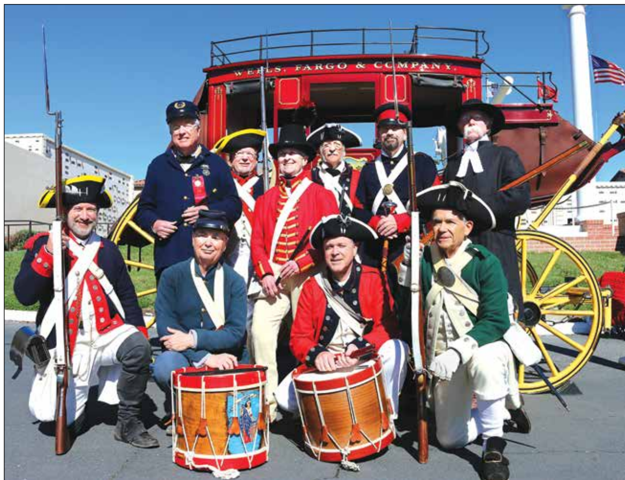
Colonial history reenactors will be part of pageantry during Mt Vernon Memorial Park's annual celebration of American heritage.