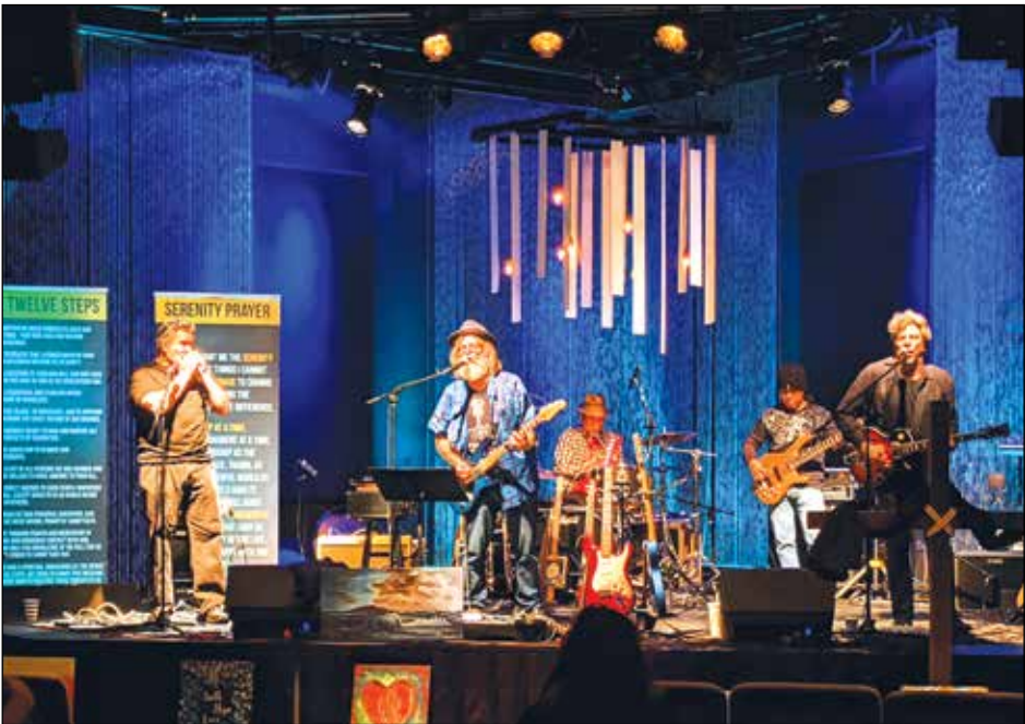
Christian rock band Crimson Blues performs at the Higher Power recovery celebration on January 17.