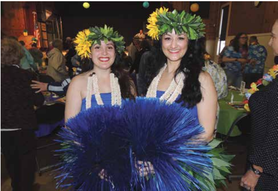
The relaxing experience of a Hawaiian Luau will transport you to paradise.

*Not all SAM member museums will be able to officially participate in Free Museum Day on February 1, 2020, by offering complimentary admission so please review the participant list carefully and/or contact them directly with any museum-specific questions. ★