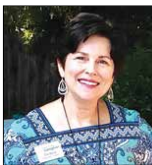
By Dot Boyd, Fair Oaks Chamber of Commerce

Sacramento Republican Women Federated is an affiliate of the National Federation of Republican Women and is dedicated to educating women in Republican principles, increasing the effectiveness of women in the political cause and to introducing the platforms of candidates of the Republican Party in all elections. If you are interested in joining the club, you can contact our Membership Chair: Membership@sacramentorwf.org or go to www.sacramentorwf.org and join online. ★