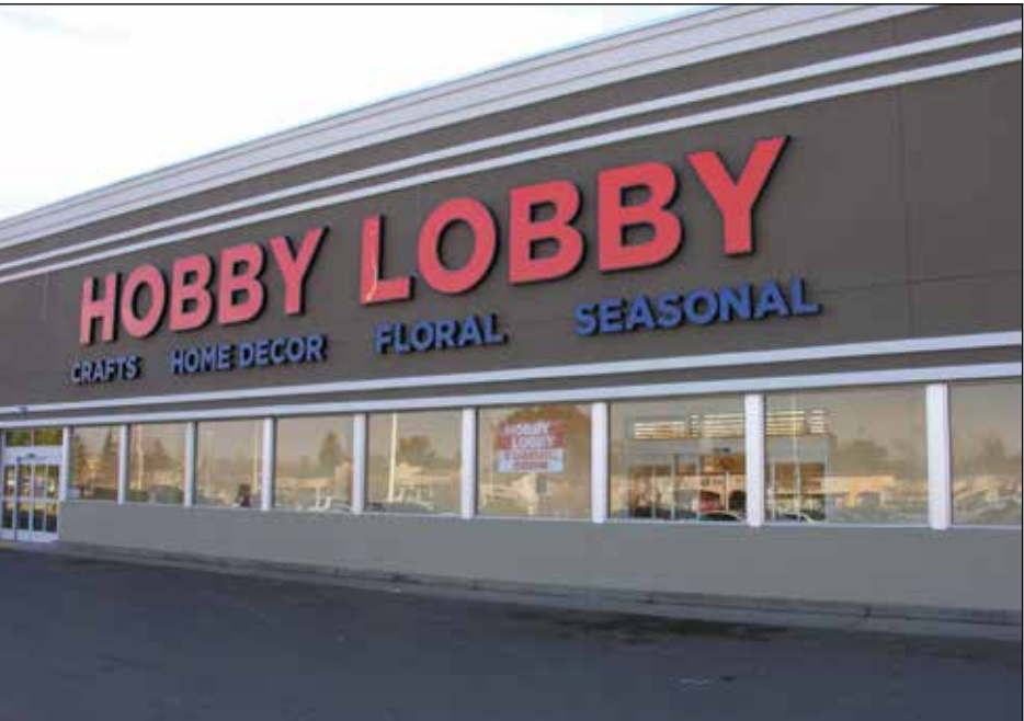
Frontal view of the new Hobby Lobby to open in Citrus Heights.