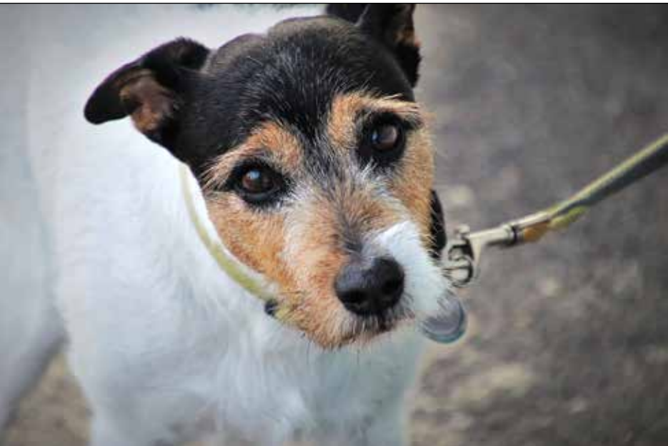
Come celebrate the amazing commitment of our community to healthy, happy and unconditional relationships between pups and their people!