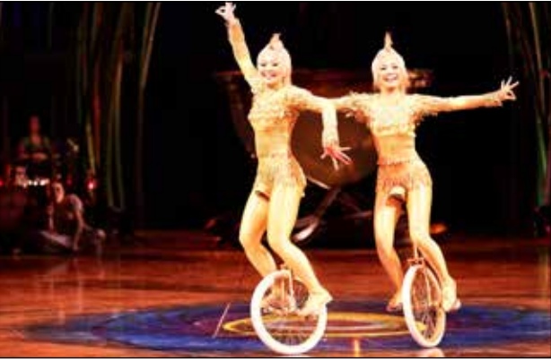
Unicycle.   

Written and directed by Tony Award-winning director Diane Paulus, Cirque du Soleil's 33rd production is a celebration of love and a tribute to the work and voice of women, featuring a cast that comprises mostly women with an all-female band. The show's title is a fusion of the words ama, which refers to "mother" in many languages, and luna, which means "moon," a symbol of femininity that evokes both the mother-daughter relationship and the idea of goddess and protector of the planet. AMALUNA invites the audience to a mysterious island governed by goddesses and guided by the cycles of the moon. Their queen, Prospera, directs her daughter's coming-of-age ceremony in a rite that honors femininity, renewal, rebirth, and balance – which marks the passing of these insights and values from one generation to the next. In the wake of a storm caused by Prospera, a group of young men lands on the island, triggering an epic, emotional story of love between Prospera's daughter and a brave young suitor. But theirs is a love that will be put to the test. The couple must face numerous demanding trials and overcome daunting setbacks before they can achieve mutual trust, faith, and harmony. ★