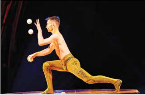
Juggling. Photo Markus Moellenberg    2016 Cirque du Soleil