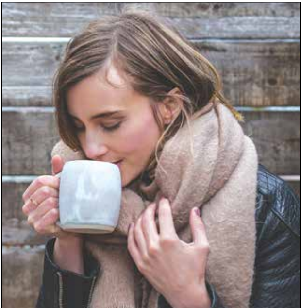
Winter-weather conditions and temperatures are upon us, now is a great time to review cold weather tips.

SACRAMENTO COUNTY, CA (MPG) - Now that we are moving into winter-weather conditions and temperatures, it's a great time to review cold weather tips: Check on elderly family members, friends or neighbors. Seniors and those with serious medical conditions are at risk. Check on community members that might be vulnerable to ensure they are safely keeping warm. Bring your pets inside when temperatures start to dip near freezing. A dog or cat left outside in severe cold weather can die quickly from exposure. Except for exercise and walks, all dogs and cats are safer indoors during the winter. Make sure they have a warm, draft-free place indoors with a dry mat or blanket that they can lie on. For additional winter weather tips for animals, check out the Bradshaw Animal Shelter's website. Heat your home safely - carbon monoxide is a silent killer. It is not OK to heat the inside of your home with any kind of BBQ, propane heater, or any other fuel-fired equipment due to the risk of carbon monoxide poisoning. Only use heaters installed with your home and those designed to be used indoors. Make sure that your natural gas furnaces and other appliances are in good, clean working order. Insulate outdoor pipes that lead into your home to prevent freezing. Seal with caulk around the pipes that lead into and out of your home. Inside your home, leave the bathroom and under-sink cabinets open to