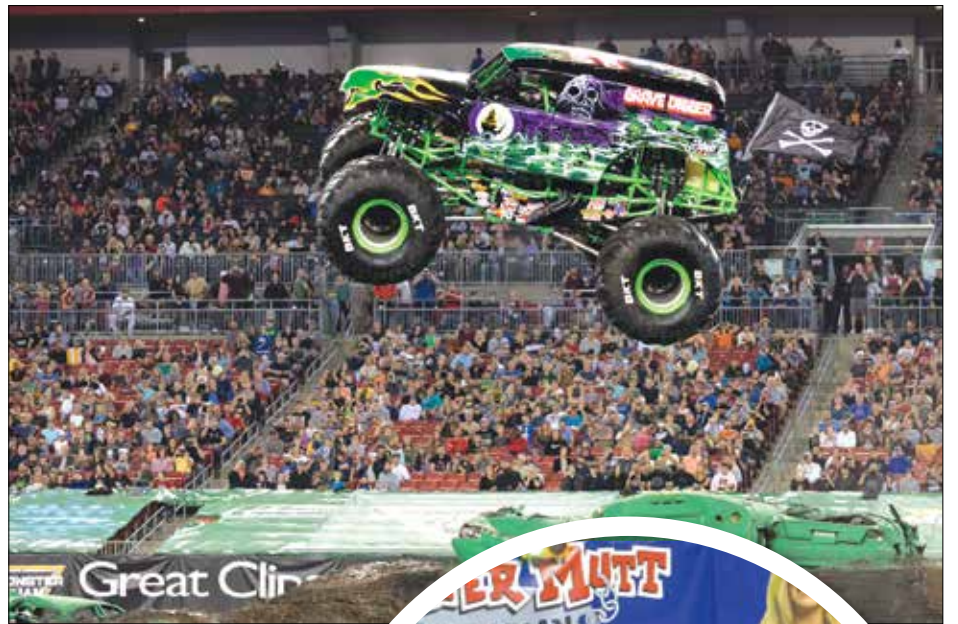
Above: The Gravedigger delivery monster truck will be making incredible flies through the Monster Jam® circuit. Right: The MJ Speedster is part of the Gravedigger team of high-flying action and four-wheel excitement.