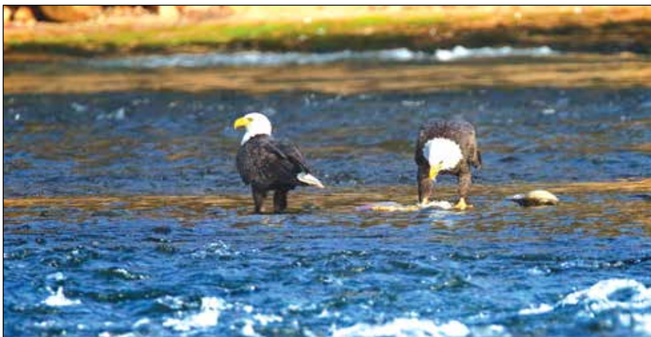
A courting pair of bald eagles find easy pickings as spawning Chinook salmon struggle upriver near Gold River.