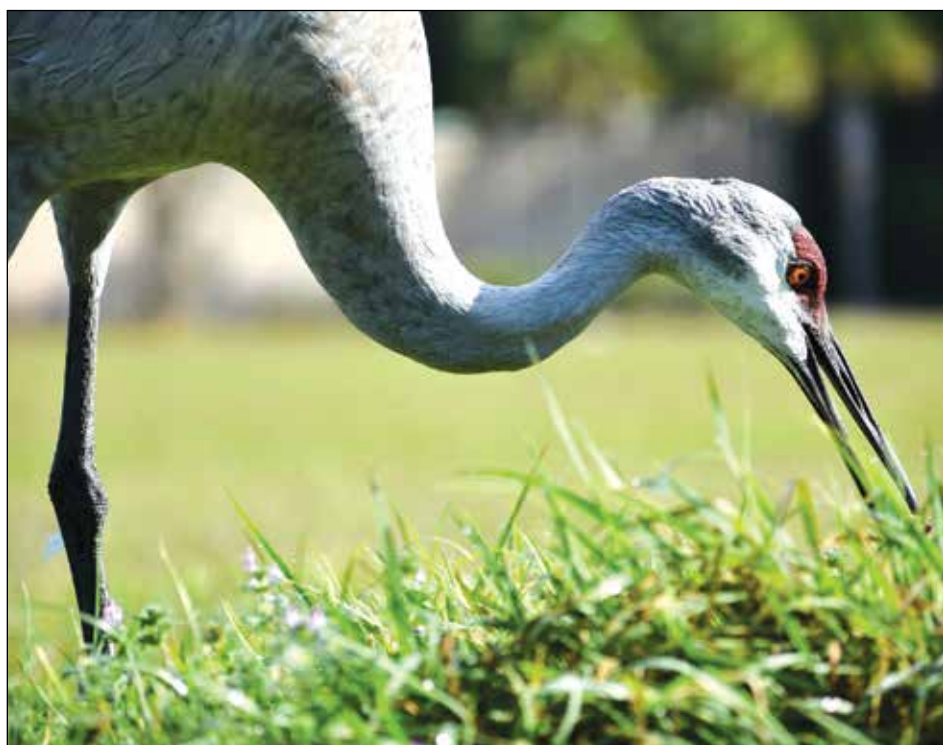
Of the six subspecies of Sandhill Crane found in North America, three can be found in California.