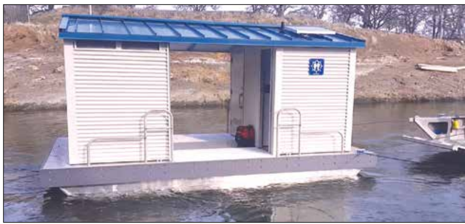
Floating restroom shown during December 2019 deployment at Lake Berryessa. Each ADA compliant unit holds about 500 gallons of sewage.

DBW's Floating Restroom Grant Program helps reduce pollution from recreational boater sewage by providing floating public restrooms in areas with limited landside access. Over the years, DBW floating restrooms have become known as S.S. Relief stations. California State Parks' engineering group re-designed the restrooms this year to achieve ADA compliance. The floating restrooms are solar-powered and the holding tanks