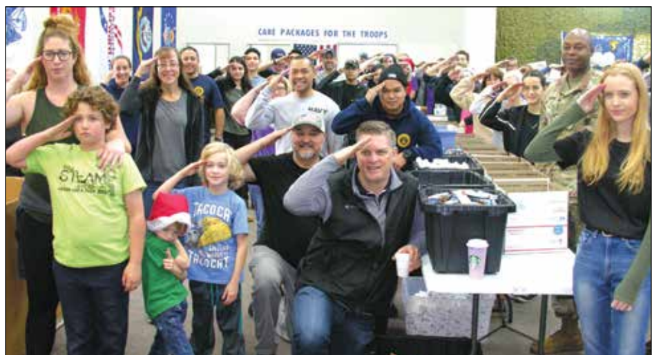
Move America Forward, members of the military community and volunteers stand by their stations, sending a salute to our service men and women.