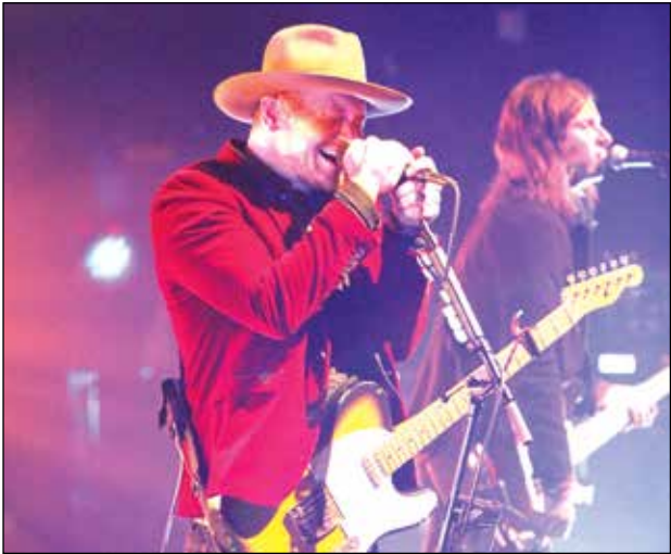
Lead singer Wilder Woods of the band Needtobreathe will be in concert on January 9.

This year's benefit gala is unique compared to past years as the organization has turned its mission towards specifically helping children battling pediatric cancer through their recent partnership with Keaton's Child Cancer Alliance. They will also continue helping impoverished children