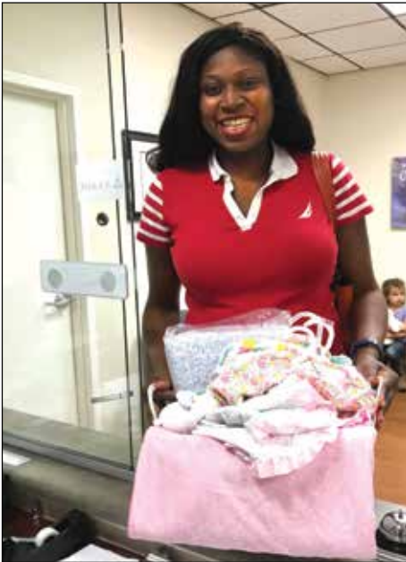
A Sacramento Life Center patient receives a baby basket in November. The center is running its annual Baskets4Babies drive through December.