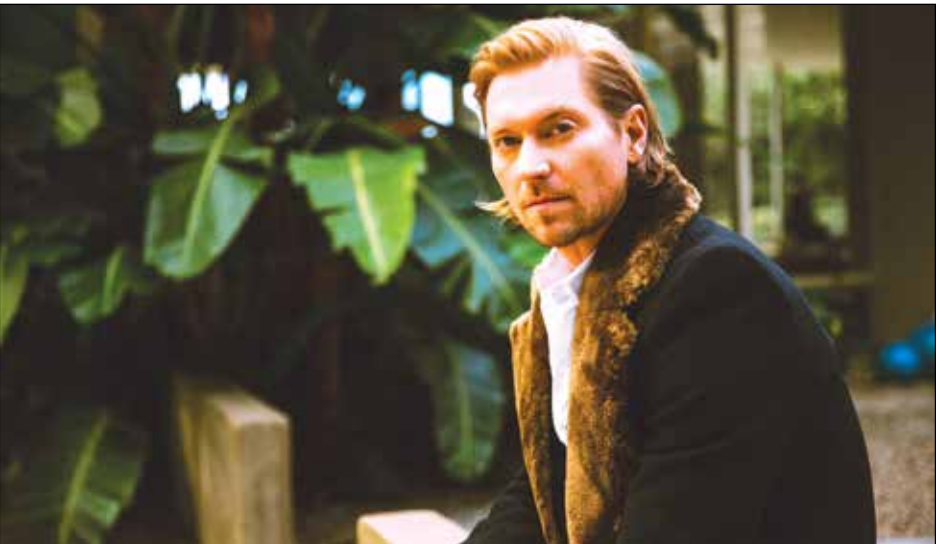
Known to many as the lead singer of GRAMMY nominated band NEEDTOBREATHE, Wilder Woods is Bear Rinehart's solo project in his electrifying career. With a blend of R&B, modern pop, and classic soul, Wilder Woods is a treat for your ears with swagger and style.