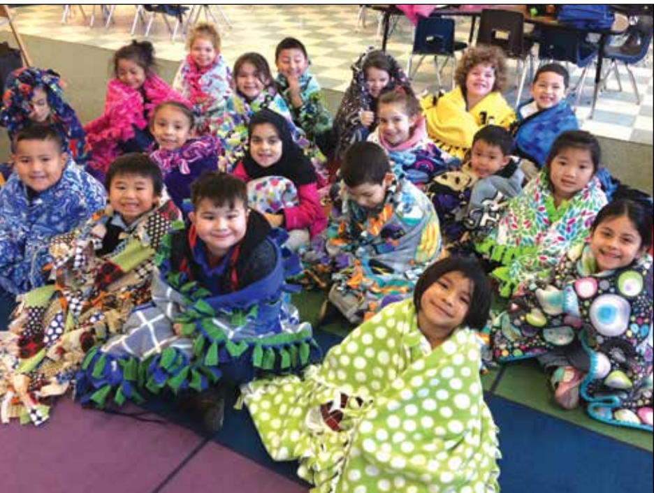
Seven of the lowest income Sacramento kindergarten schools received fleece blankets and Beanie Babies in Sacramento on Monday, Dec. 16th.