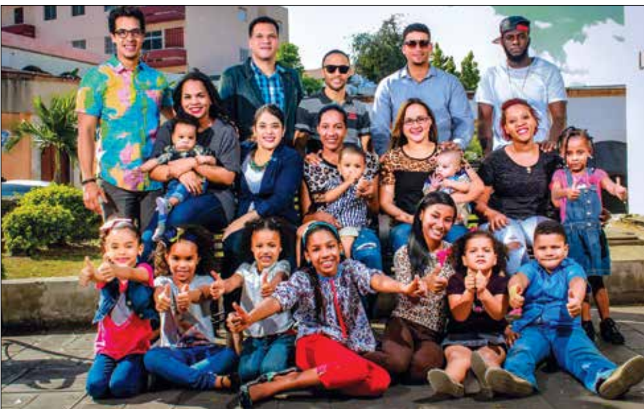
"This day is a great reminder to community members that they can become a resource or adoptive parent and open their homes and hearts to foster youth in need."