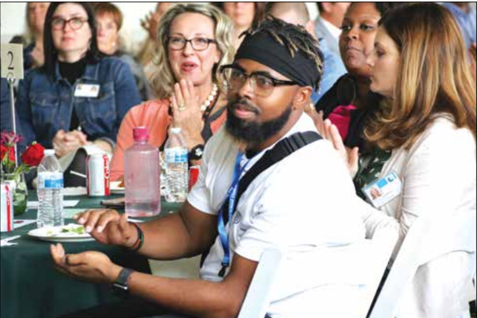
Business and civic leaders from the community participated in the annual Principal for a Day event on Nov. 13.