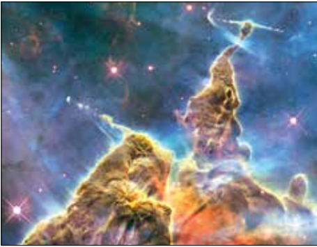
Carina Nebula's 'Mystic Mountain' Within the tempestuous Carina Nebula. This three-light-year-tall cosmic pinnacle, imaged by the Hubble Space Telescope's Wide Field Camera 3.

The Exhibit features a 1:15 scale model of the Hubble Space Telescope, a real-time GeoSphere that displays earthly phenomena and a collection of tools that have actually flown into space to serve one of five servicing missions Hubble has required since its launch in 1990. Visitors will experience a deeper appreciation for Hubble's mission and a sense of child-like wonder at the sheer size