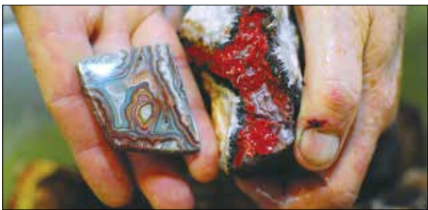
A "before" and "after" (left) sample of polished lace agate from Mexico, for sale at the Roseville Rock Roller's annual Gem and Mineral Show.