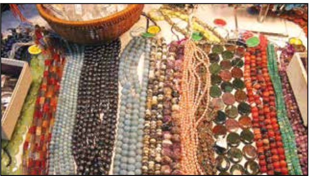
Beautiful, polished stones have been strung by hand in a variety of colors and sizes to create one of a kind necklaces for sale during the Gem Show (above).

ens of exhibits for attendees, such as jewelry, metal, wire and glass beading arts, fossils, crystals and minerals, but that's not all. So that attendees aren't rushed, the show also provides a cafeteria. "A very fine hot lunch is available at our own kitchen in Johnson Hall," states Hutchings. The group has put together a menu of very reasonably priced food and beverages will also be available