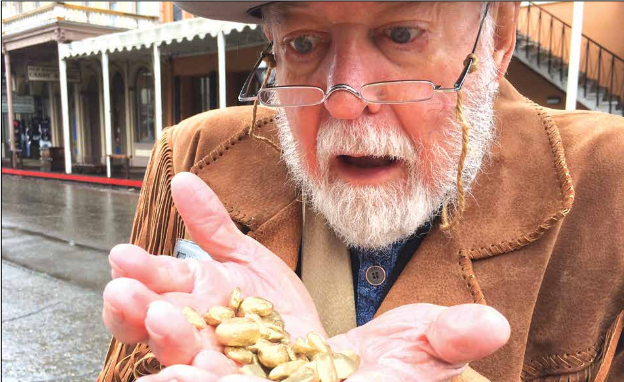
Come out and play “Gold Fever!”

A New Season of Popular Old Sacramento Underground Tours & Interactive Games