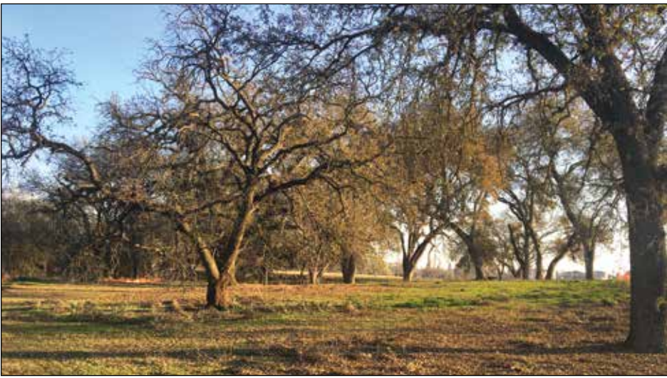
The future park land is studded with beautiful native oak trees that will be preserved as a nature area.

Continued from page 1 adjacent to Arcade Creek where the late Claudia and Irving Gum formerly sold pumpkins and provided hay rides through the pumpkin patches. The protected oak woodland will be incorporated in the new park as nature walk areas.” Carhart expressed gratitude that the natural beauty of the property will be preserved, stating how important the property was to the late Irving Gum: “That land was his love.” Carhart explained that Elliott Homes is developing the park but it will be maintained by the FORPD, funded through district assessments paid by the property owners of the Gum Ranch community. The collected funds are required to be spent maintaining the Gum Ranch Park and cannot be spent