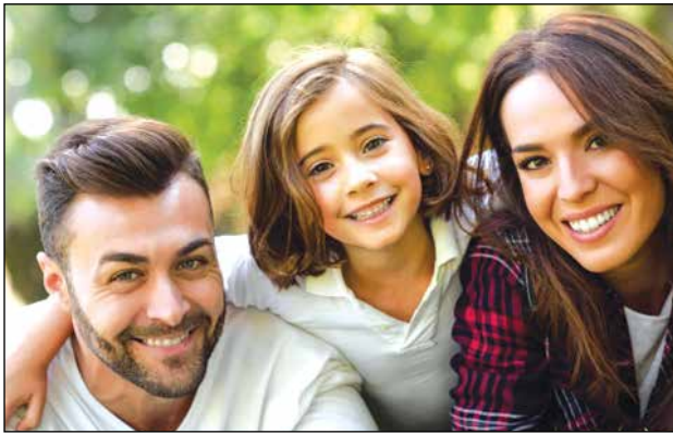
Counties throughout California are working to recruit loving families to care for foster children.

On December 11, the Sacramento County Board of Supervisors approved a nearly $500,000 increase of the Bridge Program contract funding to expand child care support services. The $1.3 million budget for Fiscal Year 2018-19 will be used to contract with Child Action, Inc., the local child care