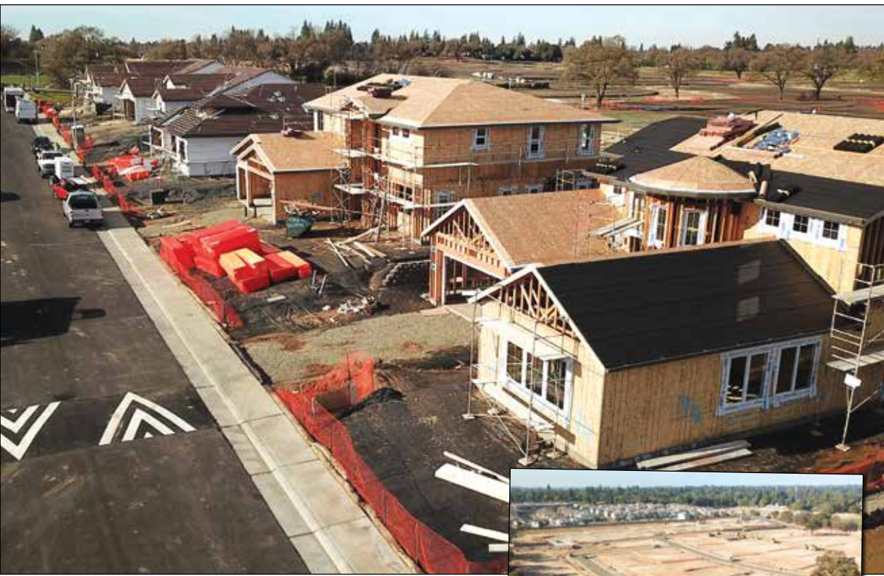
Above: The Heritage at Gum Ranch, a new housing community developed by Elliott Homes, is currently under construction on the south end of the Gum Ranch property, northeast of Bella Vista High School. Right: The existing oak grove will be preserved as part of the Gum Ranch Park.