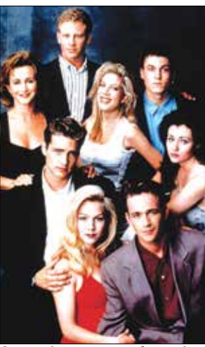
A mockumentary featuring most of original cast playing fictionalized versions of themselves trying to get a reboot started.

for hosting the SAG Awards. She's fierce, funny and so far hasn't