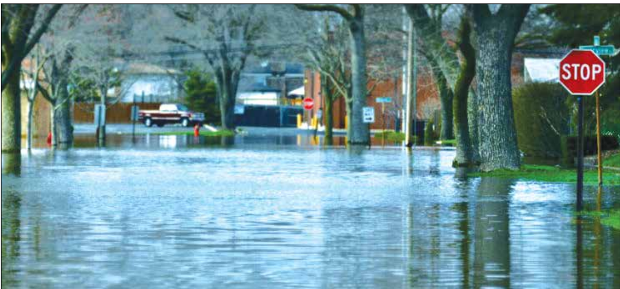
It is important for you to know the flood risk to your home or business.