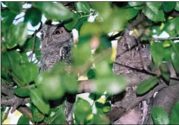
2017 Fall Photo Contest Winner from El Dorado County.

Each photo may be entered once, but individuals may submit more than one. Enter often and donate to help the WCA heroes of nature save thousands of injured, orphaned and displaced wildlife every year.