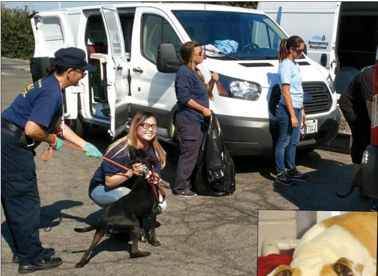
SSPCA welcomes displaced dogs affected by Hurricane Michael.