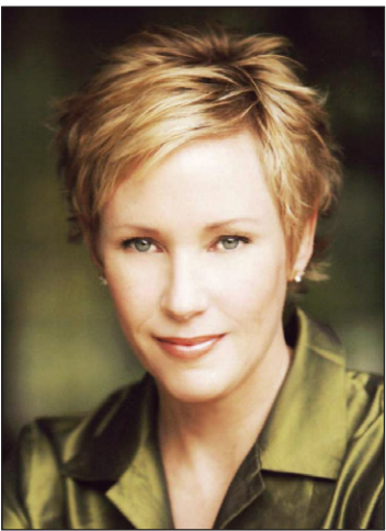
Commentary by Katy Grimes, Investigative Journalist

The United States Forest Service was originally founded to protect forests from the ravages of fire to preserve it for future generations. That thinking was abandoned in favor of the flawed “no-use movement,” or the “rewilding” theory, which blames humans for the “degradation of our planet.” “Rewilding the land can repair damage we’ve caused and reconnect us to the natural world,” National Geographic claims.