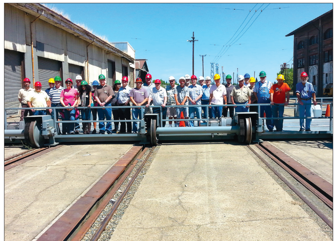
Each year, more than 500 men and women volunteer for the California State Railroad Museum's programs – including weekend excursion train operations, track construction, restoration and maintenance, even clerical work.

SACRAMENTO, CA (MPG) - All aboard for inspiration! California State Parks, the California State Railroad Museum & Foundation and Old Sacramento State Historic Park (SHP) are now recruiting adults (18 or older) who are interested in volunteering to help communicate the West's fascinating heritage of railroading and the California Gold Rush. For those interested, a special, drop-in Volunteer Open House is scheduled for Saturday, September 8, 2018 from 1 to 3 p.m. in the Stanford Gallery located at 111 I Street in Old Sacramento (next door to the California State Railroad Museum). Volunteer applications are being accepted now through Friday, September 14, and will be followed by an interview and selection process before training begins. Each year, more than 500 men and women volunteer for the California State Railroad