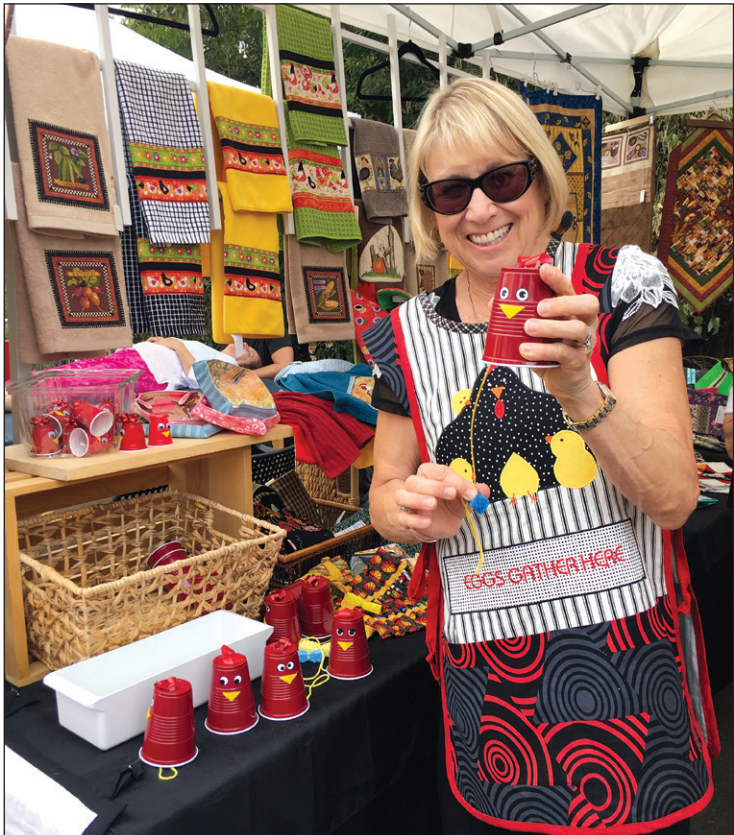
For more information about the Chicken Festival, visit www.forpd.org .

If you're in the mood for a good laugh, head to the main stage at 12PM for the 5th