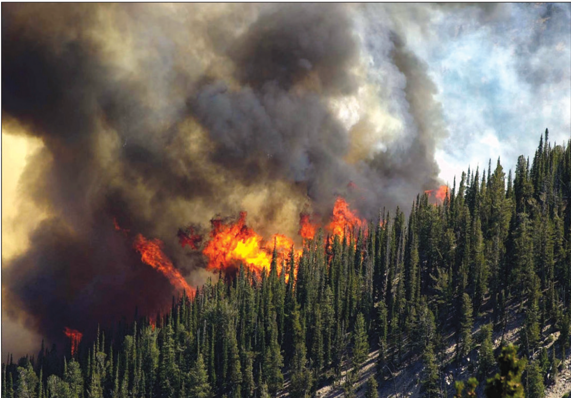
In the midst major fire season, cleaning up after the fires has both the U.S. and California Environmental Protection Agencies developing plans on clearing the ash without causing damage to creeks and rivers. You can find more information from the United States Geological Survey (USGS) on the effects of ash in the waterways.

SACRAMENTO REGION, CA (MPG) - The Sacramento area has been surrounded this summer by wildfires and the effects have been smoky skies and falling ash. Breathing the bad air has been tough enough, but what's