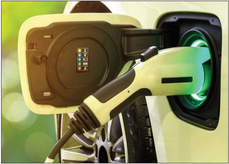
Several locations throughout the county have been identified as prime locations for EV charging stations, including Sacramento International Airport, a crucial component of the regional transportation infrastructure.