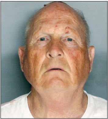
Joseph James DeAngelo

Four felony counts of kidnapping to commit robbery with sentencing enhancements for personal use of a firearm and