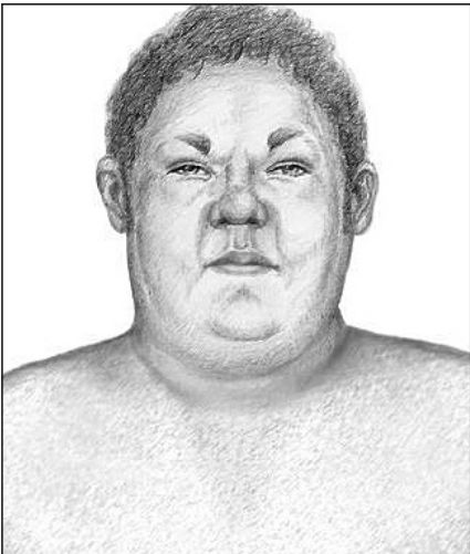
Photographs and an informational poster depicting the unknown individual, known only as John Doe 40, are being disseminated to the public and can be found online at the FBI website at http://www.fbi.gov/wanted/ecap .

SACRAMENTO REGION, CA (MPG) - The Federal Bureau of Investigation (FBI) is seeking the public's assistance with obtaining identifying information regarding an unknown male who may have critical information pertaining to the identity of a child victim in an ongoing sexual exploitation investigation. Photographs and an informational poster depicting the unknown individual, known only as John Doe 40, are being disseminated to the public and can be found online at the FBI website at http://www.fbi.gov/wanted/ecap . The video depicting the unidentified male, John Doe 40, shown with a child, was first noted by the National Center for Missing and Exploited Children in October of 2017; therefore, the video is believed to have been produced prior to this date. John Doe 40 is described as a White male, likely between the ages of 30 and 40 years old. He appears to be heavy-set with dark colored hair. John Doe