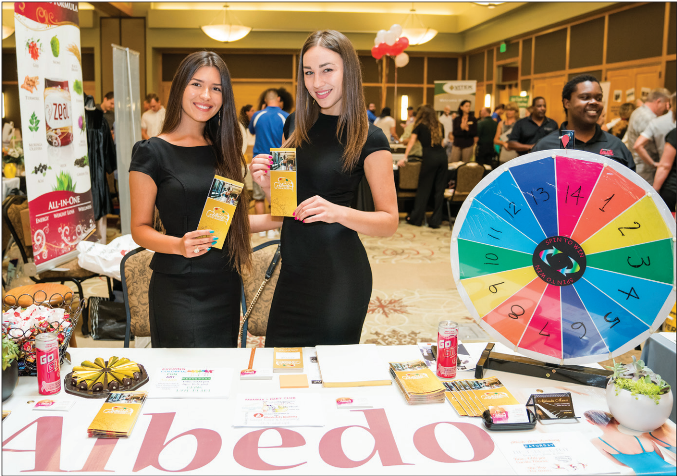
The Multicultural Business Expo will be held on Wednesday, September 5 from 11 a.m. – 3 p.m. at the Milagro Centre in Carmichael.

The expo provides a forum for small business owners to connect with other small business owners or with banks, credit unions, or with many businesses that offer subcontracting opportunities. For students and recent graduates, there will be opportunities to connect with