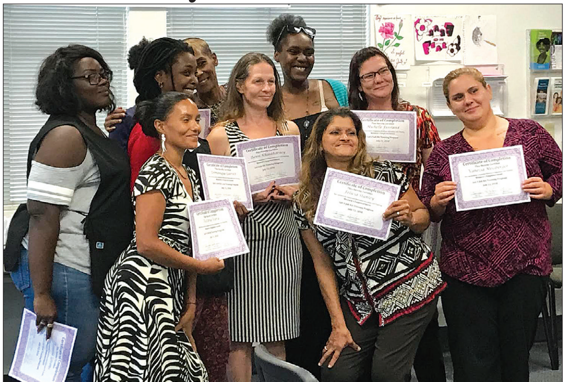
The latest graduates of Women's Empowerment's Get A Job Kit paid training program stand with their certificates as they celebrate the program's 100th graduate.

SACRAMENTO REGION, CA (MPG) - Women's Empowerment's paid training program, The Get A Job Kit, celebrated its 100th graduate in July. The program also graduated its first two lead supervisors who will oversee production. The Get A Job Kit provides formerly homeless women with 120 hours of training in production, customer service, quality assurance, forklift operation, shipping and receiving industries. Over four weeks, trainees are paid to assemble the Get A Job Kits to fill customer orders while receiving hands-on training, performance evaluations and relevant job experience. Women's Empowerment is one of the only nonprofits in Sacramento providing paid job training to formerly homeless women, allowing women to gain financial stability while getting the work experience they need to succeed. More than 70 percent of The Get A Job Kit graduates have secured stable employment. "We serve many homeless women who are ready to work