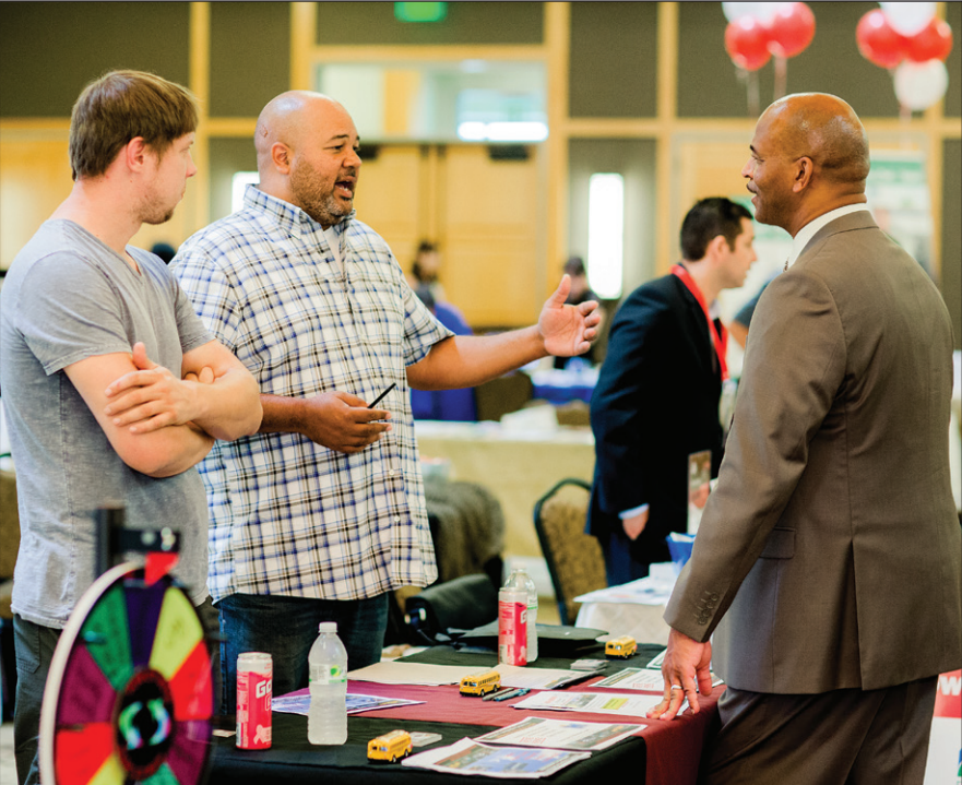
Job seekers should be prepared with resumes and proper business attire to meet with the many businesses that will be on hand.

For more information: visit www.russianamericanmedia.com/our-events/business-career-expo/ or call 916-677-9397. If you visit: The Multicultural Business Expo will be held on Wednesday, September 5 from 11 a.m. – 3 p.m. at 6241 Fair Oaks Blvd., Carmichael, CA 95608. ★