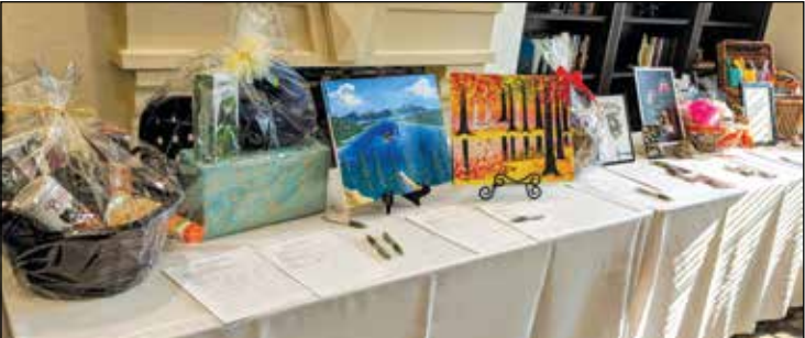
Artwork and extravagant gift baskets are among the items offered in the silent auction.