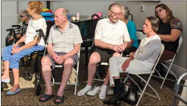
Residents and guests enjoy the musical entertainment.