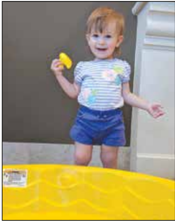
A tot tries her luck at the “ducks in a pond” game.

Folsom and Roseville are also hosting fundraising events throughout the summer to benefit the Alzheimer’s Association. ★