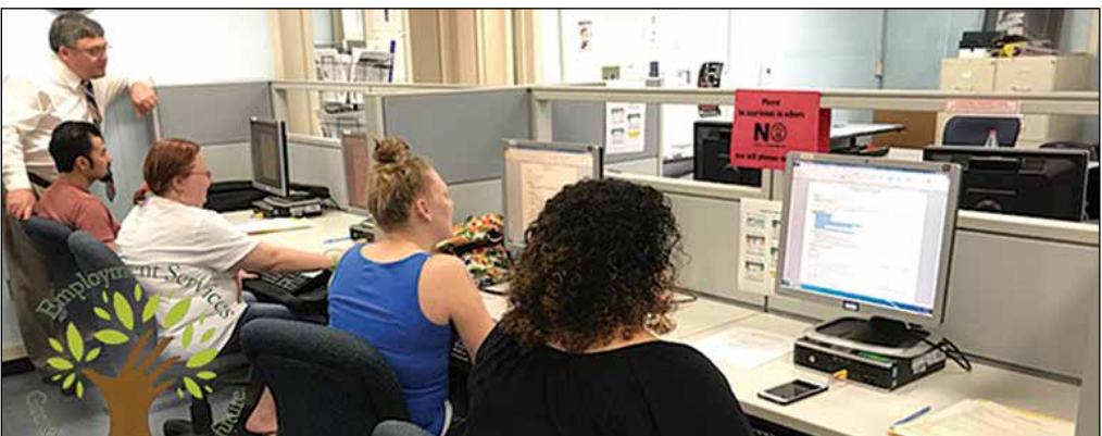
Career Connections Job Club is one of several opportunities offered through DHA’s Employment Services division. Participants, through their case worker, can locate a community volunteer opportunity to build work skills, access a job matching tool that connects participants with opportunities through DHA’s subsidized employment providers and direct hire program.

SACRAMENTO REGION, CA (MPG) - Unemployment often feels like a maze. It can be hard to know where to turn – for CalWORKsrecipients; the Career Connections Job Club is there to help.