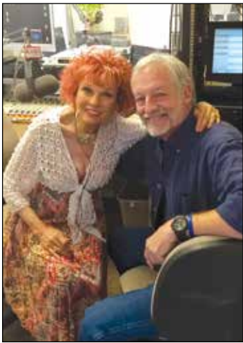
Perry King and I at my radio studio.