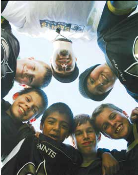
Ready for football season? Join the Fair Oaks Recreation & Park District for our Jr. NFL Flag Football program!

NFL Flag Football Ages 5-14 | $95 | Registration Deadline: 8/15/18 Fair Oaks Park | See online for dates and details Ready for football season? Join the Fair Oaks Recreation & Park District for our Jr. NFL Flag Football program! The program teaches youth the fundamentals of football, good sportsmanship, and teamwork through practices and games. The goal of the program is to educate its participants in the game of football as well as to learn skills and lessons that help them succeed both on and off the field. NFL Team jersey included! Register online at www.forpd.org or call (916) 966-1036 for more information.