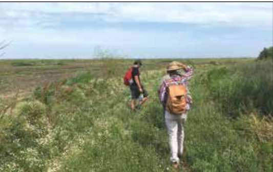
Hikes meet at 9:00AM in the Clubhouse Parking Lot: 7997 California Ave.

Charles Dickens Fair Sunday, December 9 8am-6pm Location: Daly City Cost: $70 Prepare to experience Victoria London as we enter the world of Charles Dickens. Experience the splendor of Ebenezer Scrooge being walked down the street with the Ghost of Christmas past leading the way. Find wonderful handmade gifts for the holidays. Trip includes transportation and entrance into the event. Lunch will be on your own at one of the many restaurants inside. Call (916) 966-1036 for more information. ★