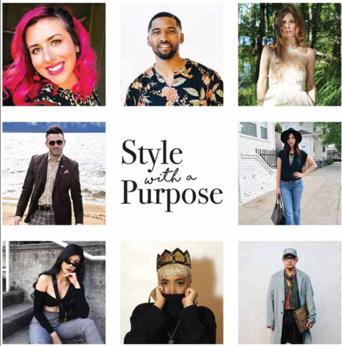
For more information about Style with a Purpose and Goodwill in this area, go to www.goodwillsacto.org.