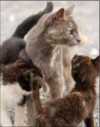
Spaying/Neutering of stray, feral, and abandoned cats will prevent hundreds of litters of kittens, literally thousands of cats yearly.