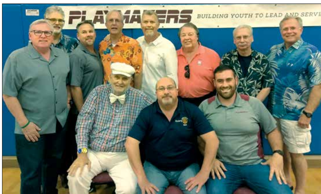
Local organizations and their leaders (above) came together at the Playmakers fundraiser to donate over $30,000 to support the afterschool program. The groups included Sacramento Breakfast Optimists, Citrus Heights Rotary, Rancho Cordova Rotary and County Club Optimists.

Local Service Groups Make Major Donations to Playmakers