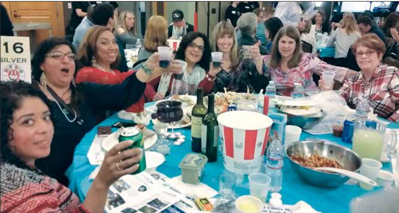
Employees & friends of Hot Dog on a Stick toast their good time at the Rotary crab feed at the Citrus Heights Community Center on July 11.

Crab Feed Fundraiser Reaches from Citrus Heights to India