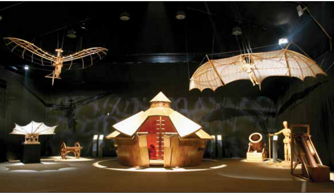
The dynamic “Machines in Motion” exhibit will remain on display at the Aerospace Museum through September 4, 2017.