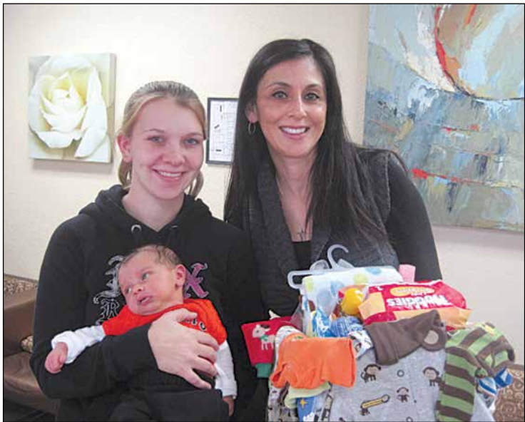
Many of our patients come in scared that they might be pregnant, and it's our job to provide them with a warm, caring support system and resources.