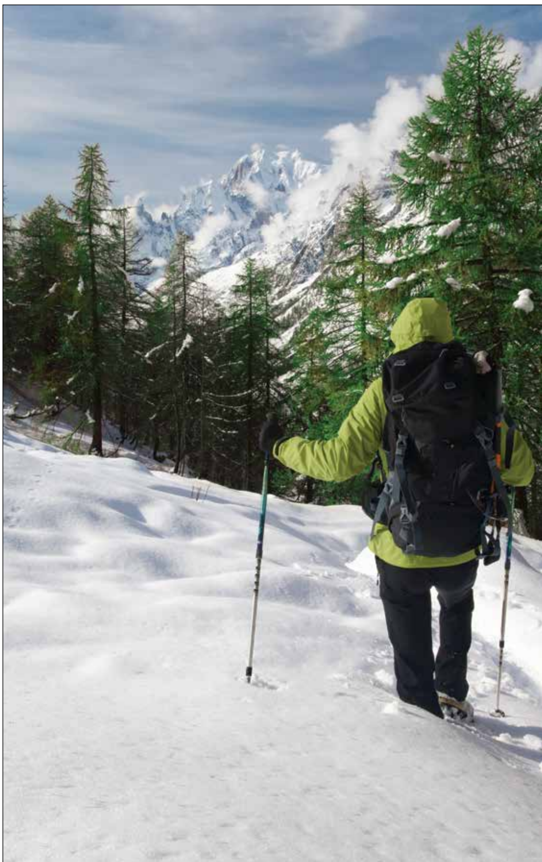
Measurements indicate the water content of the northern Sierra snowpack is 26 inches, 144 percent of the multi-decade average for the date.

The Department of Water Resources (DWR) manual snow survey recently reported "a snow water equivalence of 28.1 inches, a significant increase since the January 3 survey, when just 6 inches was found there. On average,