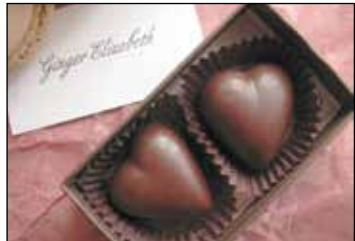
Ginger Elizabeth in Midtown is expecting long lines on Valentine's Day.

For master chocolatier Norman Love, whose candies make frequent 3,000-mile treks west to California as one of the confectioner's top markets, roughly 15 percent of online sales are generated in the three weeks leading up to Valentine's Day. "It's our second-biggest retail