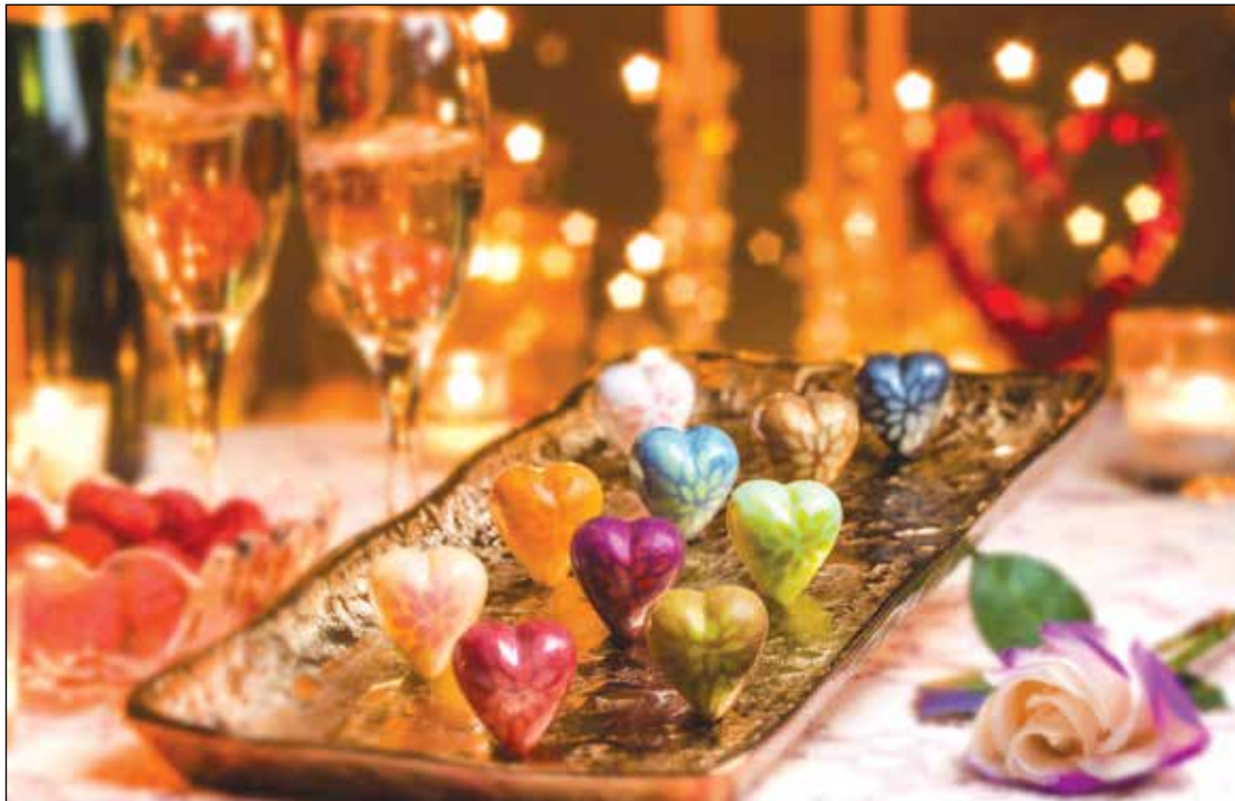
New for this Valentine's Day is Norman Love's "Perfect Pairs" collection.