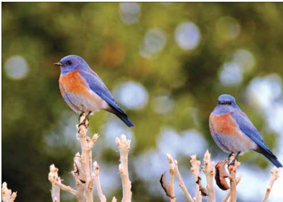
Colorful Western Bluebirds are among scores of avian species anticipating nest building in Carmichael' Effie Yeaw Nature Center reserve. A great egret flies lumber for a tree-top abode. Breeding season behavior of waders, raptors and scores of avian species will be observed during the center's March 18 and 19 Bird and Breakfast events. ★

A 27-year spring tradition, the $40 Saturday safari is followed by gourmet breakfast. Family-friendly Sunday costs $10; $5 for children. A continental breakfast is included. Groups are welcome. Neither excursion is recommended for very young children. Participants should bring comfortable shoes and binoculars. Bird and Breakfast begins at 8 a.m., both days. To learn more about the fundraiser, visit www.sacnaturecenter.net or call (916) 489-4918.