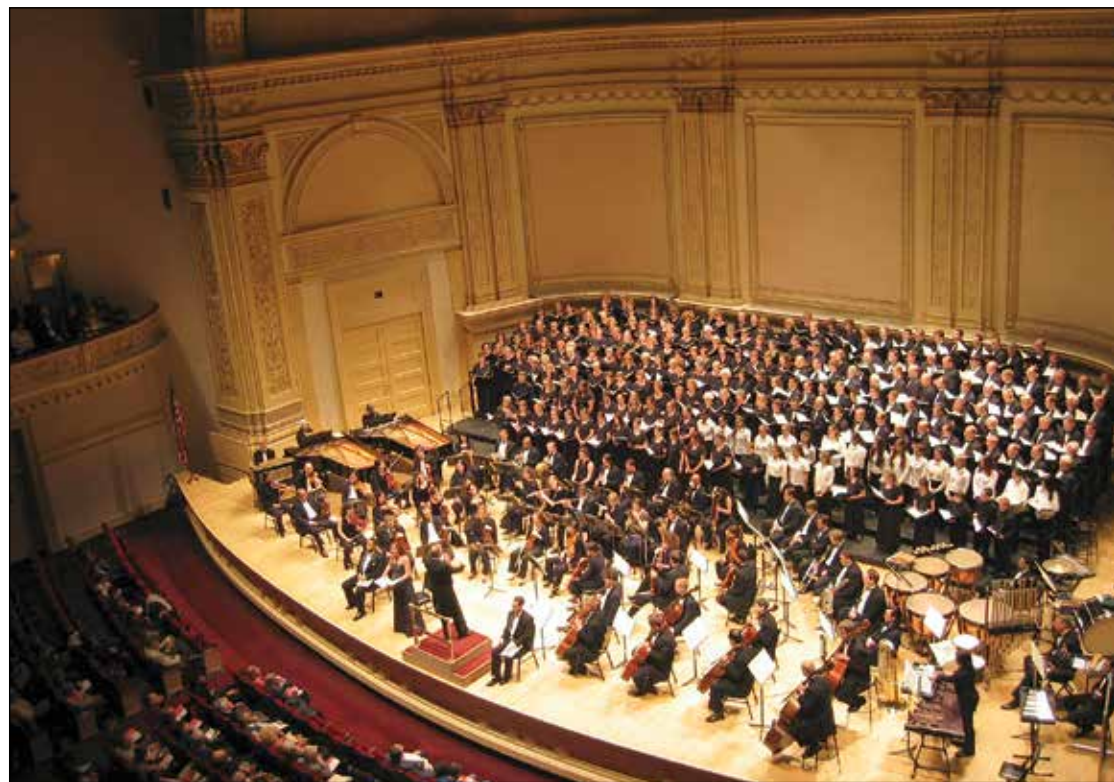
SCSO's debut performance of Carmina in Carnegie Hall, circa 2003.

The SCSO's 2003 stunning premier of Carmina at Carnegie Hall included the New England Chamber Ensemble, Carnegie's resident orchestra, as well as the