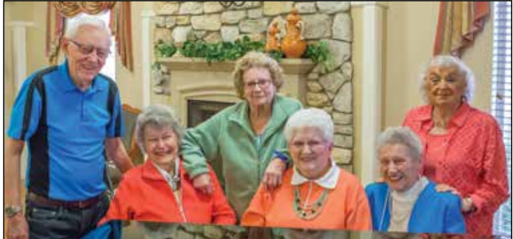
Music when used appropriately can shift mood, manage stress, stimulate positive interactions and support brain health.

Trained facilitators lead residents on different musical journeys that can include trips across the globe, American cinema, show tunes, and more. Each session is uniquely tailored to fully engage each participant through singing, movement, trivia and reminiscence. The beauty of the program is in its adaptability to fit the unique needs of all residents from