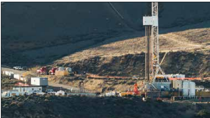
Natural gas will soon become the nation’s top power source, eclipsing coal.

by ample research, have struggled to debunk that narrative for years.