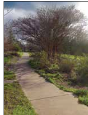
El Niño's rains have made Raphael Garden in Fair Oaks ready for planting.