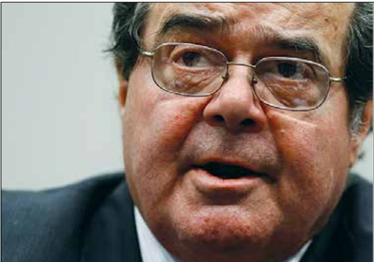
For Scalia, the only justification for the Supreme Court’s power of judicial review to strike down laws that violate the Constitution is that the Constitution has a specific meaning that we can know.

Given the politicized nature of the Supreme Court, it is no surprise that Washington is already squabbling over Scalia’s replacement, less than 48 hours after his death. Democrats are already declaring that Republicans are duty bound to confirm Obama’s replacement. Senator Chuck Schumer has been particularly insistent on this. But this is non-