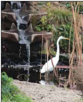
Raphael Garden with great white heron. demonstrations. Then, there will be a midweek Open Garden Ultra Water Efficient Landscape grand opening celebration. At that time you can take a mini-tour of the water efficient landscape gardens,

Upcoming events at the Horticulture Center include a series of open gardens where master gardeners demonstrate techniques for pruning fruit trees, grapes, and berries. They teach the basics of late winter and early spring vegetables on February 20th, from 9 a.m. to noon. Three weeks later, on March 12th, you can learn about growing warm season vegetables and fertilizing fruit trees and citrus, as well as get tips on selecting water efficient plants and watch composting and worm composting