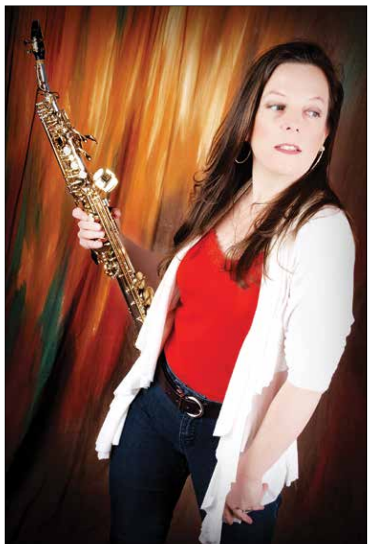
The video that is up for the national award is for her song called "My Evolution" written on the theme that people have their own personal path in life that involves great ups and downs.

Winning the best video title would not provide a cash prize, but rather a confirmation that the