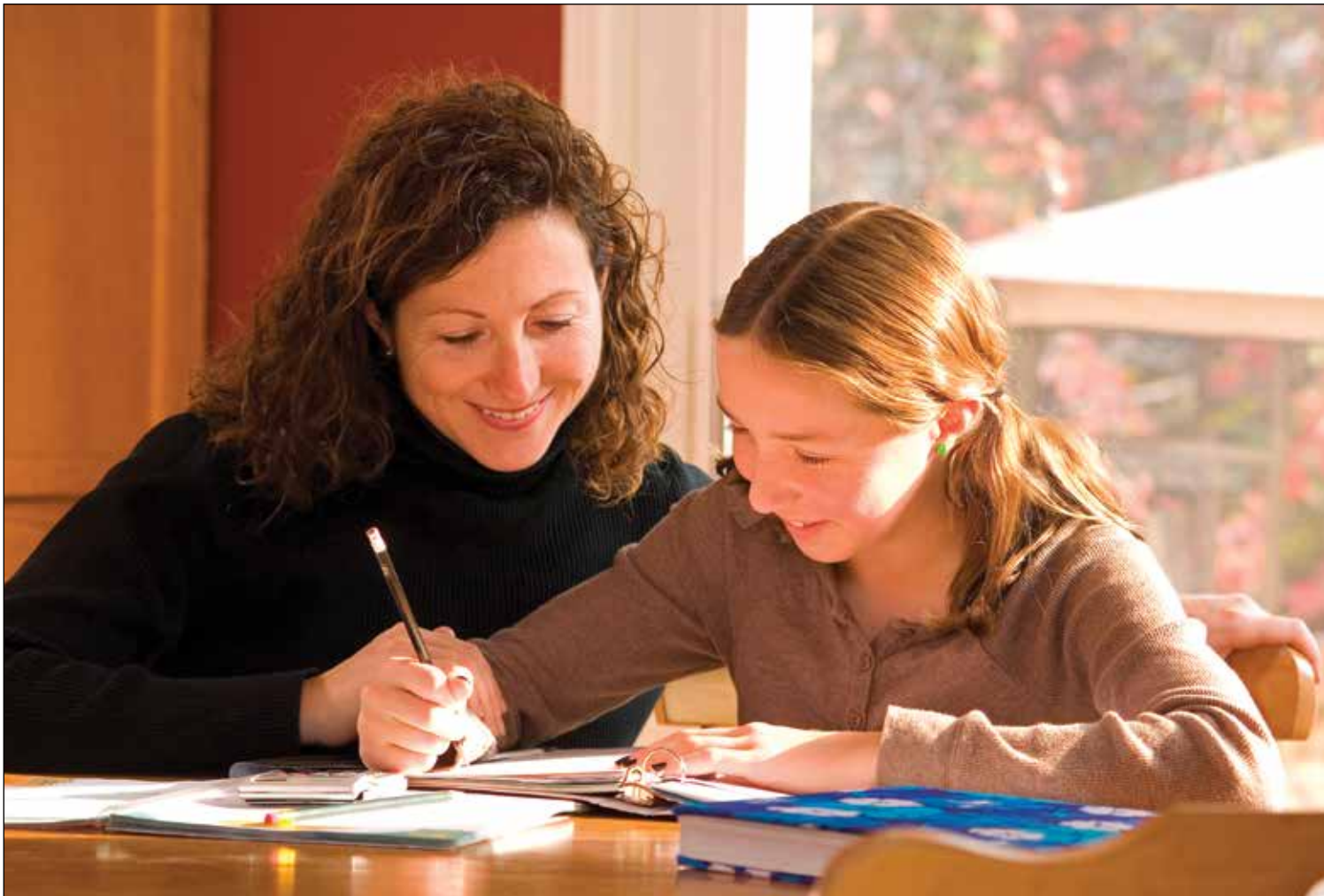
There are many conflicting claims on how much of an increase we have had in homework loads on children in the last 20-30 years. Some claims say it has doubled, others argue that it has stayed pretty much the same. When the communication manager of Sacramento Unified School District was asked if there had been any recent changes in homework policies, she said not at the district level, but that schools handle it on a case-by-case basis.

How long does homework take per subject? When should students get a break from doing homework? Is homework interfering in other activities or family time? When a group of