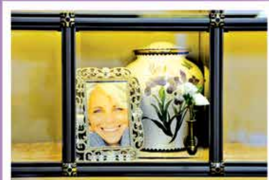
Glass-front cremation niche

No opening and closing fee when purchasing any Pre-Need cemetery property. This can save you up to $895!!