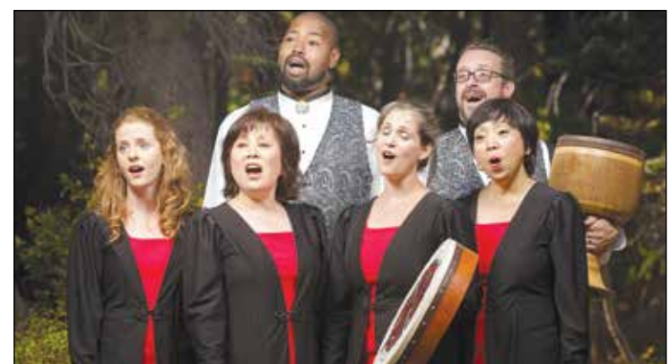
The Sacramento Master Singers present A Celtic Christmas throughout December in two locations: St. Francis of Assisi Church in Midtown Sacramento and the Harris Center in Folsom.

PRESORTED STD. US POSTAGE PAID PERMIT 350 Carmichael, CA Change Service Requested