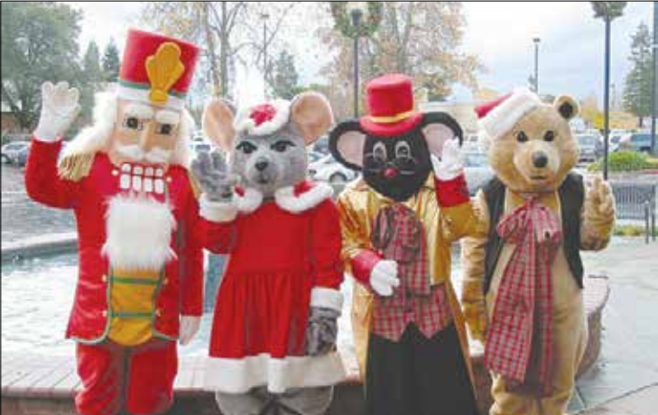
The Holiday Open House at Citrus Town Center is fun and free event. Come see the Sunrise MarketPlace Christmas Characters who love to meet, shake hands, and take pictures with the whole family.