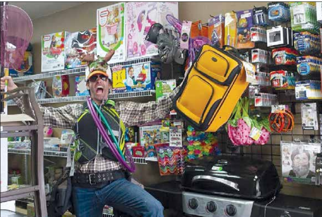
Entering NorCal Stuff’s new store in Citrus Heights is an exhilarating experience for the holiday bargain hunter. They’ve stocked up on a wide assortment of toys priced affordably for the holidays. Inventory changes often so there’s something different to view with every visit.