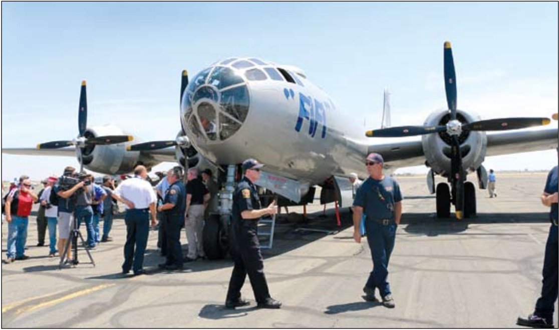
The Commemorative Air Force's fully restored B-29 Superfortress, Fifi flew in to Mather Field Thursday, June 5th.