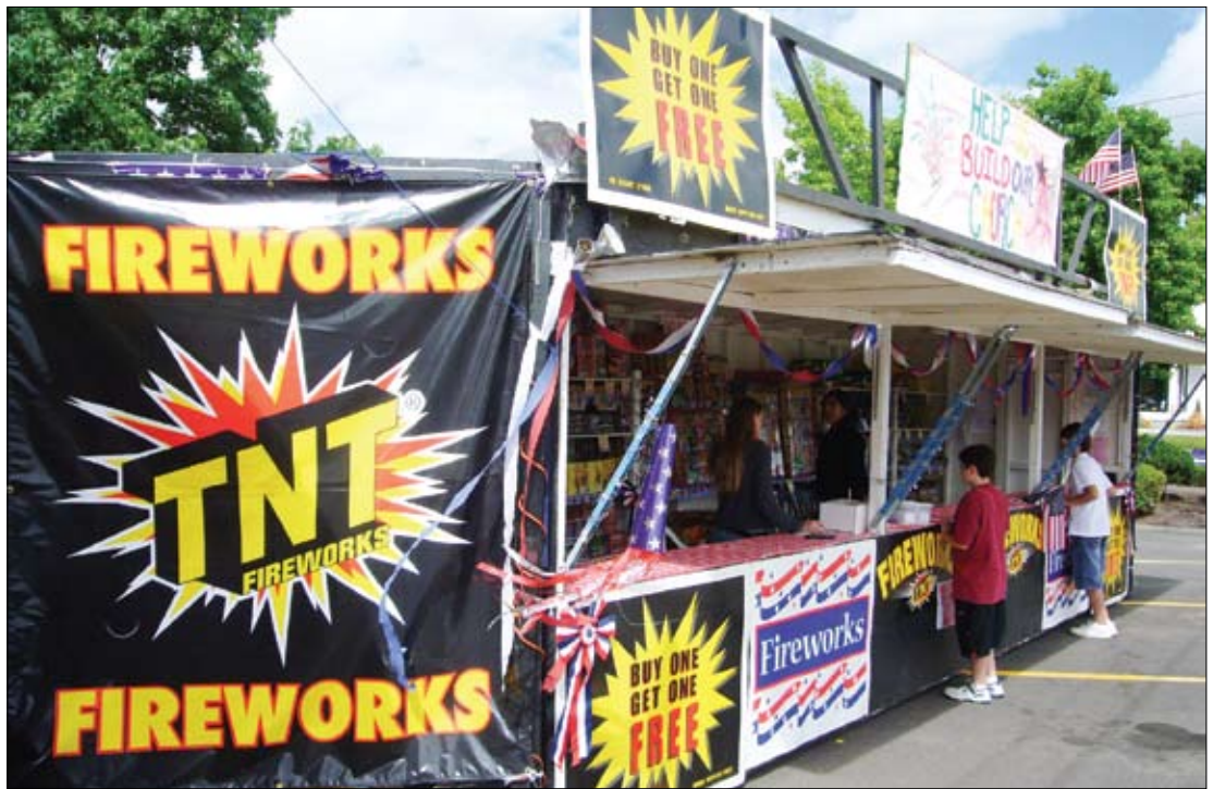
State-approved fireworks in all shapes, sizes and price points are a big fund-raiser for area non-profits from June 28 through the Fourth of July.