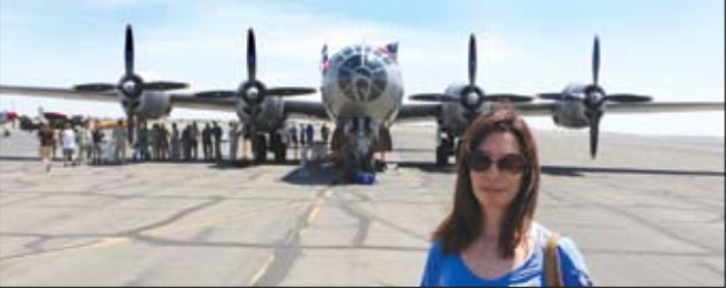
On Thursday, June 5th, I had the privilege of flying in Fifi, The Commemorative Air Force’s B-29 Superfortress from Modesto to Mather Field.

When the engines start for the long “pre-oiling” process, the plane shakes and the decibels go as high as 110. Ear plugs are required gear for flying in Fifi.