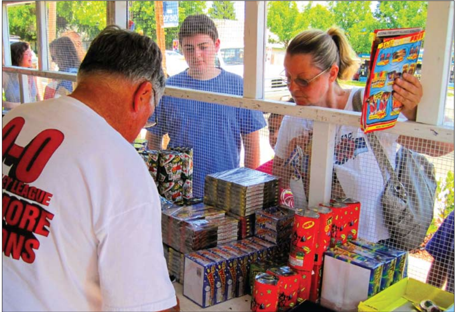
Firework stands run by non-profit groups will be open for business starting June 28 throughout Sacramento County and much of Placer County.

• Sparkling Nights (TNT), $24.99 – TNT's best new fountain is a solid, multi-effect performer with decent burn time for the price. A good mid-show pick. 91 seconds. 3 Stars.