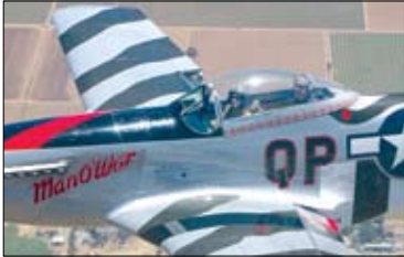
ManO’War, a P-51 fighter, flying off my left shoulder as I held the tail gunner’s position.