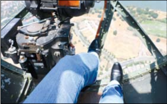
The view from the glass nose, so close you can reach out and put your feet on it, gives a full view above, left, right, and most dramatically, below.

In flight, she burns 400 gallons of fuel per hour.