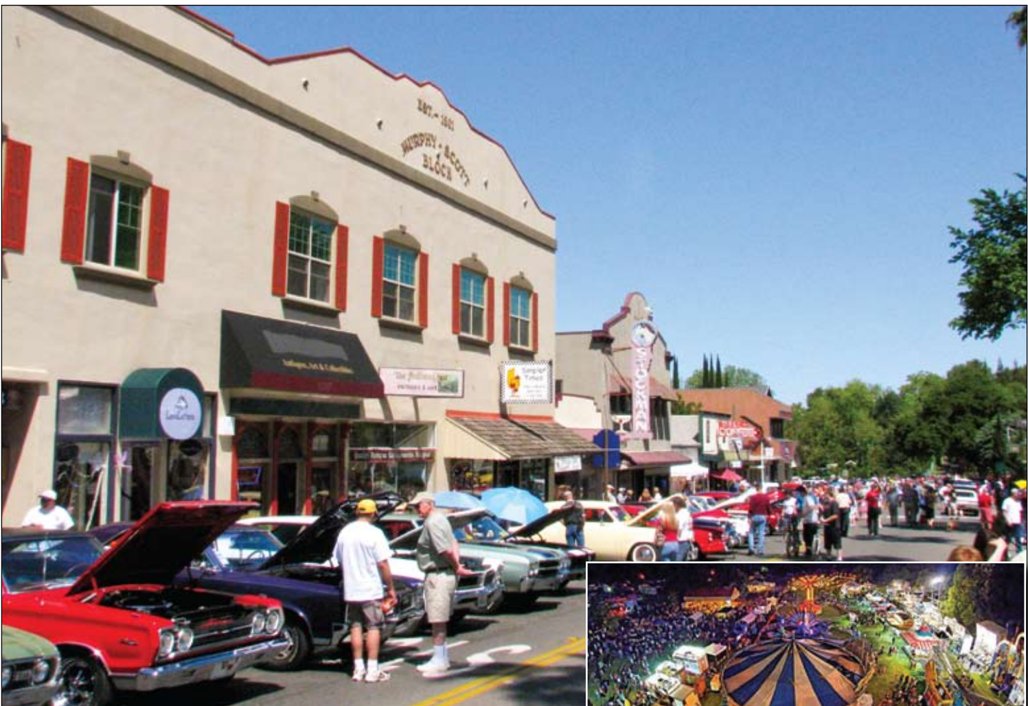
The Fiesta Day Car Show draws thousands. Inset: Night time at Orangevale Pow Wow.