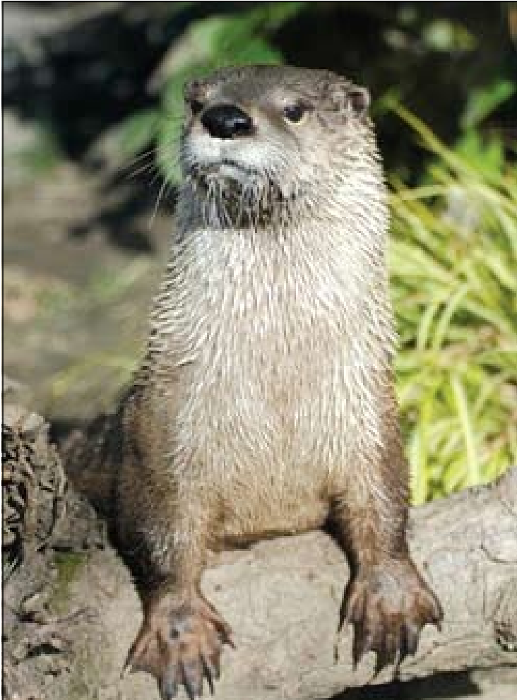
Wilson the North American River Otter.