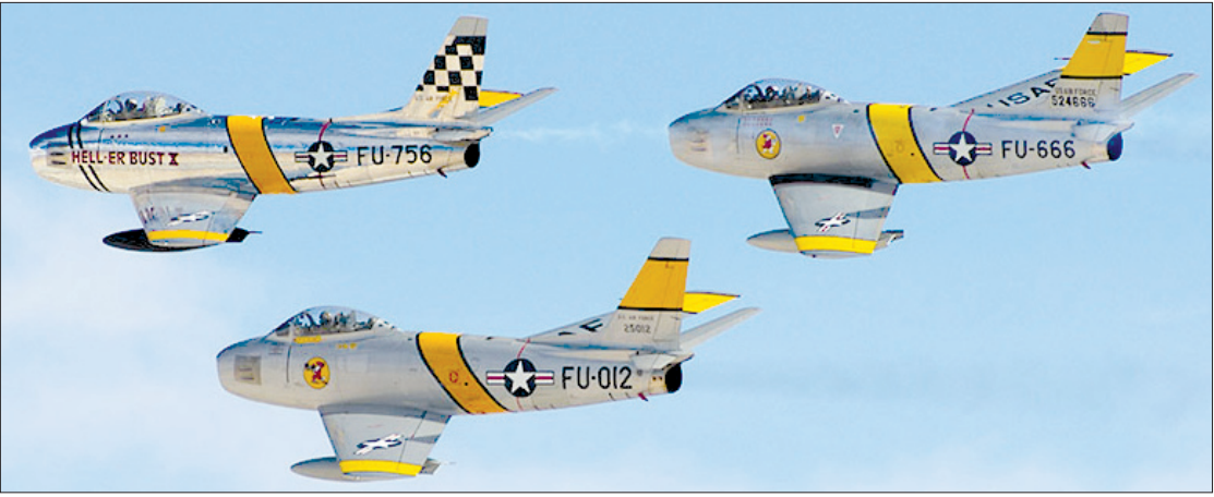
The Bremont Hosreman took off over a decade ago as the worlds only P-51 Mustang formation aerobatic team. They have flown a variety of platforms in formation, working tirelessly to escape gravity. Here they are seen flying the F-86 Sabre Jet.