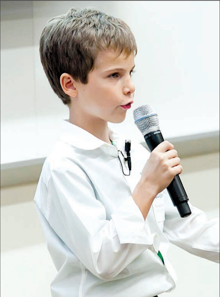
At first, 17 well-respected agriculture innovation technology companies were selected as qualified to enter the Sacramento Regional Technology Alliance’s (SARTA) “AgStart Innovation” venture competition.