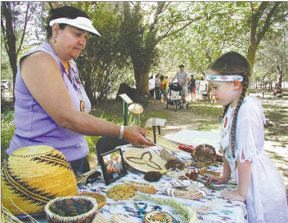
Nisenan basket makers will demonstrate their skills at the Nature Fest event.