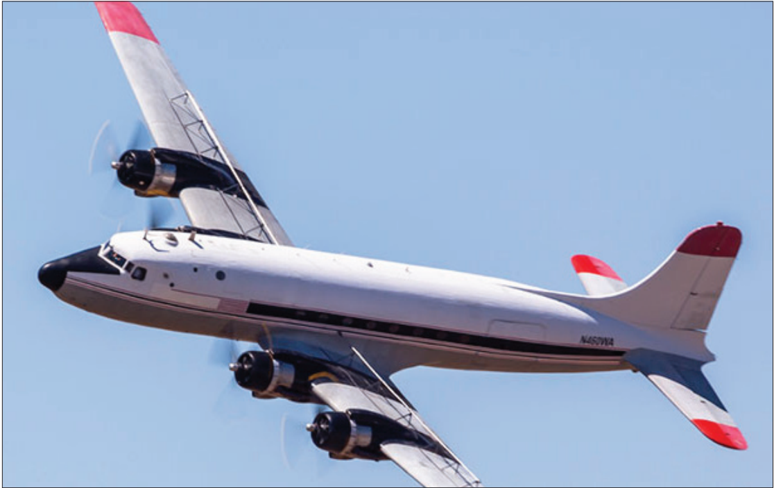
The Berlin Airlift Tribute will honor the greatest humanitarian aviation event in the history of the world.