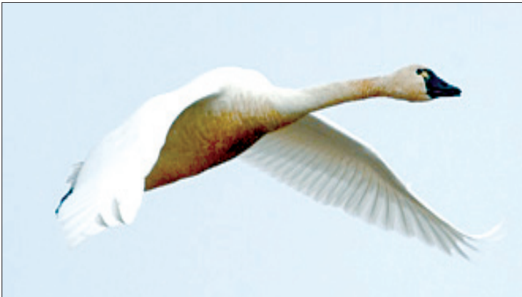
The California Department of Fish and Wildlife (CDFW), in partnership with local rice farmers, will offer free tundra swan tours from Nov. 16 through January 2014.

Tours will be held on Saturdays from 9:30 a.m. to 11:30 a.m. and 1 p.m. to 3 p.m. Pre-registration is required at www.dfg.ca.gov/regions/2/swantours/ .