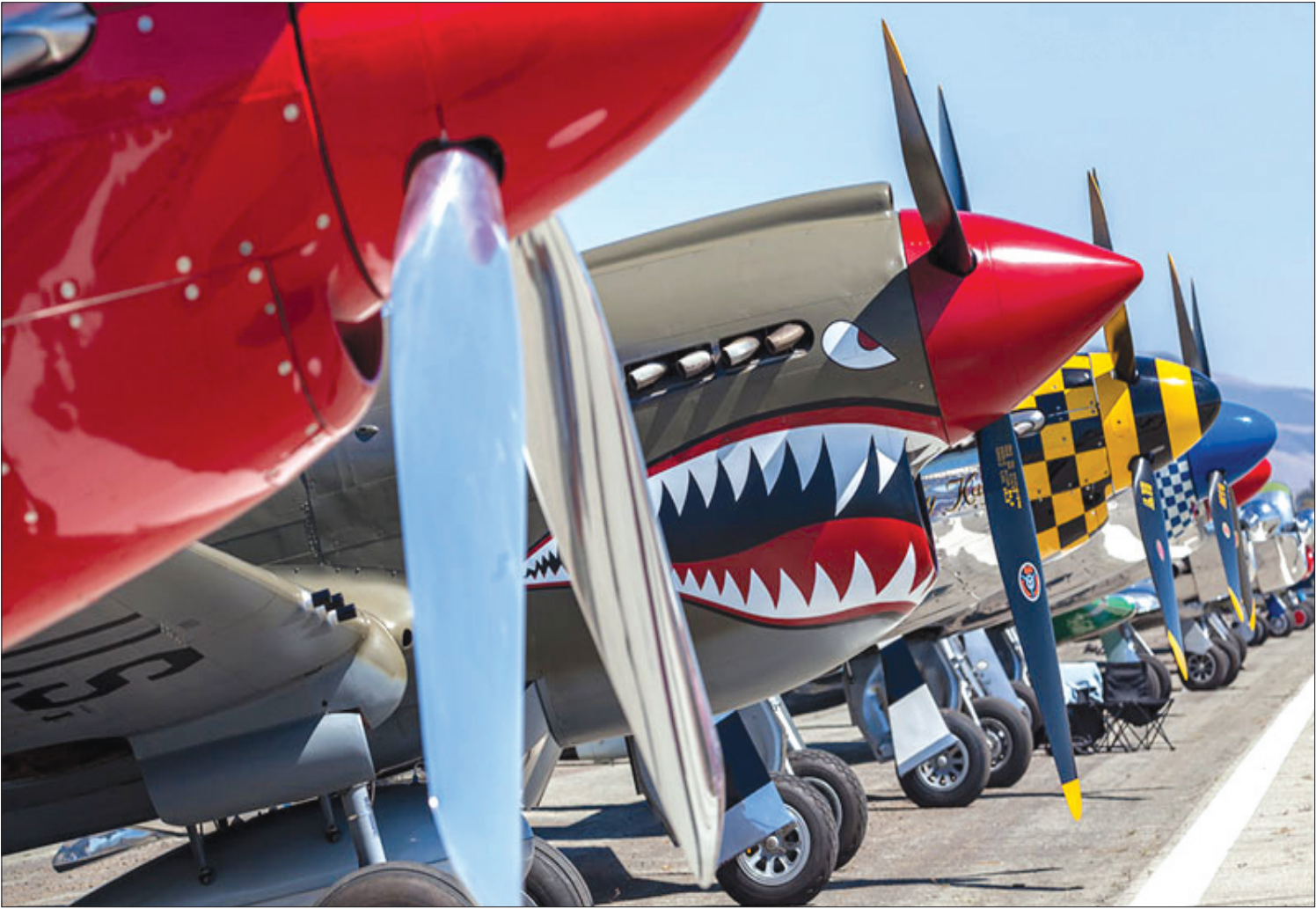
Warbirds Galore in the sky and on the ground The Airshow will be roaring across the skies of our region October 5-6, 2013! The event will offer spine-tingling performances including an international jet team, the Snowbirds, military demonstrations, world-class aerobatics, wingsuit flyers, barnstorming, wing walking, and endless entertainment and displays along the ramp.

the idea of dropping candy bars and chewing gum with hand-made handkerchief parachutes while 'wiggling' their wings, which alerted the children they were about to receive treats. When news reached the United States that pilots were dropping candy to the young people of Germany, children all over America sent in their own candy to help with the mission. Soon major manufacturers joined in, and by the end, over three tons of candy was dropped on Berlin