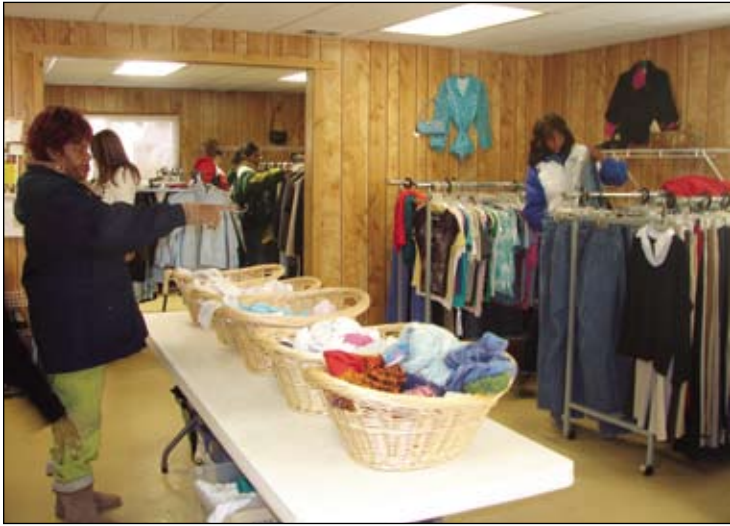
Women's Clothes Closet fills a vital role.

Needs at the Mission are always great. A wish list of daily and seasonable supplies can be found at www.ugmsac.com , and www.facebook.com/ugmsac . For volunteer and donation drop-off information, call (916) 447-3268.