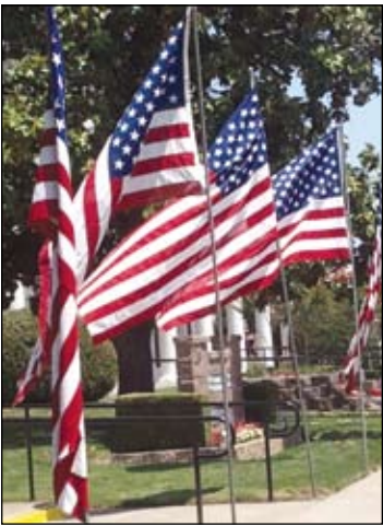
“The flag of the United States is one of the most recognizable symbols on earth, more so than our monuments or presidents. From its creation, the flag has stood for freedom, liberty, and the prosperity of the United States. It was designed to accommodate the growth of a budding nation. Stars have been added, but it has retained the same significance. When you take your flag out to fly, hold it carefully, as it is a representation of our whole nation!” – Author Unknown

in print how our borders, our language, our American culture, and our way of life are being compromised in the name of “political correctness.” We are being led to believe that when we’re too proud of our own way of life, of our freedom and uniqueness, we are insulting another’s “way of life.” This is when it gets dangerous. We still welcome all who desire to come to this country with integrity, as they embrace our culture alongside their own. We welcome them as they learn our language, and come to appreciate and love the American way of life that already exists here as much as we do. We learn from each other. This is what our flag means to me. What does it mean to you?