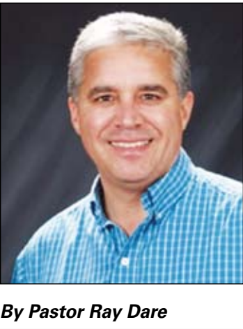
By Pastor Ray Dare

There are a lot of faulty misconceptions about prayer; a lot of ignorance about how prayer works and why we pray and when to pray. Some people think prayer is a magic wand. We kind of wave it at something and we get what we want. Some people think prayer is a first aid kit. For them, prayer is an act of desperation. It's like the sign for the fire extinguisher: "Use only in emergency". For some people, prayer is a tug of war where you have to beg and convince God to do something nice for you. The worst misconception about prayer is that prayer is simply a religious duty. The basic motivation behind prayer is guilt. If prayer is a duty for you, you have missed the total point of prayer. There are many purposes of prayer but here are the big three: Prayer is an act of dedication. It is an opportunity to express our devotion to God and our dependence upon God. It is an act of dedicating ourselves, saying, "God, I need You". The reason a lot of people don't pray is because of the cost. It costs honesty. You