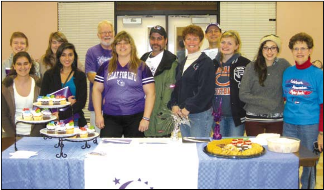
Relay For Life is a community event! You do not have to be on a team to attend and experience the spirit.