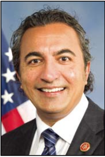
Congressman Ami Bera

Congressman Ami Bera represents Sacramento County in the 113th Congress. A lifelong Californian and first