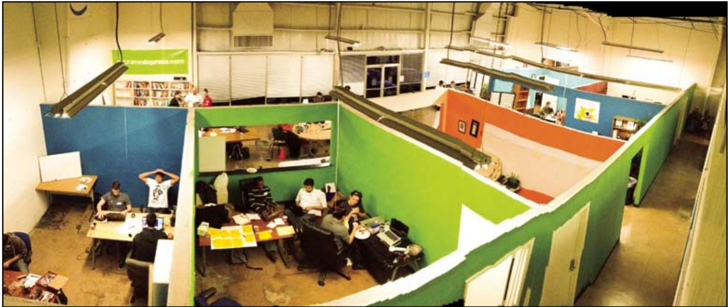
"We are changing the world by providing community resources for education, innovation and creation".