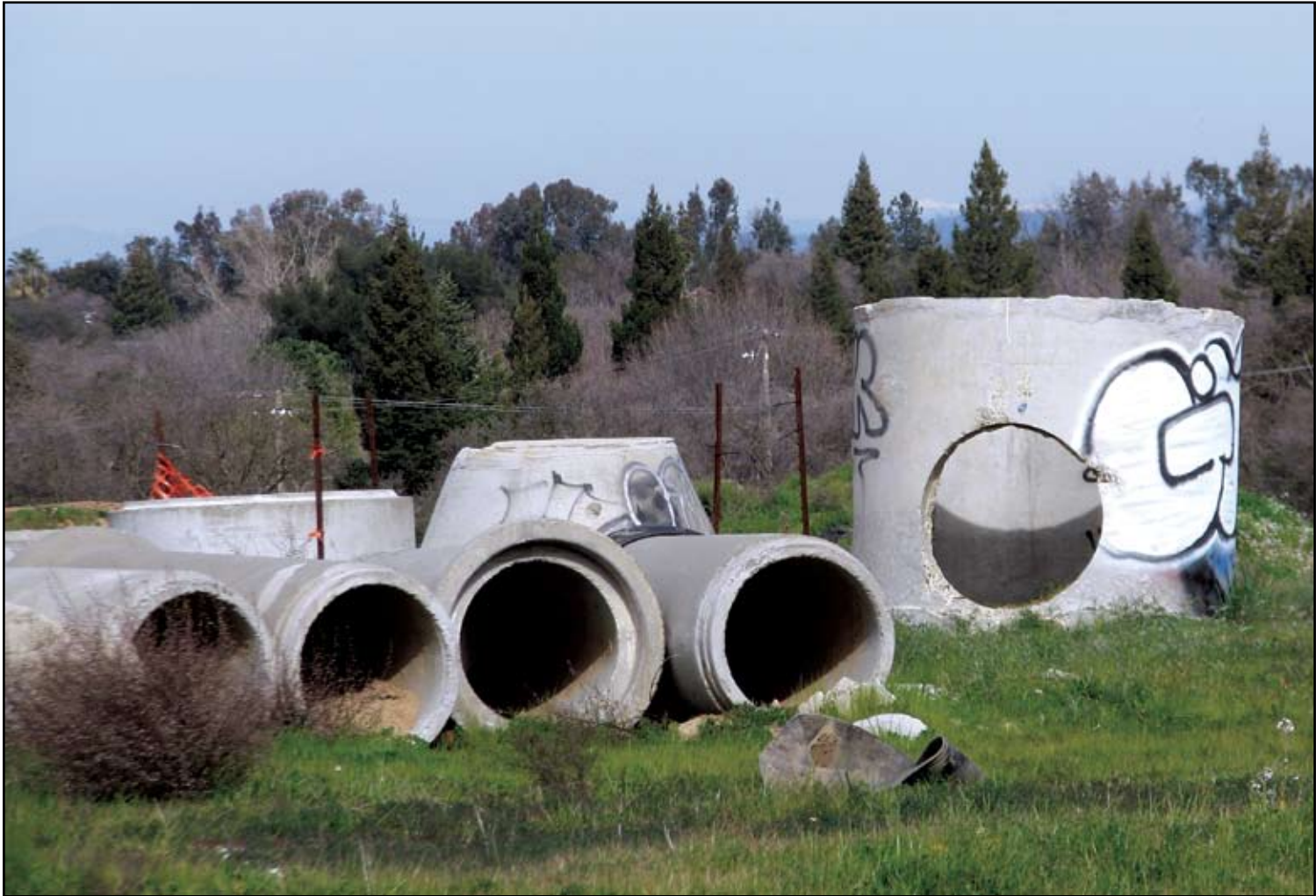
The opposition says if county officials give permission to rezone, it will open the door to making all of Gum Ranch apartment buildings.

PRESORTED STD. US POSTAGE PAID PERMIT 350 Carmichael, CA Change Service Requested