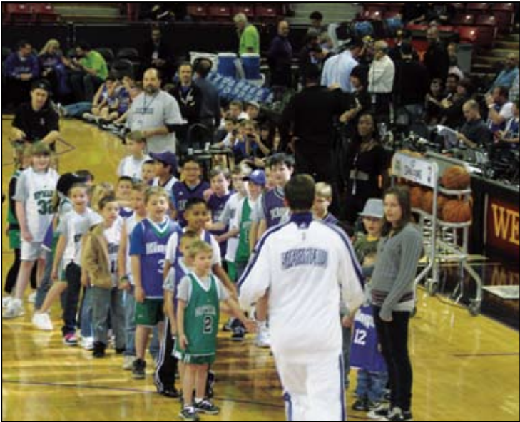
Upwards team members got a chance to “High 5” the Sacramento Kings as they entered the court at a recent game.

Fair Oaks - The local Upwards Basketball program just completed their second successful season with a growing group of kids, an enthusiastic team of volunteers, and grateful parents who appreciated the kind and caring coaching.