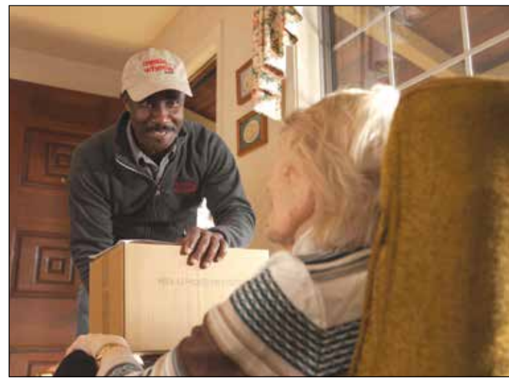
If you want to go deeper, consider becoming a driver for Meals on Wheels.

"The café population is a bit more mobile, and they love the idea of having a place to go each day during the week for a meal and contact with others," Bustamante said. "Those folks are also forming relationships with the volunteers and some of these centers where the cafes are, is like a second home