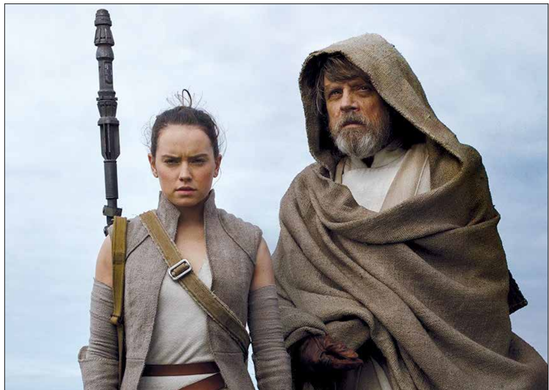
In "Star Wars: The Last Jedi," Mark Hamill shines, and what a thrill to see him swashbuckling almost as spryly as he did 40 years ago.