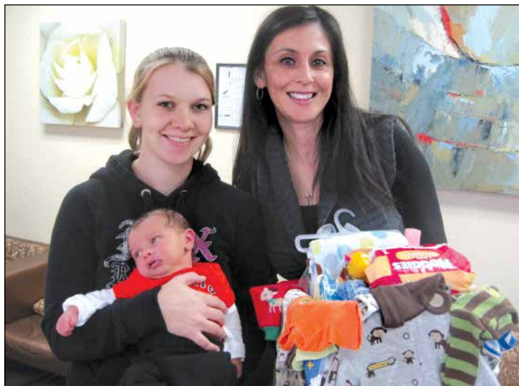
A Sacramento Life Center client receives a baby basket shortly after giving birth. The center is running its annual Baby Basket Drive through December.