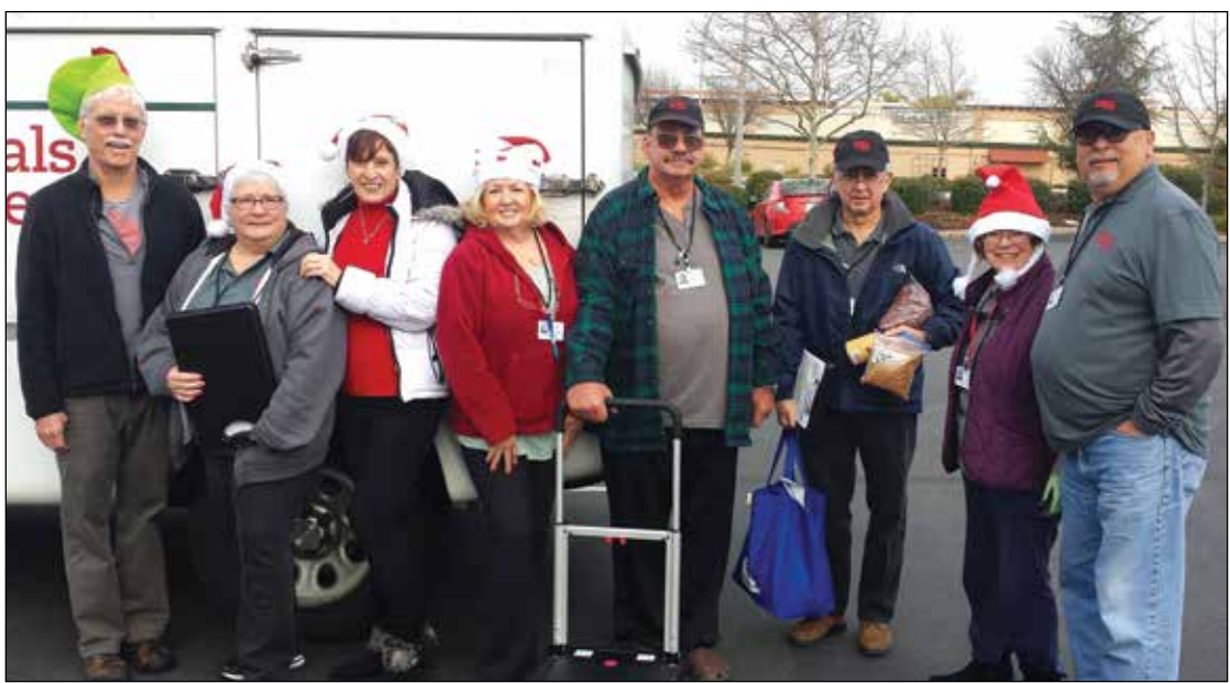
The non-profit provides roughly 500,000 meals and safety checks to roughly 1,500 home-bound seniors annually.