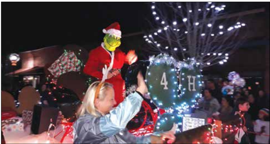
The Grinch caught a free ride on the Manzanita 4-H float.