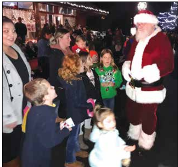
Santa showed his serious side before bursting into laughter as children tried to finagle more candy from him.

The parade kicked off with the honor guard and from there on out, float-after-brilliantly-lit float came rolling down