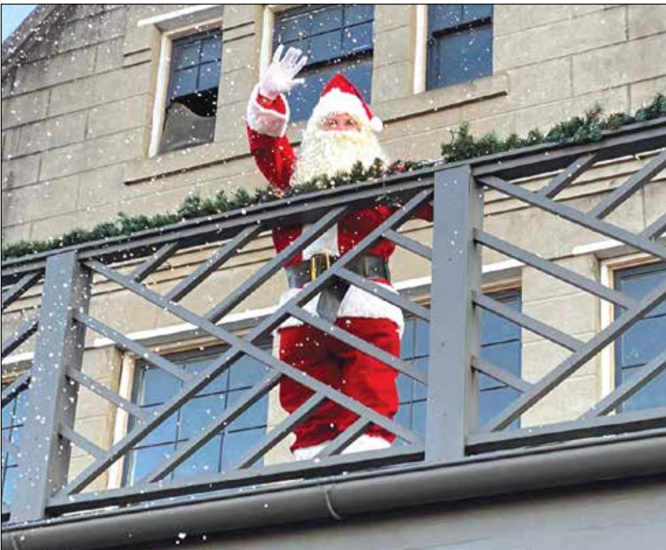
Out jumps good old Santa Claus! Santa waves down to the crowd as he descends from the rooftop of the Hotel Colonia.