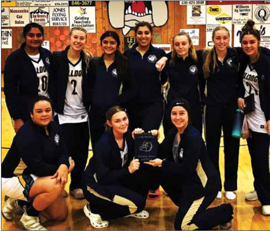
Gridley High School girls varsity basketball team poses for a picture after placing 2nd in the Lady Bulldog Holiday Classic Basketball Tournament on Saturday, December 7, 2019.