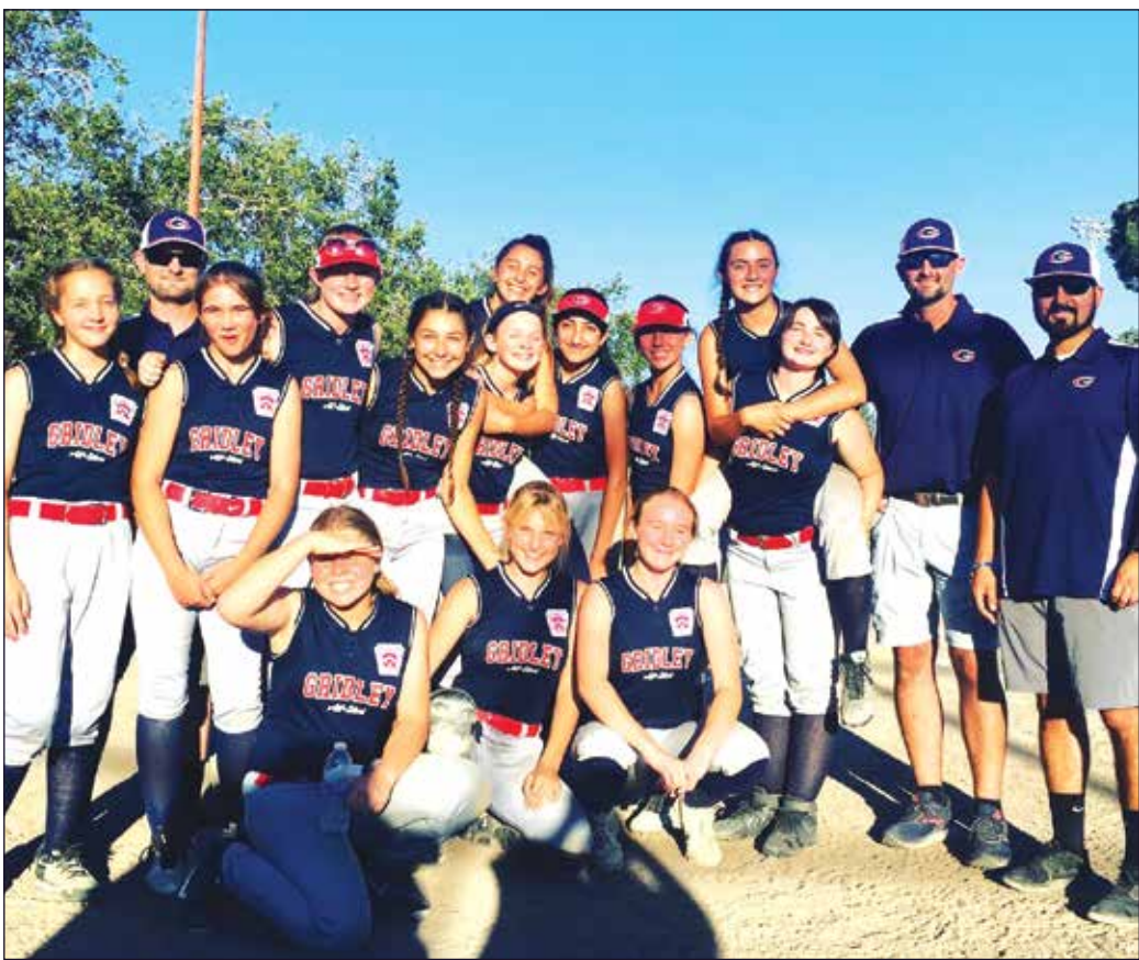
Gridley Majors All-Star team poses for a post game picture after battling it out in Orland against Willows on Thursday, June 20, 2019.

Biggs/Richvale Majors got their tournament started on Saturday, June 15th, in Orland against Willows. Biggs/Richvale would fall by a score of 8-2. They would hit the field again in Orland on Monday, June 17th, against Chico, and eliminate the Chico team from the tournament with a score of 20-11. On Tuesday, June 18th, Biggs/Richvale was at it again against Orland with a 17-7 victory. Unfortunately, Biggs/Richvale would fall to Gridley the next day and be eliminated from the tournament. ★