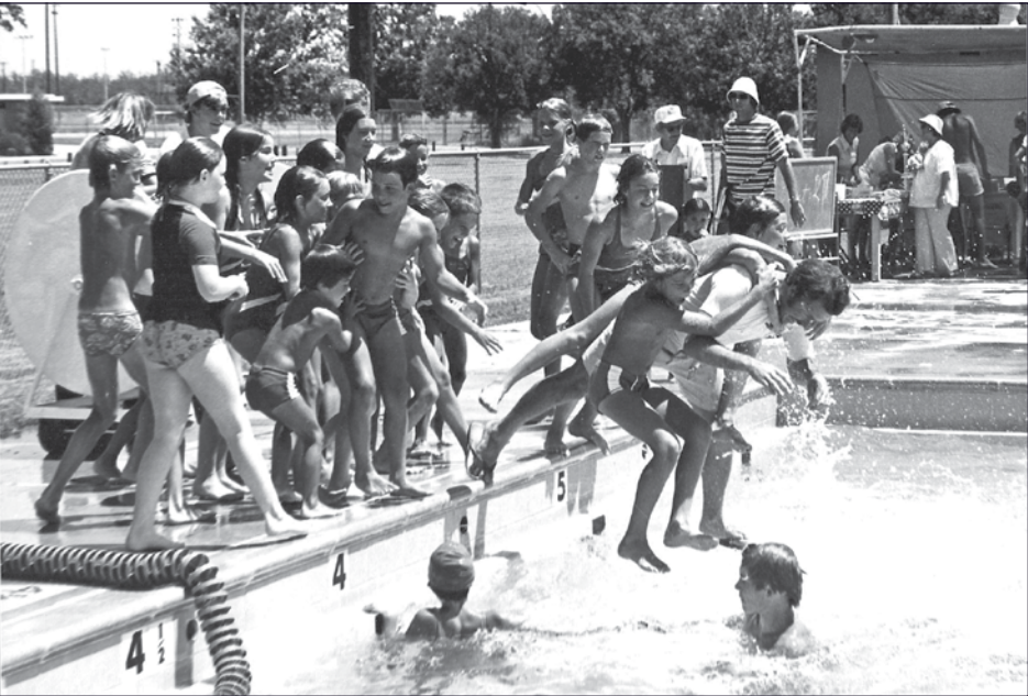
Gridley Go-Fish hit the water, circa 1970.

GRIDLEY, CA (MPG) - Come summertime, Gridley's Olympic sized pool becomes packed with Gators—Gridley Gators! This year marks the 50th anniversary of