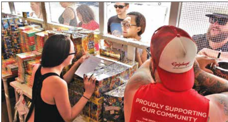
State-approved fireworks of all shapes, sizes and price points are a big fund-raiser for area non-profits from June 28 through the Fourth of July.

Phantom Fireworks is coming out with three new fountains this season. Sold as a