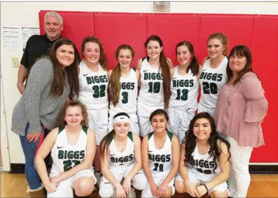
The Biggs High School girls basketball team won the Love Of The Game Tournament in East Nicolaus this past weekend. (Photo contributed)